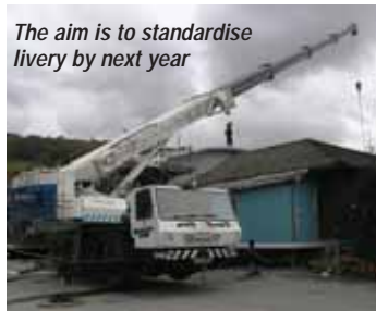
The aim is to standardise livery by next year