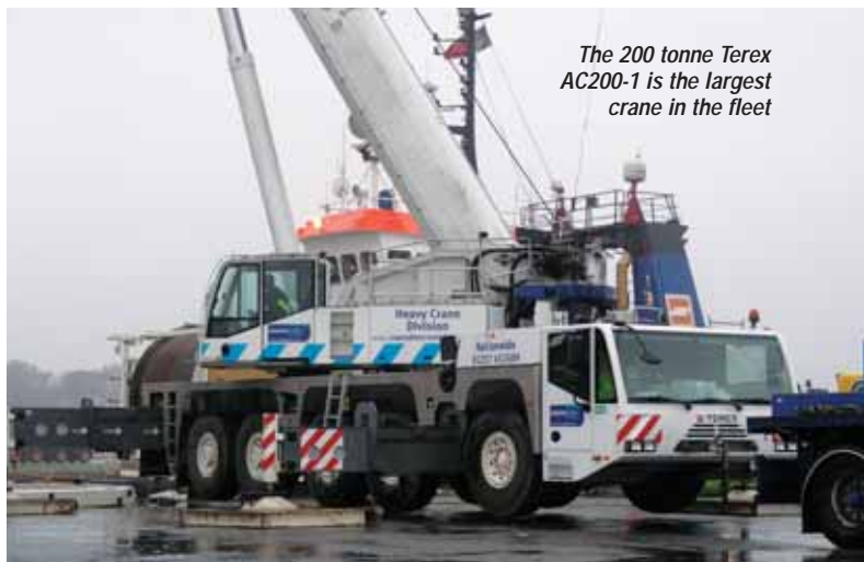
The 200 tonne Terex AC200-1 is the largest crane in the fleet

Rushlift is in the final stage of bidding for a major supply contract which would add about 30 percent