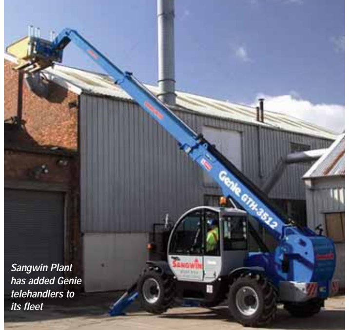
Sangwin Plant has added Genie telehandlers to its fleet