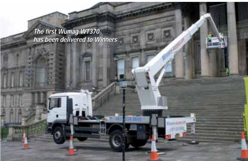
The first Wumag WT370 has been delivered to Winners

"We decided to purchase the Wumag WT370 from SkyKing as it was a natural progression in building up the fleet," said Gary Winn. "The new Wumag currently provides the greatest height and outreach in our fleet, enabling us to take on a wider variety of work".