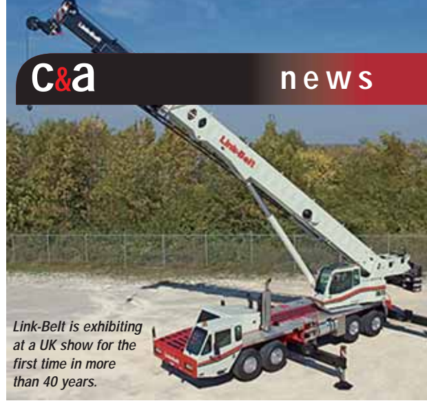
Link-Belt is exhibiting at a UK show for the first time in more than 40 years.

Concerns among potential buyers will naturally include the long term stamina of the company - particularly if the dollar regains its strength - to remain in the European market, together with its distribution and support. However given