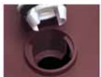
Precise maximum water level indicator