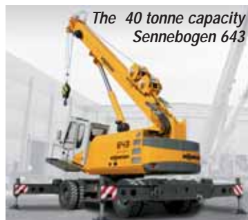
The 40 tonne capacity Sennebogen 643

says that it has eliminated unnecessary electronics in the machine in order to simplify maintenance and repair.