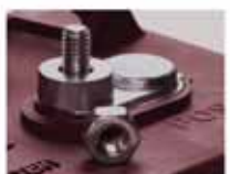
Durable embedded terminals