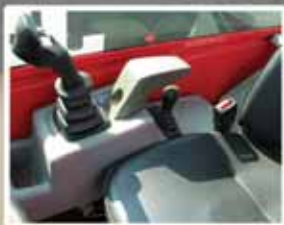
Joystick moves with operator's seat.