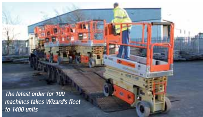
The latest order for 100 machines takes Wizard's fleet to 1400 units

Wizard is marketing the 2.9 metre platform height Bravi Lui-Mini as the 'Whizz'. The unit, which is beginning to generate some serious volume, offers a 1.7 metre long extended platform thanks to dual extensions, good gradeability, compact dimensions and only weighs 470kgs. The JLG 2033ES is a full sized 'skinny-mini' scissor lift with 360kg lift capacity and a 2.4 metre extended platform length. The company has also specified integral inverters, which convert the DC battery power into independent, on-board AC power to the platform.