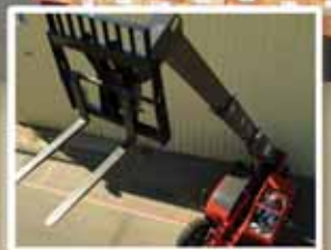
Impressive, maximum reach.