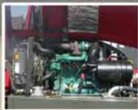
Easy engine access.