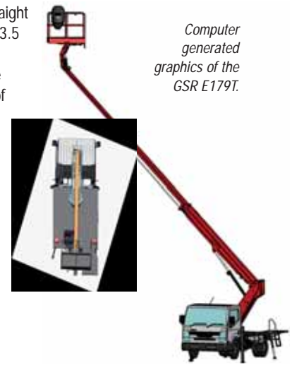
Computer generated graphics of the GSR E179T.

The lift will feature up to 11.1 metres of outreach, a lift capacity of 200kg, full hydraulic controls and all hoses mounted internally.