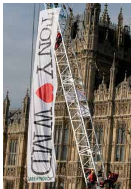
Four people spent the night in a crane boom on the river by Westminster bridge protesting against the Government's Trident renewal programme.

In spite of their efforts and the mass rebellion of Labour MPs the