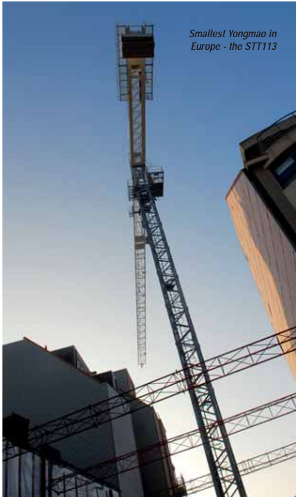
Smallest Yongmao in Europe - the STT113

Yongmao is the largest manufacturer of tower cranes in China and is in negotiations to add a third manufacturing plant to those in Fushun and Beijing. Delivery for the STT113 is said to be two months.