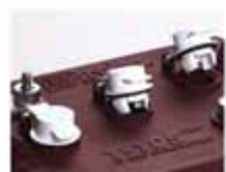
Convenient SureVent™ flip-top caps

Trojan's Plus Series offers the same premium performance you have come to expect from Trojan, plus the added features you asked for.