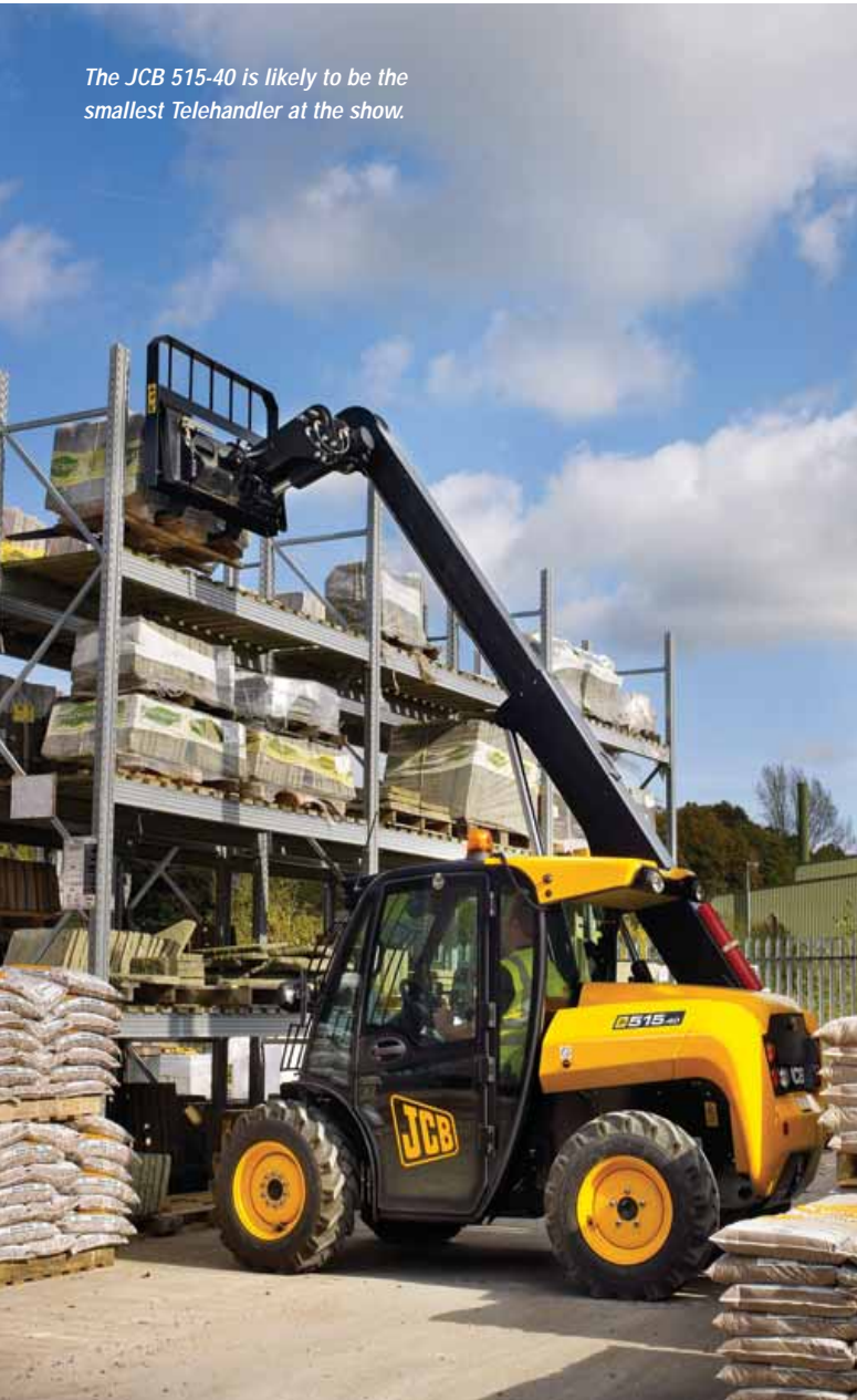
The JCB 515-40 is likely to be the smallest Telehandler at the show.

Centre of the crane display with be the SK 415-20 saddle jib tower crane in Maxim Cranes colours. Equipped with the new EVO15 cab and longer 80 metre/264ft jib at which radius the crane can handle 2.3 tonnes. A new HD23-TS212 transfer mast is available, which provides a free standing height of