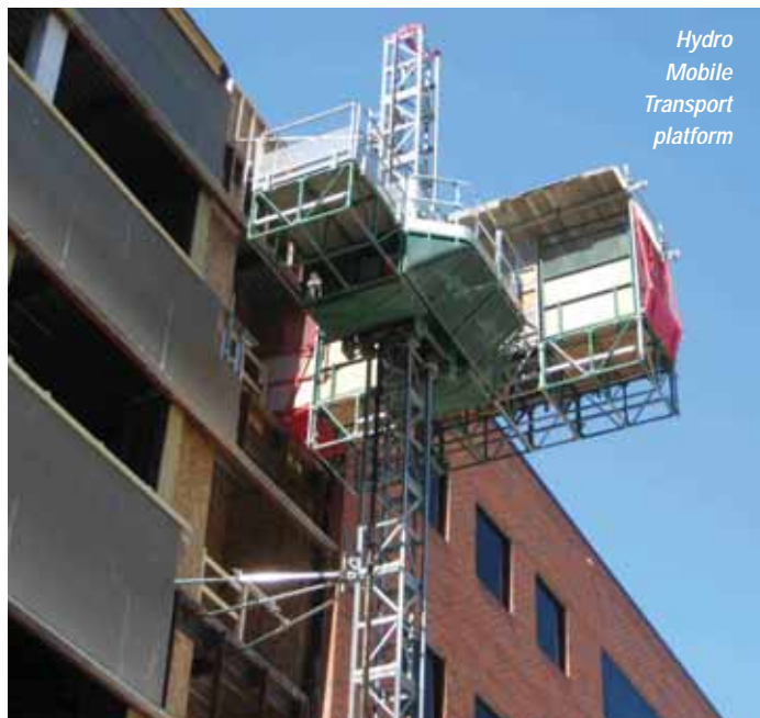
Hydro Mobile Transport platform

It is also offering a number of educational seminars during the show which will be worth a look, as well as sponsoring some state of the art crane simulators on the Crane Rodeo at the back of the Gold Lot. Orlaco is demonstrating its latest camera systems with specific focus on tower crane systems that employ a boom or jib-trolley mounted camera – still a grossly underrated safety device.