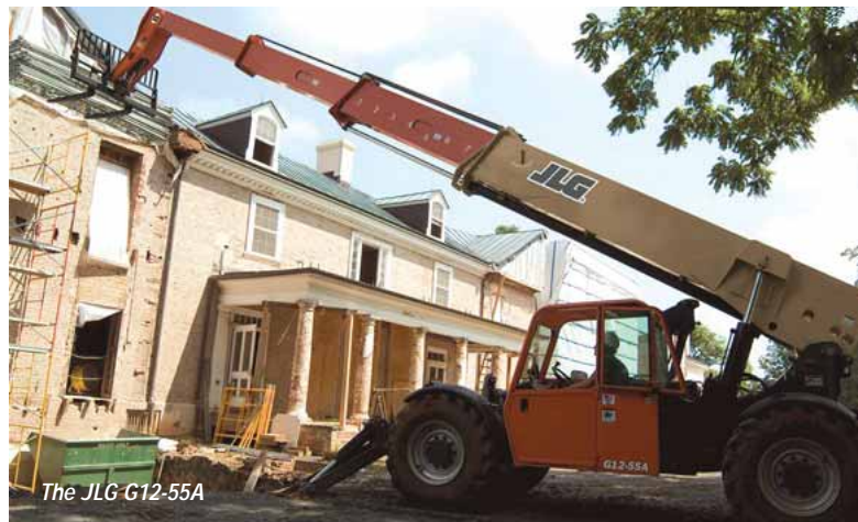
The JLG G12-55A

Socage will unveil its new 20 metre DA365 dual riser articulated boom lift, developed for the US market from its DA320 with over nine metres of unrestricted outreach and 250kg platform capacity. The new platform will be shown on a Ford F-550 pick-up installed by Stamm Manufacturing of Fort