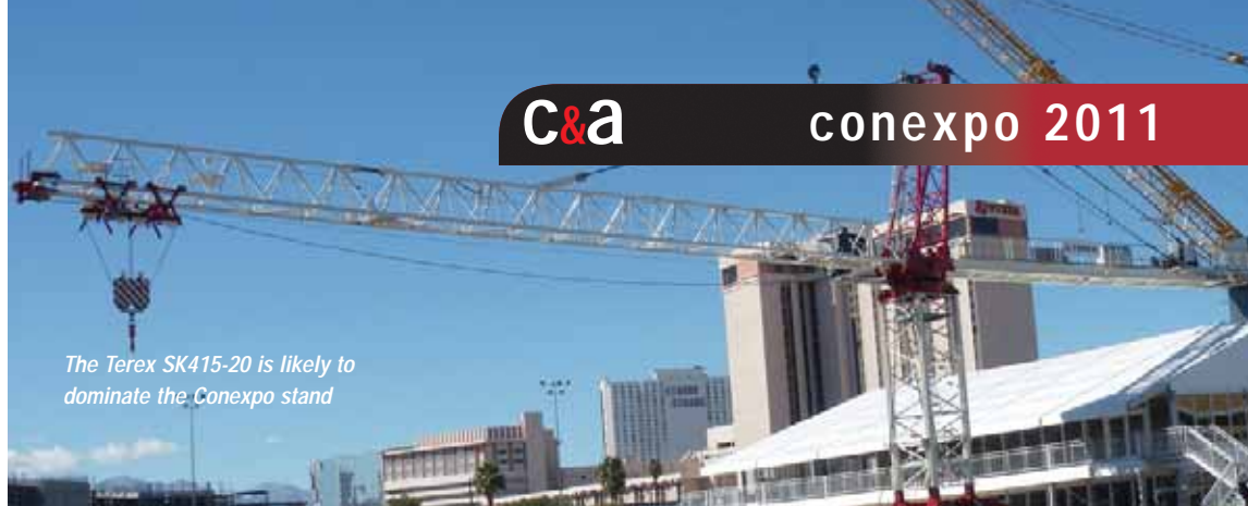
The Terex SK415-20 is likely to dominate the Conexpo stand

Hydro Mobile The Canadian manufacturer of heavy duty and special mast climbers will be showing its F Series TP transport platform, possibly alongside the E Series lighter duty rack and pinion mast climber. The company also distributes Raxtar hoists in the USA.