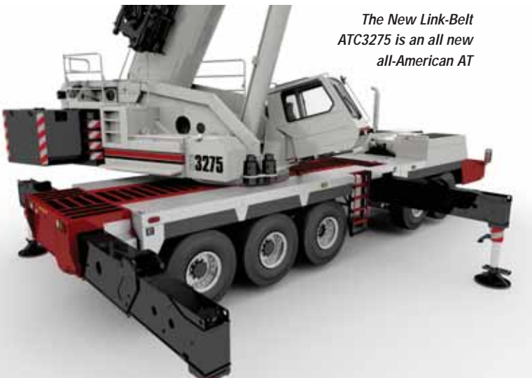
The New Link-Belt ATC3275 is an all new all-American AT

The company may also show a version that has an off-centre platform that is flush with the chassis on one side, while extending beyond the chassis