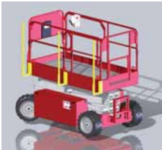
The MEC Crossover aims to introduce a new scissor lift category

MEC will also show a range of platform attachments for its massive Titan 40S boom come scissor lift, including a pipe rack and a glazing storage rack.