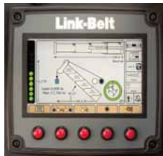
The new Link-Belt Pulse system MEC

extend mode controller, self-diagnostic capabilities and continuous monitoring of multiple crane functions and conditions. The system has been on field trials for more than a year and is, says Link-Belt, bulletproof in terms of reliability. The Pulse system will be installed on the TCC-1100, HTC-8690, RTC-8090 Series II, and ATC-3275.