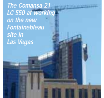
The Comansa 21 LC 550 at working on the new Fontainebleau site in Las Vegas

Las Vegas-based Xtreme will launch an upgraded and extended version of its top of the line fixed from a telehandler the XR1267 which will become the XR1270 with a 21.2 metre lift height.