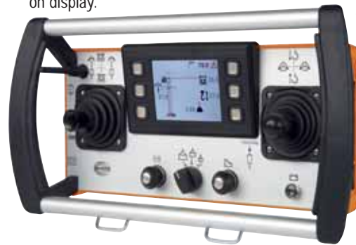
HBC Radiomatic Spectrum D

harsh sun, while making the most of the latest crane system displays. Autec is also introducing new products in the form of its Dynamic Series with three new transmitters on display.