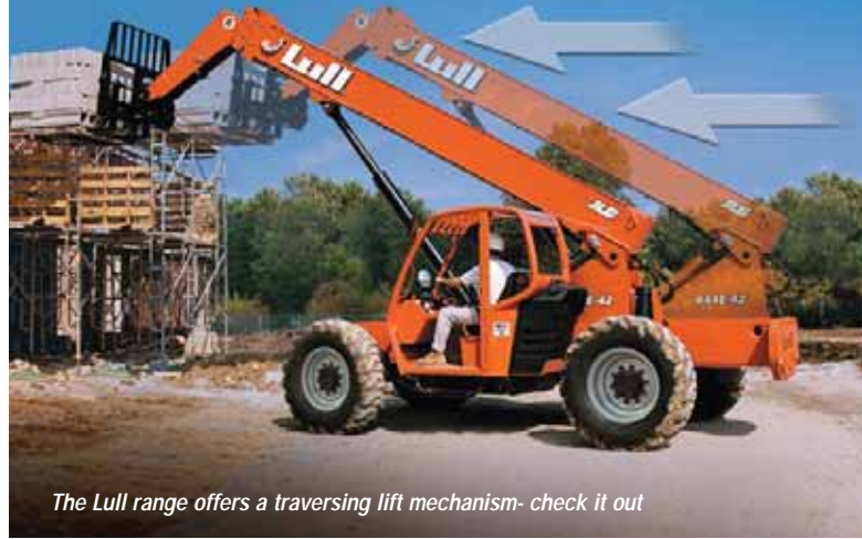
The Lull range offers a traversing lift mechanism- check it out