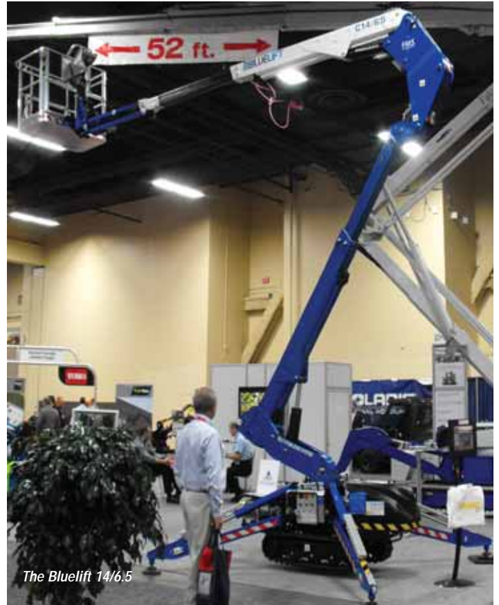
The BlueLift 14/6.5