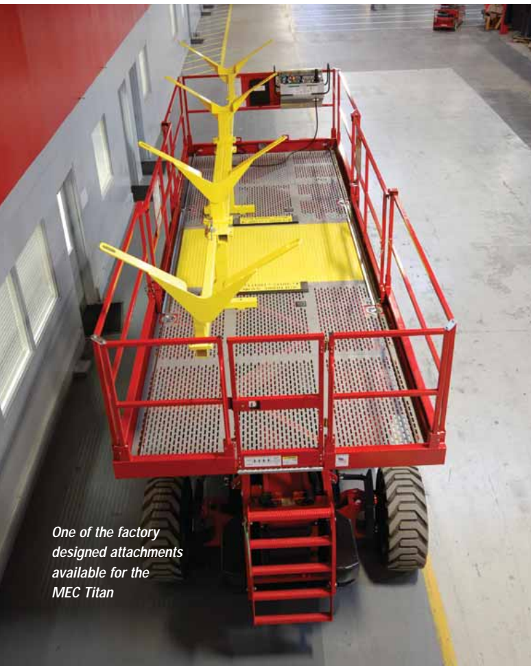
One of the factory designed attachments available for the MEC Titan

We covered JLG's aerial lift plans in our main Conexpo coverage but we now know what the company is planning in terms of telescopic handlers. Its three brands will be represented with six models, including the top of the line JLG G12-55A and the super compact JLG G5-18A, which can be configured to accommodate skid steer attachments. The JLG 4017PS European style unit will be on display for International visitors, and for curiosity factor one of its Military Atlas II units. The SkyTrak line will be represented by the