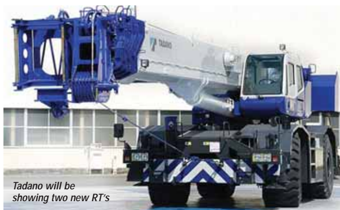
Tadano will be showing two new RT's