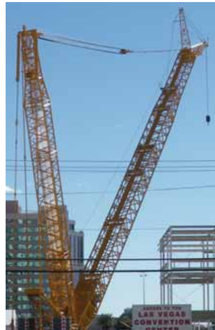
The 600 tonne Liebherr LR1600/2 will be one of the larger cranes on display

Another stand with much that's new is California-based MEC. It will unveil a new 26 and 32ft Crossover scissor range, intended to blend the compact dimensions of a slab mini scissor with some off slab ground clearance and traction. It is intended to offer users a product that can handle all of the classic applications for 2646/3246 type slab scissors, but also cover the