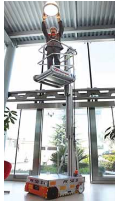
The new PK50S has a three metre platform height and weighs less than 300kg.

Italian aerial lift manufacturer Faraone has launched the PK50S - a new 10ft/three metre platform height self-propelled lift that weighs less than 300kg. The new model is a combination of the company's aluminium mast and all alloy platform. The ultra compact unit measures just 750 mm wide by a metre long and weighs just 290kg - lower than some push around lifts. One trade-off for this low weight is that drive is cut-out above two metres. The new lift includes wheelchair drive and steer technology and incorporates passive pothole/kerb protection. The