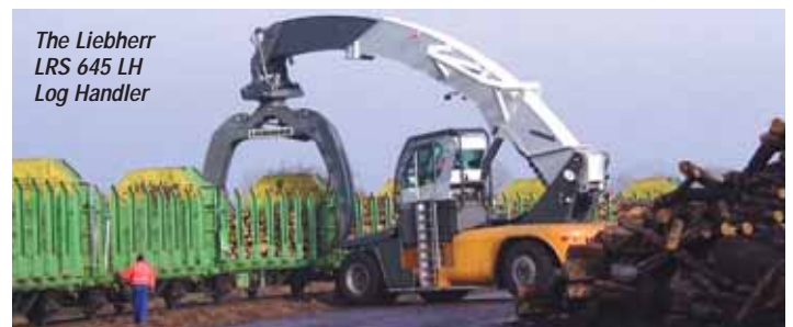
The Liebherr LRS 645 LH Log Handler

Liebherr has introduced a log handling version of its LRS 645 reach stacker for large lumber yards. The LRS 645 LH Log Handler is designed to optimise wood yard storage space and wood yard maintenance costs, says Liebherr. It is particularly targeted at pulp and paper mills, chipboard or saw mills and wood terminals. The LRS645LH has a maximum lifting capacity of 30 tonnes at an outreach of up to 5.5 metres. The unit can lift up to a 12 metre height and extend to 10 metres radius, but can also lift logs from six metres below ground level. Its grab can be rotated through 360 degrees as well as pivoting forwards, backwards and sideways. The first unit has been delivered to Szepianiak, a wood handling specialist operating paper and saw mills in Finland.