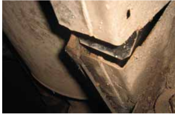
The chassis failure with the rear radius arm fixing to the bottom right.

Initial reports suggested that the problem might have been caused by an extended Overland cab pushing the platform further back from the engine, however there are reports of other platforms with regular cabs having also failed, seeming to rule out this as a possible cause. The first failure was on a 2009 Land Rover Defender 130 - the machine's two chassis rails that carry the vehicle's body, engine and transmission fractured. Fortunately the incident occurred