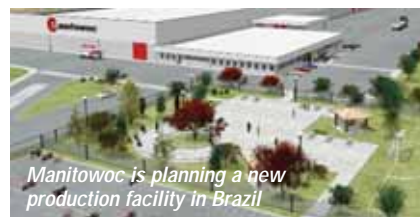
Manitowoc is planning a new production facility in Brazil

Manitowoc Cranes has confirmed that it will build its first South American production facility in Paso Fundo, in Southern Brazil. Construction of the 25,000 square metre plant is expected to begin 60 days