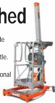
The new ANSI version of the JLG FS60 LiftPod

JLG has announced a new version of its FS60 1.8 metre platform height LiftPod. The FS60 has a new 762mm wide steel base and has been re-engineered to pass through doorways and into elevators without the need to dismantle. The unit still breaks down into three components for transport and can be powered by a power drill or an optional power pack. The new FS60 will be priced in the USA at under $2,000. The higher, 2.4 metre platform height FS80 is still available.