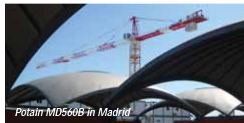
Potain MD560B in Madrid

Potain has added a new 550 tonne/metre tower crane – the MD560B - at the top end of its MD range designed for infrastructure work, such as dams and bridges. The new crane is said to offer better jib tip capacities and load curves in most configurations. When working with an 80 metre jib the 25 tonne MD 560 B can handle 5.4 tonnes at the jib tip, while the 40 tonne version can take 7.5 tonnes to 70 metres. Tie bars are integrated into the counter jib for faster, safer erection and each component has a clearly positioned identification plate. The jib can either be assembled in the air in three separate pieces or on the ground and placed as a single component, depending on available space and the size of the mobile crane. Two prototypes, both 25 tonne models, are working for contractor Dragados on a major expansion to Madrid's Atocha rail terminal. The cranes will stay on the job for 12 months and will eventually reach working heights of around 49 metres.