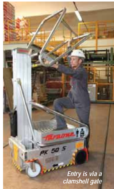
Entry is via a clamshell gate

platform capacity is one man/200kg and is available with a special stock picking platform. The company has also unveiled a push around version of the same lift with short stubby rolling outriggers - the PK53 - which boasts the same platform capacity, same five metre working height but weighs just 160kg.