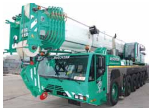
UK-based McGovern has purchased a 200 tonne Terex AC200 with six axle carrier.

Tommy McGovern said: "The AC 200-1 is an extremely compact crane - a full metre shorter than some competitors - giving it a distinct advantage when working in confined areas. Where access is tight, a metre can sometimes make all the difference."