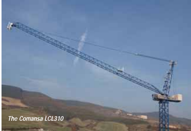
The Comansa LCL310

tonnes capacity at the jib tip and 53 to 57 metre free standing heights. A new longer Panoramic XL cab has also been tested on the LCL prototypes and will be available as an option.