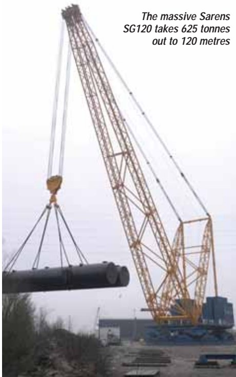
The massive Sarens SG120 takes 625 tonnes out to 120 metres

Sarens new 3,250 tonne SG120 heavy lift crane is now built, erected and on test. The massive 120,000 tonne/metre heavy-lift ringer crane was photographed taking a 625 tonne test load out to 120 metres radius on its 130 metre main boom – a 125 percent overload test lift. The new crane has an impressive capability and will meet all current crane regulations and standards, including EN13000.