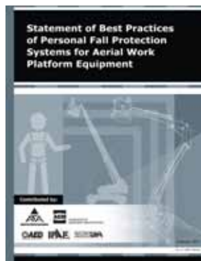
OSHA regulations and ANSI standards both reference fall protection when using boom lifts.

A new Best Practice guide covering fall protection for users of aerial work platforms has been issued by the American Rental Association (ARA), the Association of Equipment Manufacturers (AEM), the Associated Equipment Distributors (AED), the International Powered Access Federation (IPAF) and the Scaffold Industry Association (SIA). The publication, entitled 'Statement of Best Practices of Personal Fall Protection Systems for Aerial Work Platform Equipment,' is intended to address confusion and apparent contradictions in the USA over when and in which machines a harness and lanyard are required. In essence it says that when using booms and vehicle mounted lifts a harness must be worn with a short fall restraint lanyard, while they are not normally required in scissor and vertical type lifts.