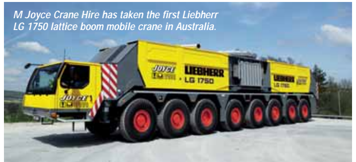
M Joyce Crane Hire has taken the first Liebherr LG 1750 lattice boom mobile crane in Australia.

Specialist IT solutions for the rental industry