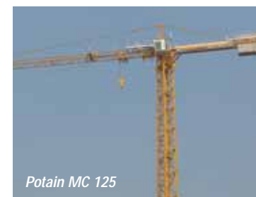
Potain MC 125

Manitowoc has started building the new Potain MC 125 quick erect tower crane at its plants in Zhangjiagang, China and Pune in India. The MC 125 is a city-type crane with saddle jib design, incorporating several design innovations including a single-tie jib which can be assembled at ground level and lifted in a single piece. Maximum jib length is 60 metres at which it can lift 1.15 tonnes. Maximum free-standing height is 44 metres and maximum capacity six tonnes. The MC 125 - as with all Asian-made Potain cranes - is designed and manufactured in accordance with FEM standards but will only be available in Asia, South America, the Middle East and Eastern Russia.