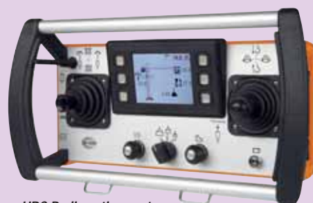
HBC Radiomatic spectrum