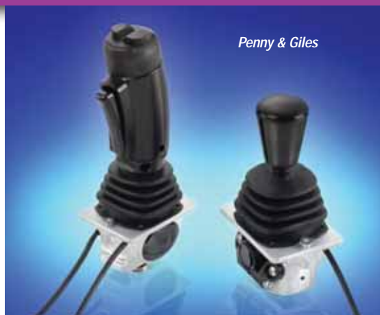
Penny & Giles

South Hall and HBC Radiomatic and its new remote controllers. The new spectrum D transmitter comes with a 3.5" color TFT non-reflective display screen allowing it to be seen clearly in harsh sun, while making the most of the latest crane system displays. In the same hall Autec is introducing its Dynamic Series with three transmitters on display – the FJS, FJL and FJM. All can send both proportional and digital commands and receive data feedback messages that appear on the display. Next stop is Hirschmann-PAT and its new wireless sensors and in-cab consoles. The company is also offering a number of educational seminars during the show so stop by to find out more. In the Hilton Centre Orlaco is demonstrating its latest camera systems. A boom or jib-trolley mounted camera provides the operator with a significant tool to help improve safety – yet their use is still the exception, rather than the rule.