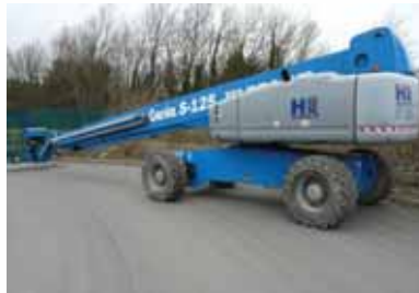
Genie S125 4x4, full CE specification. 40.0m 2007 £ 62,500