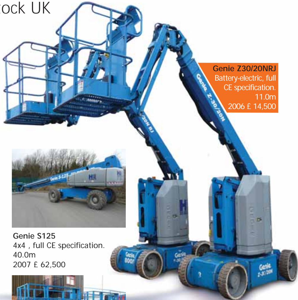
Genie Z30/20NRJ Battery-electric, full CE specification. 11.0m 2006 £ 14,500