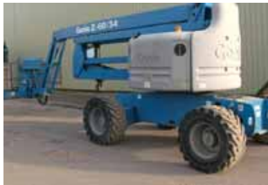
Genie Z60/34 4x4, articulating boom, full CE specification. 20.0m 2005 £ 25,000, 2006 £ 29,000