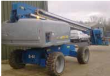
Genie S65 4x4, full CE specification. 22.0m 2005 £ 24,000, 2006 £ 28,000, 2008 £ 37,500