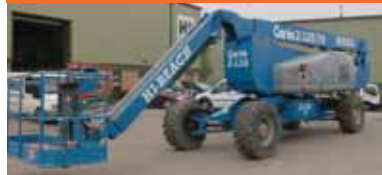
Genie Z135/70 4x4, articulating boom, full CE specification. 43.0m 2005 £ 76,000

UNDER OFFER please contact us for alternative units