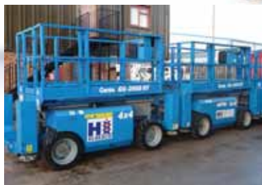
Scissor Lifts including GS 2668RT and GS 5390 – please call for more information

UNDER OFFER please contact us for alternative units