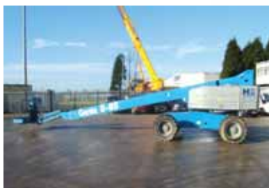
Genie S85 4x4, full CE specification. 28.0m 2006 £ 38,000