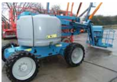
Genie Z45/25J 4x4, articulating boom, full CE specification. 15.5m 2006 £ 18,000, 2008 £ 22,000