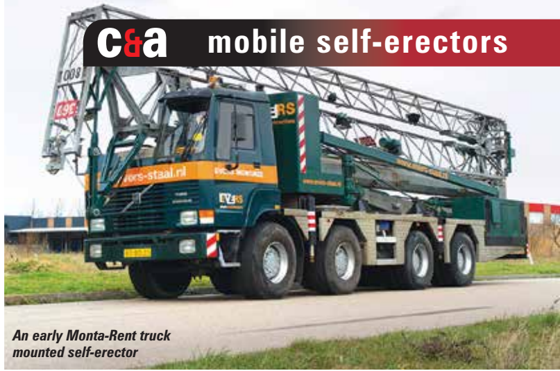
An early Monta-Rent truck mounted self-erector

seven axle cranes. City Lifting was possibly the first company in the UK to truly appreciate the potential of a mobile tower crane when it purchased its first - a Spierings - in 2002. The crane was the 10th unit the specialist Dutch manufacturer had ever built. It has gone on to sell around 900 units since then all over the world. Although outside of Europe they are still a rare sight.