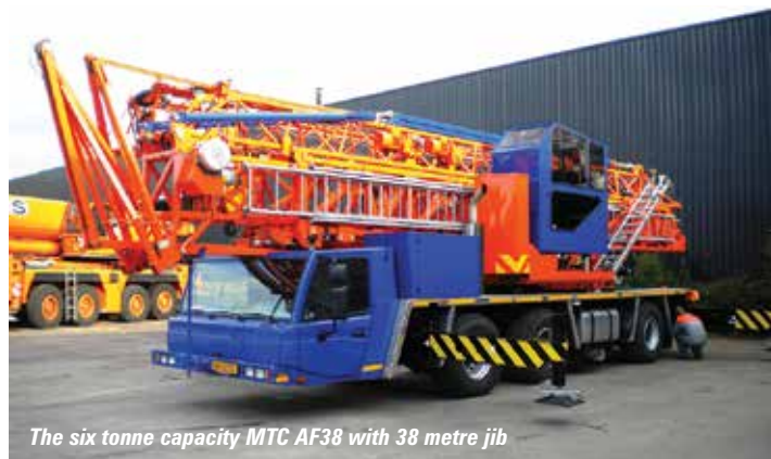
The six tonne capacity MTC AF38 with 38 metre jib

The company did show a new A45D City mobile tower crane at