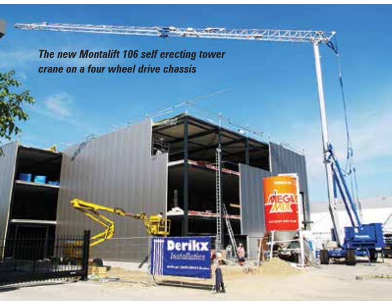
The new Montalift 106 self erecting tower crane on a four wheel drive chassis

The range and levels of price and sophistication of mobile tower cranes is varied but all achieve the prime objective of a quick set-up alongside a facade. The fact that there are so few mainline manufacturers of this equipment provides a clue as to how popular (or not) these cranes are in comparison with All Terrain or Rough Terrain cranes. However as mentioned earlier, they are often the only crane capable of carrying out particular lifts cost-effectively. Countries like the UK and USA have never taken self erecting tower cranes to heart on jobs such as residential estates, unlike Continental Europe, probably due to their preference to rent what was available or use other methods, such as telehandlers etc.... Whether this will be the case in the future remains to be seen. Surely it is only a matter of time before crane users around the world start to appreciate the undoubted benefits of the mobile tower crane?