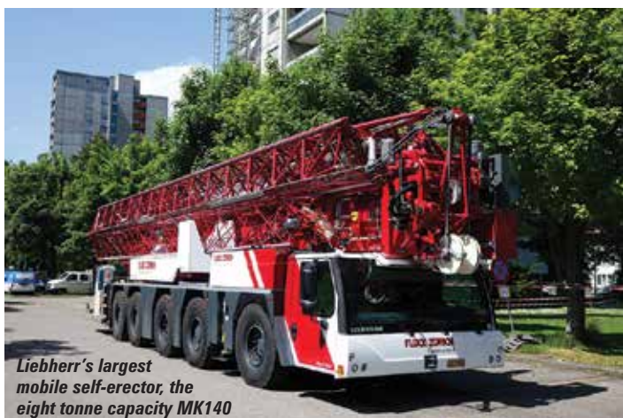
Liebherr's largest mobile self-erector, the eight tonne capacity MK140

In the mobile tower crane feature a year ago we concentrated on the mobile tower cranes from the two main manufacturers Spierings and Liebherr. There are however, other mobile tower cranes (truck, trailer and tracked) and we will be looking at these in more detail later on.