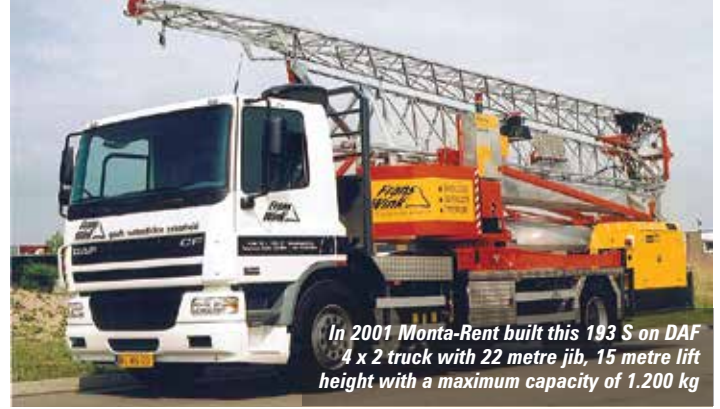
In 2001 Monta-Rent built this 193 S on DAF 4 x 2 truck with 22 metre jib, 15 metre lift height with a maximum capacity of 1.200 kg

Action Construction Equipment (ACE) in India is one of the few other producers of mobile self