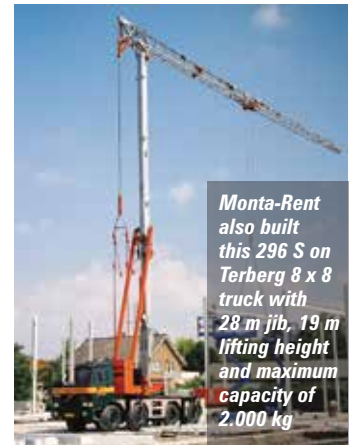
Monta-Rent also built this 296 S on Terberg 8 x 8 truck with 28 m jib, 19 m lifting height and maximum capacity of 2.000 kg

The MTC 2418 is self propelled mobile tower crane mounted on an articulated dump truck-type chassis which gives a very tight turning radius and easy positioning. The crane has a maximum radius of 18 metres with 550kg capacity. Maximum capacity is 1,600kg at 7.5 metres. With the jib raised 30 degrees the maximum hook height