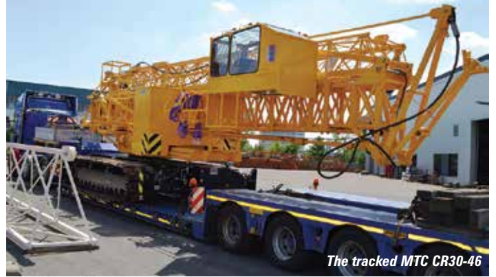
The tracked MTC CR30-46