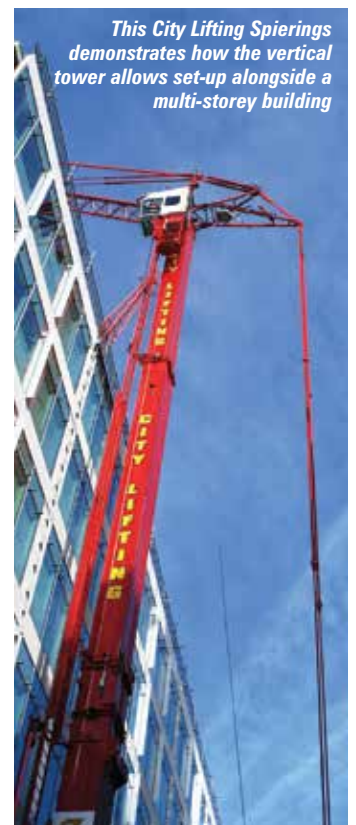
This City Lifting Spierings demonstrates how the vertical tower allows set-up alongside a multi-storey building

The operator's cab can be raised up the tower to a point above the building's façade and get a prime view of the lift, particularly when working on roofs and lifting over buildings. The cranes have fast work cycles and are substantially more fuel efficient and therefore environmentally friendly than the equivalent larger All Terrains - a big advantage with the increasingly stringent engine emission regulations in major cities. One man can erect and operate the crane and there is no need for additional transport, keeping costs to a minimum. And finally they are very quiet when in operation and have