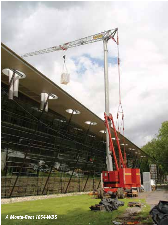
A Monta-Rent 1064-WDS

metre jib with a 1,150kg capacity at the tip, although the hook height is the same at 23 metres.