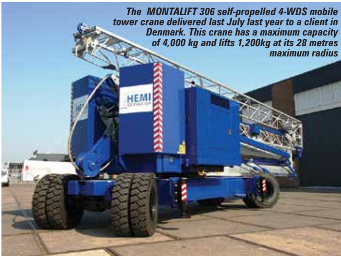
The MONTALIFT 306 self-propelled 4-WDS mobile tower crane delivered last July last year to a client in Denmark. This crane has a maximum capacity of 4,000 kg and lifts 1,200kg at its 28 metres maximum radius

The hydraulic self-erecting concept combined with the radio remote control were important developments, but Monta-Rent developed and added the mobility to the tower crane. It also carries out all the engineering and sells the cranes under the Montalift