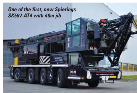
One of the first, new Spierings SK597-AT4 with 48m jib

The largest fleet of mobile tower cranes in the UK is operated by London-based City Lifting. The company currently has 16 Spierings cranes with a further two - one six and one four axle crane - on order. Its fleet includes almost equal numbers of three, four, five, six and