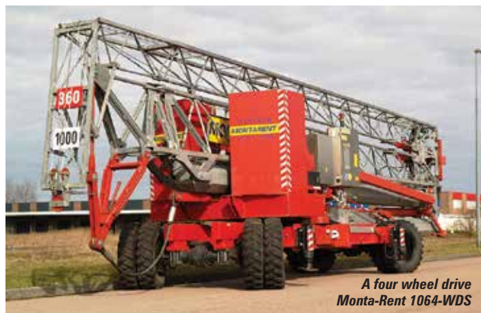
A four wheel drive Monta-Rent 1064-WDS

The Lieberr MK 88 was launched at Intermat in 2009 so celebrates its seventh birthday this year. Given its age, its performance and features when compared to the new Spierings SK 597-AT4 are still good. Spierings makes a feature of its new disc brakes, the MK 88 already has these, although road speed is a little lower at 75kph compared to the SK 597's 83kph and it loses out in the engine emission stakes against the latest Euro 6 DAF.