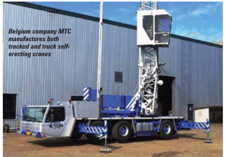
Belgium company MTC manufactures both tracked and truck self-erecting cranes

Bauma 2007 but since then new model launches have been scarce. It currently has two cranes - the Faun carrier mounted AF38 and the track mounted CR30-46. The AF38 has a