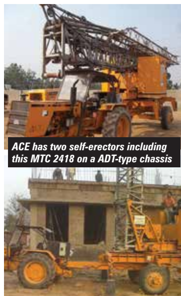
ACE has two self-erectors including this MTC 2418 on a ADT-type chassis