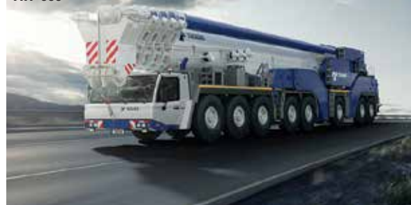
The star of the Tadano stand will be the new 600 tonne tri-boom ATF 600