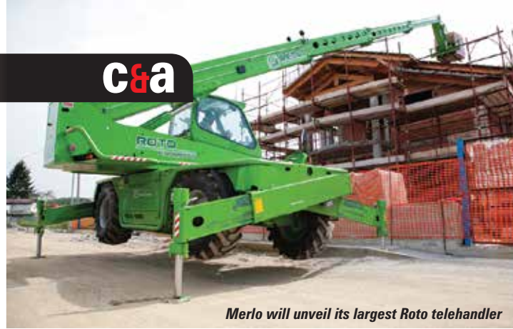
Merlo will unveil its largest Roto telehandler

Merlo is due to ship its 100,000th telehandler this year, since production started in the 1980s - will the timing be right for Bauma? The company is not saying. Three new models will be on the stand,