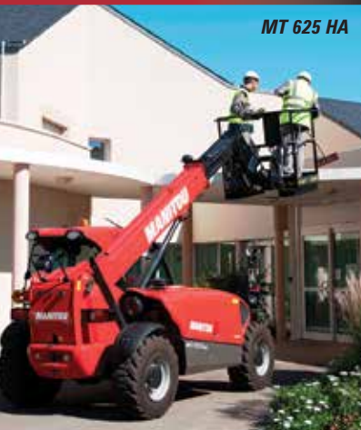
MT 625 HA

autumn availability, and the larger 17.55 metre/4,000kg MT 1840 Easy later in the year. For those interested in mast-type forklifts a new two wheel drive, seven tonne capacity M70-2H will be on the stand.