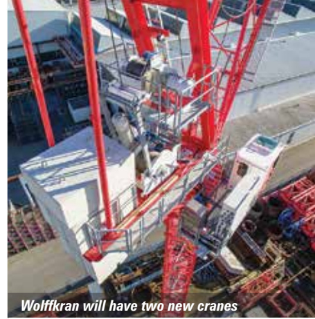
Wolffkran will have two new cranes

Potain tower cranes will include the Igo M 14 self-erector and the European debut of the 24 tonne MR 418 luffing jib crane with 60 metre jib. The new MDT 389 is the first of a new line of Topless - flat top - cranes. At 16 tonnes capacity it is