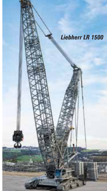
Liebherr LR 1500

The new 50 tonne 653E telescopic crawler crane has a 30.4 metre four section full power boom plus a 6.5 to 13 metre offsetting swingaway extension for a maximum tip height of 45.4 metres. The crane - which is sold in the Americas as the Grove GHC55 - has load charts for working on inclines up to four degrees and can pick & carry its full capacity.