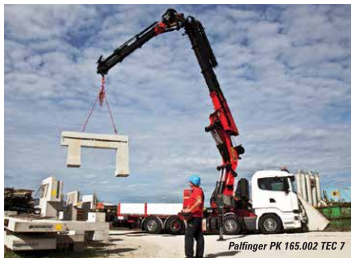
Palfinger PK 165.002 TEC 7

Other features include larger - 200mm higher - stronger car doors and strengthened aluminium flooring, allowing for larger car sizes up to five metres long with higher capacities up to 3,200kg. An extension option in the hoist roof allows items up to four metres long to be carried.