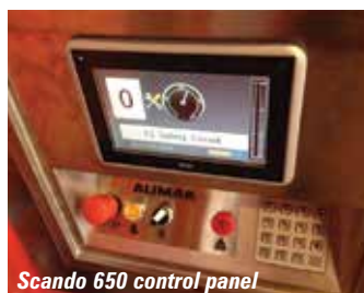
Scando 650 control panel