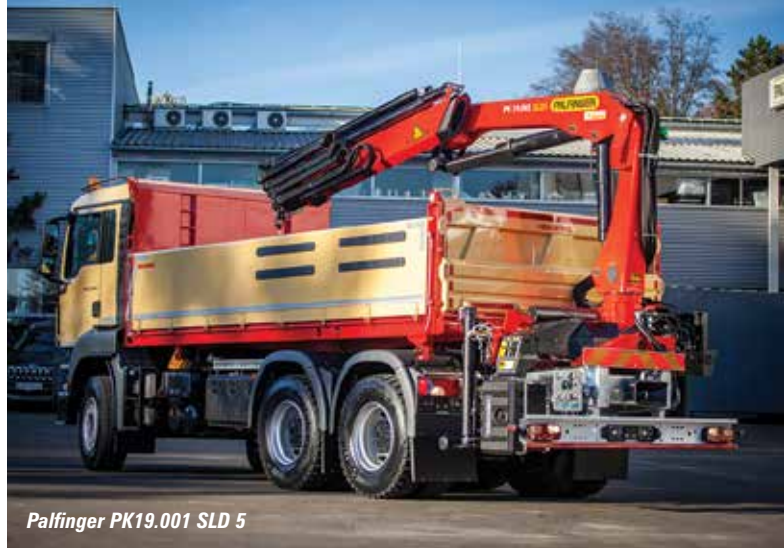
Palfinger PK19.001 SLD 5

Skyjack will launch two new products the 40ft SJIII 4740 DC slab electric scissor lift and the 30ft SJ30 ARJE battery powered articulated boom with rotating jib. The SJIII 4740 is the highest narrow aisle electric scissor lift Skyjack has ever produced. With its 14 metre working height and the compact dimensions of the SJIII series. Platform capacity is 350kg and overall width just under 1.2 metres. The SJ30 ARJE has a working height of 11 metres and maximum capacity of 227kg. It is an industrial boom, with short dual risers, two section telescopic boom and