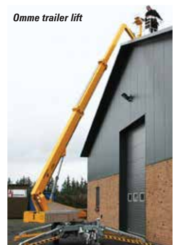
Omme trailer lift

The second new model is the 37 metre 3710 RBDJ spider lift, which replaces the 3700RBDJ. A key change is the new seven section boom with a six-sided profile to help improve strength and rigidity, topped by a 130 degree articulated jib. Maximum platform capacity is now 250kg, while maximum outreach is 14.2 metres. Boom elevation and telescope can be