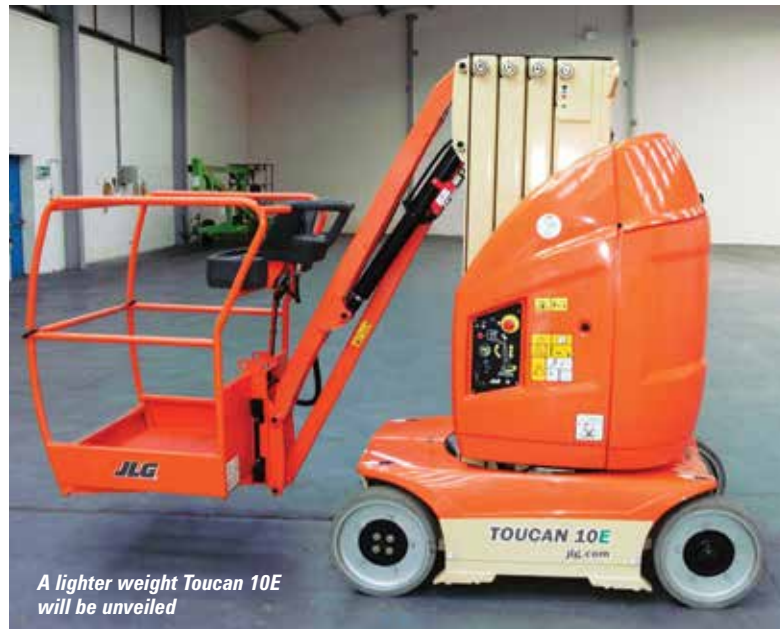
A lighter weight Toucan 10E will be unveiled

CTE will show off its new B-Lift truck mounted platforms with an innovative S3 (Smart Stability System) stabiliser system. The new range will be represented by a 39 metre B-Lift 390 High Range, the smallest model in the High Range - topped by a 61 metre unit – which