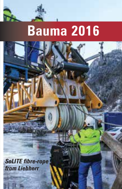
SoLITE fibre-rope from Liebherr