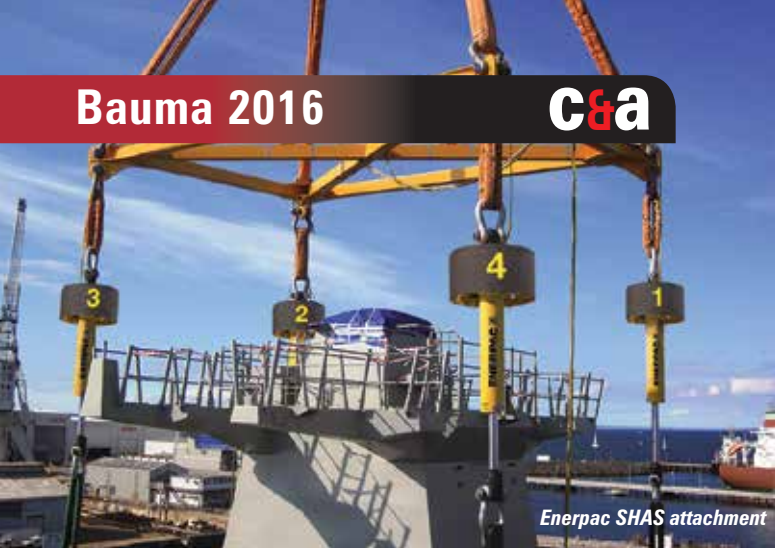
Enerpac SHAS attachment

with an integrated pump and remote controls, this allows a single operator to control the precise final positioning from a safe distance. The system can perform several types of movements including synchronous lifting and lowering, balancing and tilting, all of which can be pre-programmed.