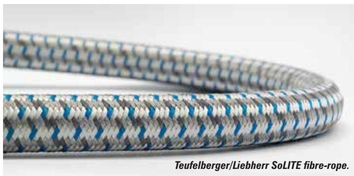
Teufelberger/Liebherr SolITE fibre-rope.

While no details have yet been provided, expect to see a new truck mounted lift in the 70 to 75 metre range to top out the company's XR range.