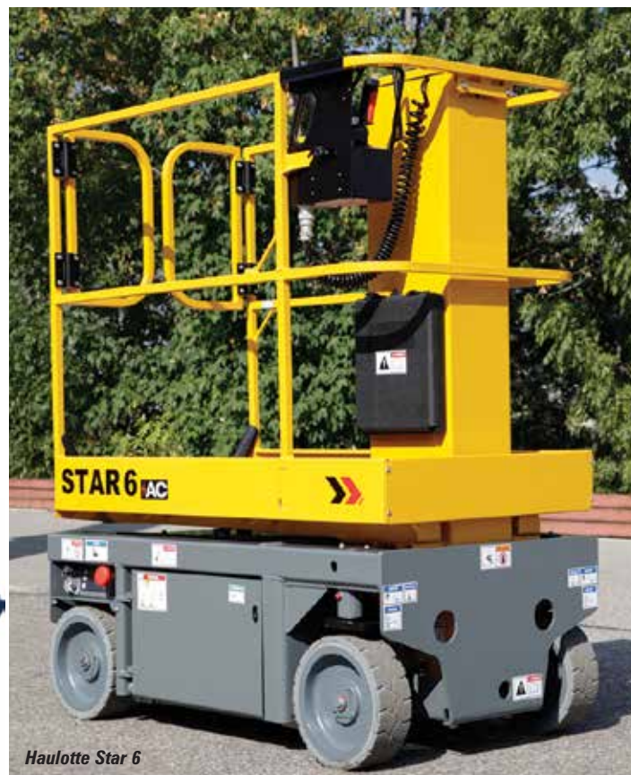
Haulotte Star 6

Haulotte will also introduce a new three model HTL heavy load telehandler range, the smallest of which is the 5.2 tonne/10 metre HTL5210, an all-new Haulotte designed and built model which can also handle 3.5 tonnes at 5.8