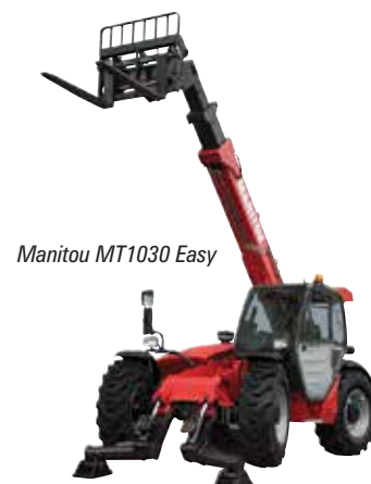
Manitou MT1030 Easy

Students, pensioners, unemployed - €16 for a day pass