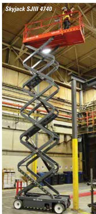
Skyjack SJIII 4740

articulating jib. Deliveries are expected to start in the third quarter. The new boom has been designed along the same principles as other Skyjack booms, with a focus on being simple to maintain, repair and operate.