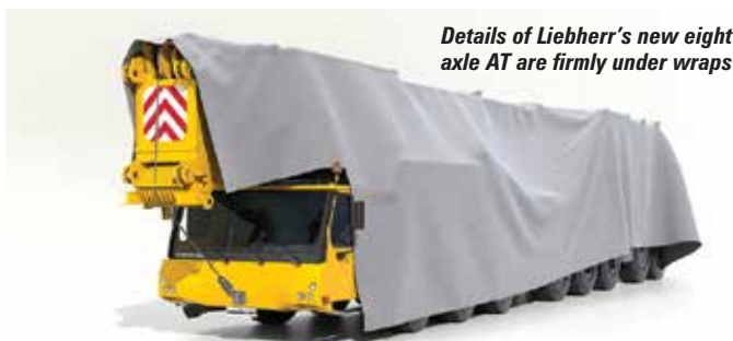
Details of Liebherr's new eight axle AT are firmly under wraps