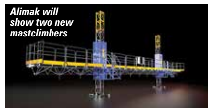
Alimak will show two new mastclimbers

Two new mastclimbers and an upgrade to its Scando 650 hoist will be the highlights on Alimak Hek's stand. The new Hek MC 650 and MC 450 platforms will be easy to operate and price competitive. Both are available in single or twin mast configuration with adjustable platform lengths and widths. The