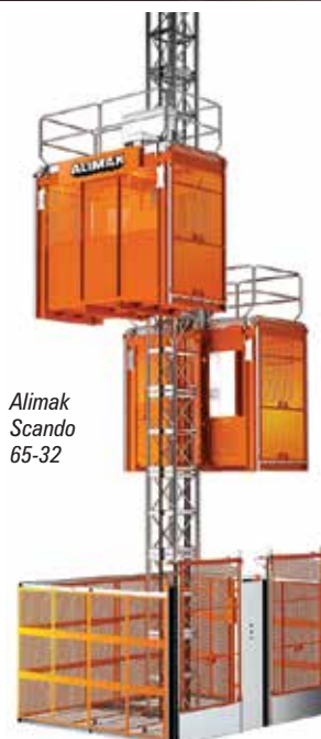
Alimak Scando 65-32

MC 450 has a capacity of 4,500kg with platform lengths from 10 to 30 metres, while details of the larger MC 650 will be announced later.