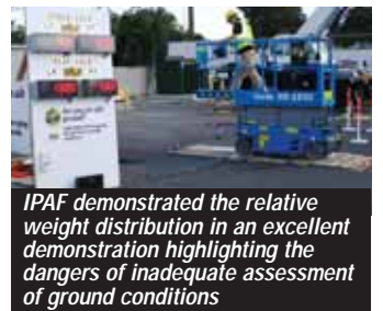
IPAF demonstrated the relative weight distribution in an excellent demonstration highlighting the dangers of inadequate assessment of ground conditions