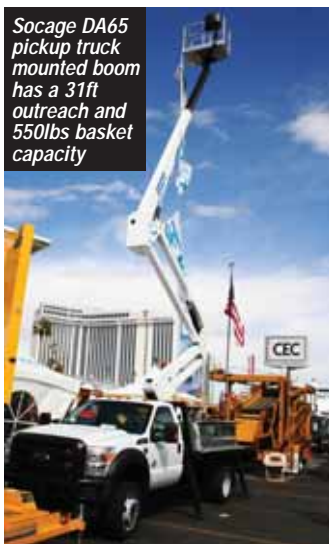
Socage DA65 pickup truck mounted boom has a 31ft outreach and 550lbs basket capacity