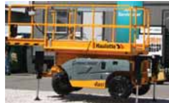
Haulotte Compact 2668RT - 4WD, 40% gradeability and 47 inch platform extension