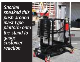
Snorkel sneaked this push around mast type platform onto the stand to gauge customer reaction