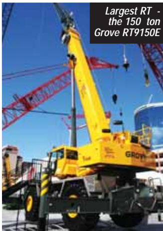
Largest RT - the 150 ton Grove RT9150E