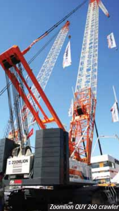
Zoomlion QUY 260 crawler