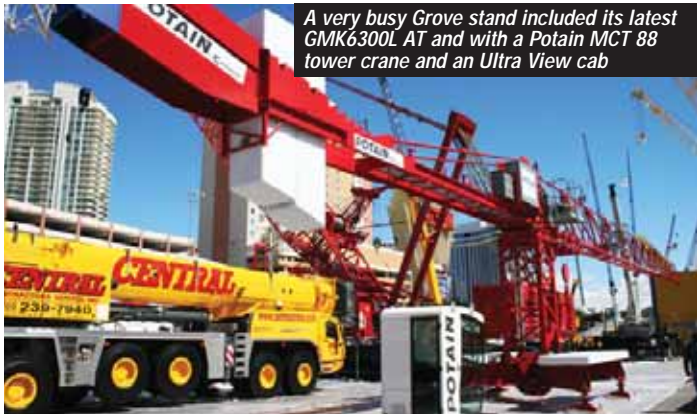
A very busy Grove stand included its latest GMK6300L AT and with a Potain MCT 88 tower crane and an Ultra View cab