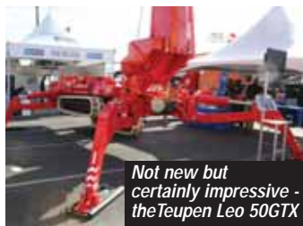
Not new but certainly impressive - the Teupen Leo 50GTX