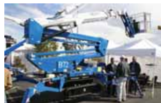
Reach Master/Skako Lift has taken on the distribution of Bluellift in North America and showed the 21m B72