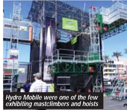
Hydro Mobile were one of the few exhibiting mastclimbers and hoists