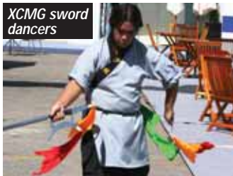
XCMG sword dancers