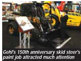
Gehl's 150th anniversary skid steer's paint job attracted much attention