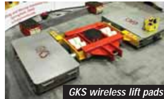
GKS wireless lift pads