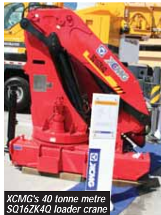
XCMG's 40 tonne metre SQ16ZK4Q loader crane