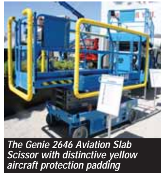
The Genie 2646 Aviation Slab Scissor with distinctive yellow aircraft protection padding