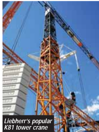
Liebherr's popular K81 tower crane