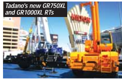
Tadano's new GR750XL and GR1000XL RTs