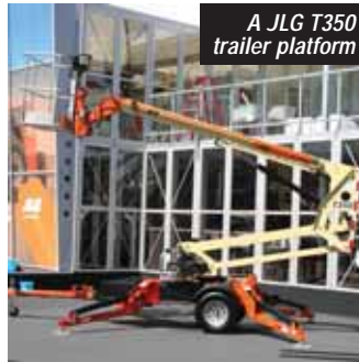
A JLG T350 trailer platform