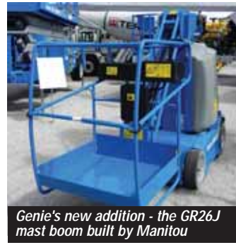
Genie's new addition - the GR26J mast boom built by Manitou