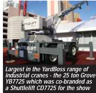
Largest in the YardBoss range of industrial cranes - the 25 ton Grove YB7725 which was co-branded as a Shuttlelift CD7725 for the show