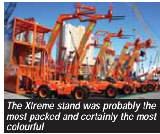
The Xtreme stand was probably the most packed and certainly the most colourful