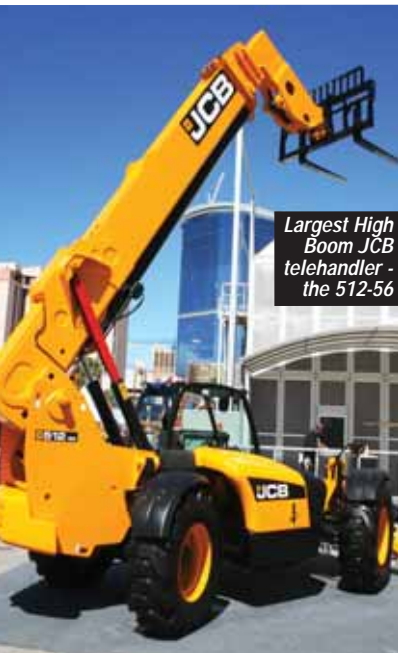
Largest High Boom JCB telehandler - the 512-56