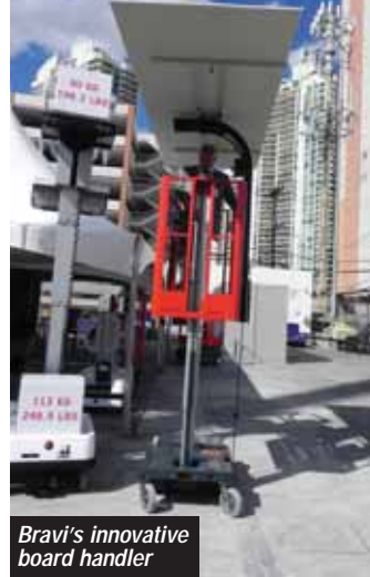
Bravi's innovative board handler