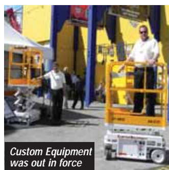
Custom Equipment was out in force