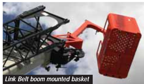
Link Belt boom mounted basket