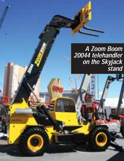
A Zoom Boom 20044 telehandler on the Skyjack stand