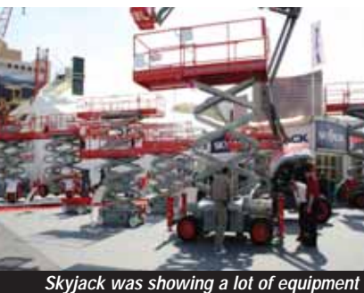
Skyjack was showing a lot of equipment