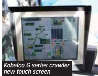
Kobelco G series crawler new touch screen