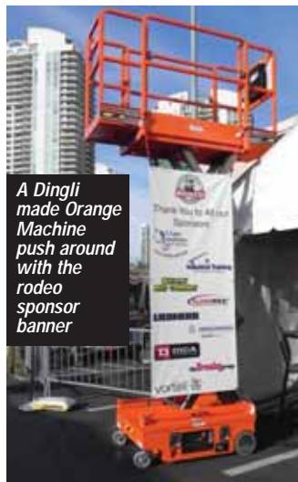
A Dingli made Orange Machine push around with the rodeo sponsor banner