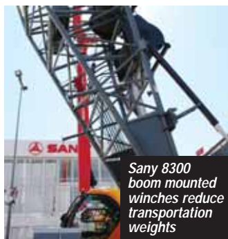
Sany 8300 boom mounted winches reduce transportation weights