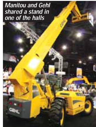
Manitou and Gehl shared a stand in one of the halls