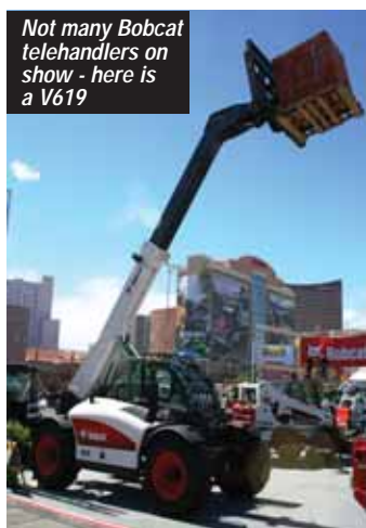
Not many Bobcat telehandlers on show - here is a V619