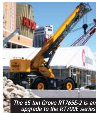
The 65 ton Grove RT765E-2 is an upgrade to the RT700E series