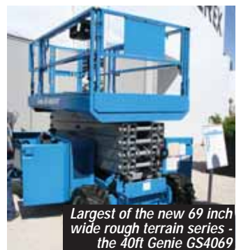
Largest of the new 69 inch wide rough terrain series - the 40ft Genie GS4069