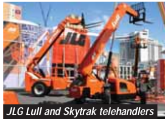
JLG Lull and Skytrak telehandlers