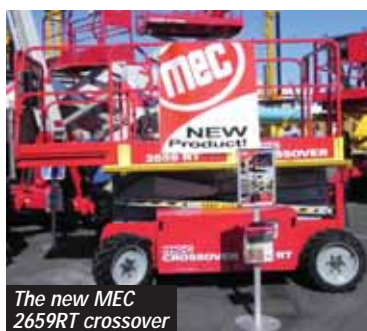
The new MEC 2659RT crossover