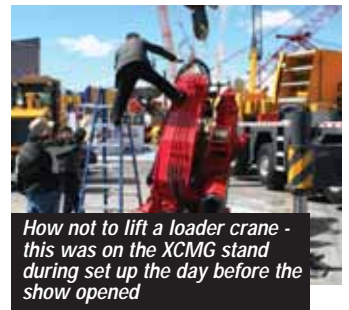
How not to lift a loader crane - this was on the XCMG stand during set up the day before the show opened