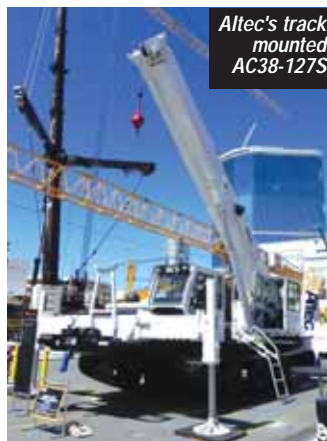
Altec's track mounted AC38-127S