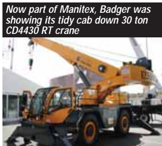
Now part of Manitex, Badger was showing its tidy cab down 30 ton CD4430 RT crane