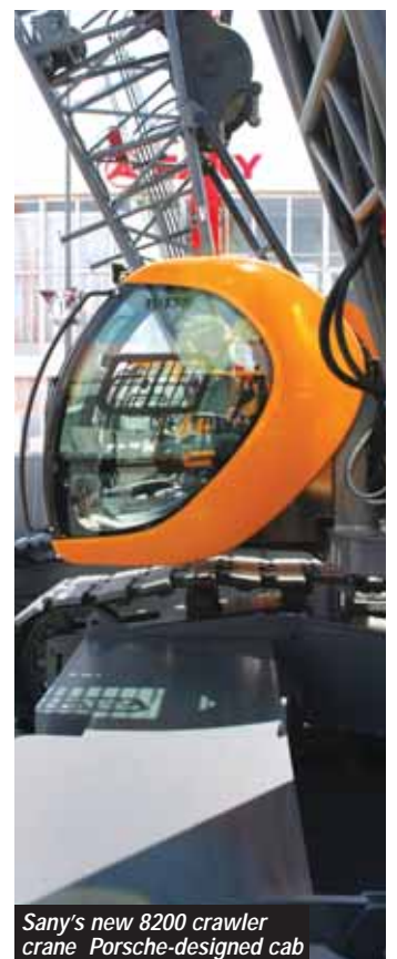
Sany's new 8200 crawler crane Porsche-designed cab