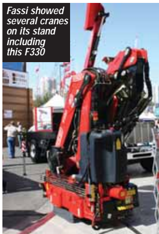
Fassi showed several cranes on its stand including this F330