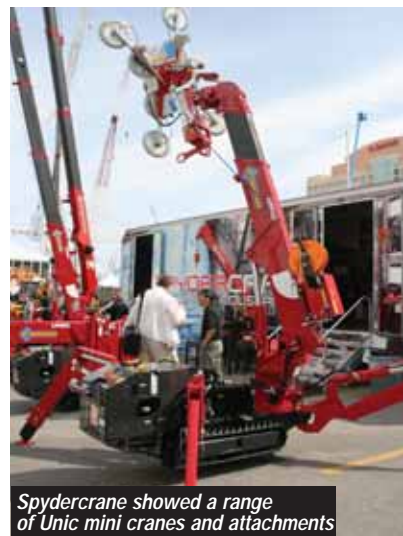
Spydercrane showed a range of Unic mini cranes and attachments