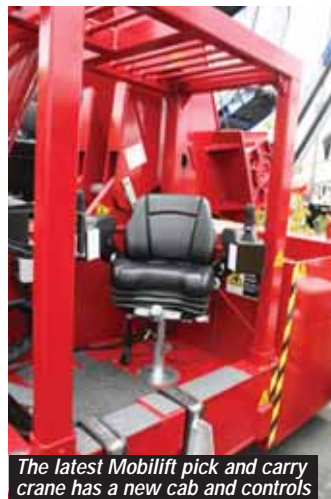
The latest Mobilift pick and carry crane has a new cab and controls