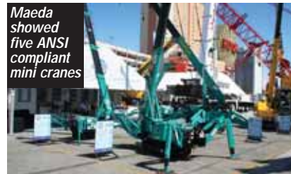
Maeda showed five ANSI compliant mini cranes