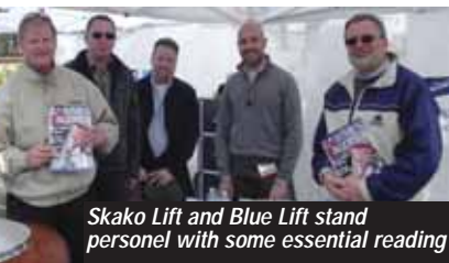
Skako Lift and Blue Lift stand personnel with some essential reading