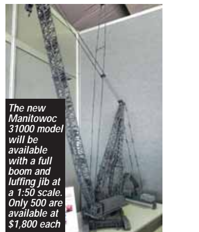
The new Manitowoc 31000 model will be available with a full boom and luffing jib at a 1:50 scale. Only 500 are available at $1,800 each