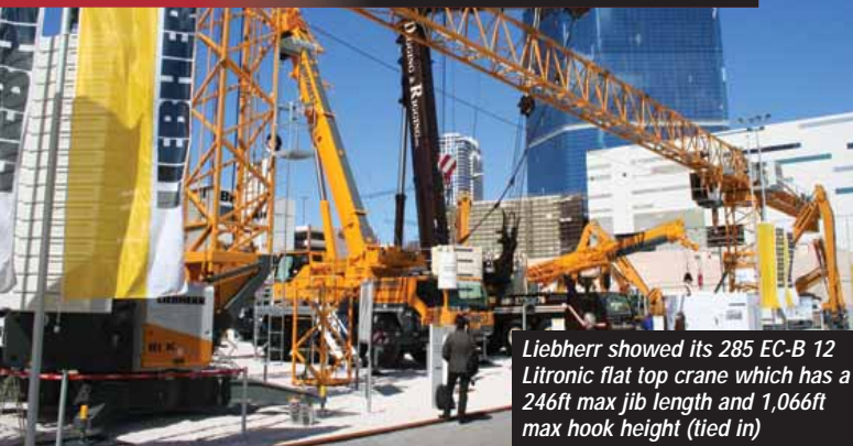
Liebherr showed its 285 EC-B 12 Litronic flat top crane which has a 246ft max jib length and 1,066ft max hook height (tied in)

It was also good to see many customers getting out their cheque books with a number of hefty deals from North American customers announced at the show including a $20 million, 40 crane order for Terex by Empire Crane; a 14 crane order from ALL Erection & Crane Rental and a six crane order from Southway Crane & Rigging of Byron, Georgia for a variety of Link Belt cranes and a total of 14 Sany crawler cranes to Four Seasons/5J Trucking, Clark Crane, Deep South, Rocky Mountain Crane Services and Chicago-based Imperial Crane.