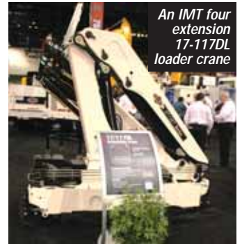
An IMT four extension 17-117DL loader crane