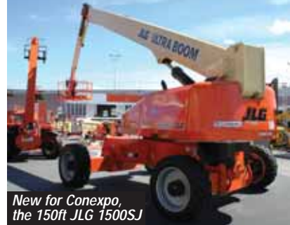
New for Conexpo, the 150ft JLG 1500SJ