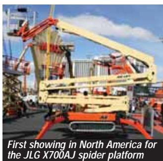
First showing in North America for the JLG X700AJ spider platform