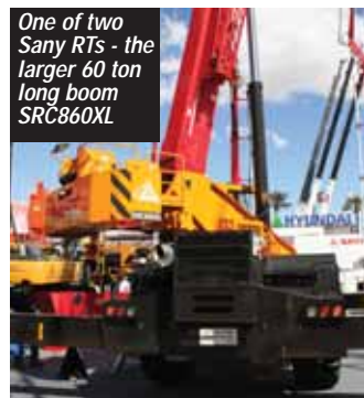
One of two Sany RTs - the larger 60 ton long boom SRC860XL