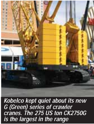
Kobelco kept quiet about its new G (Green) series of crawler cranes. The 275 US ton CK2750G is the largest in the range