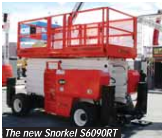
The new Snorkel S6090RT