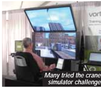
Many tried the crane simulator challenge