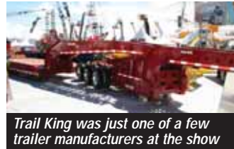
Trail King was just one of a few trailer manufacturers at the show