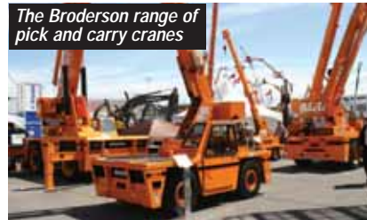
The Broderson range of pick and carry cranes