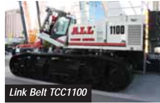
Link Belt TCC1100