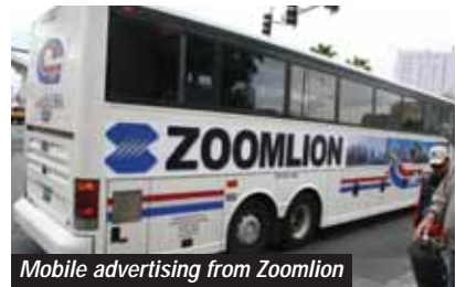
Mobile advertising from Zoomlion