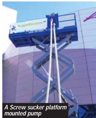
A Screw sucker platform mounted pump