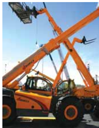
Part of Dieci telehandlers busy stand