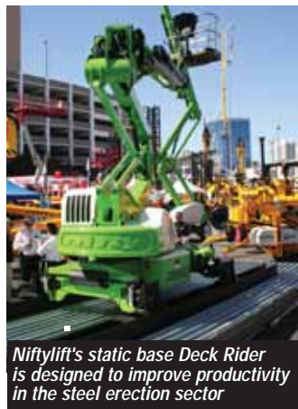
Niftylift's static base Deck Rider is designed to improve productivity in the steel erection sector