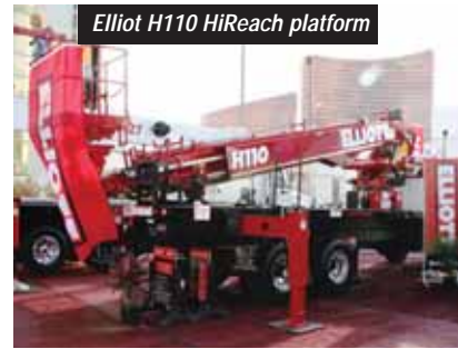
Elliot H110 HiReach platform