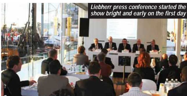
Liebherr press conference started the show bright and early on the first day