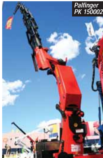
Palfinger PK 150002