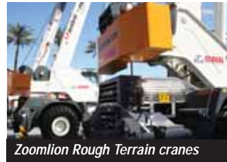
Zoomlion Rough Terrain cranes