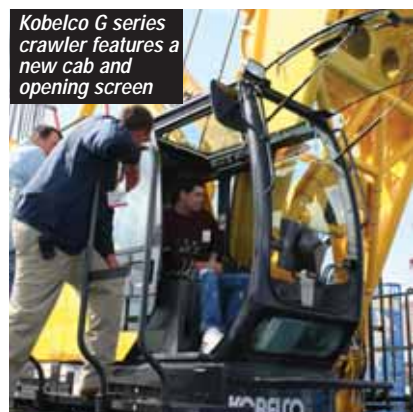
Kobelco G series crawler features a new cab and opening screen