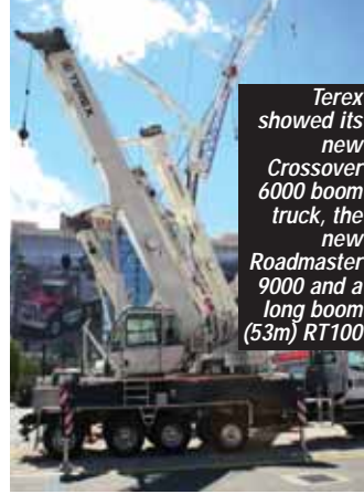
Terex showed its new Crossover 6000 boom truck, the new Roadmaster 9000 and a long boom (53m) RT100