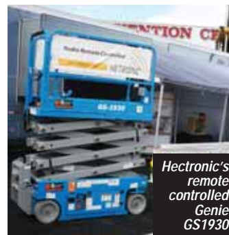
Hectronic's remote controlled Genie GS1930