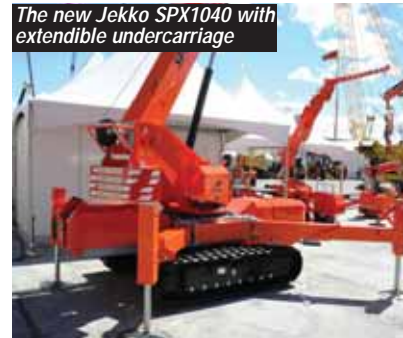
The new Jekko SPX1040 with extendible undercarriage