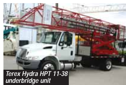
Terex Hydra HPT 11-38 underbridge unit