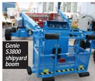
Genie S3800 shipyard boom