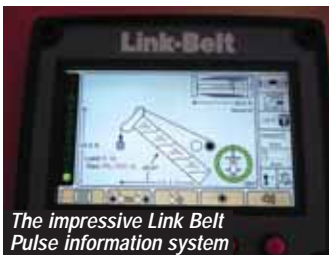
The impressive Link Belt Pulse information system