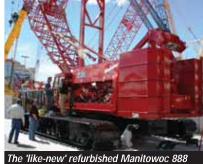
The 'like-new' refurbished Manitowoc 888