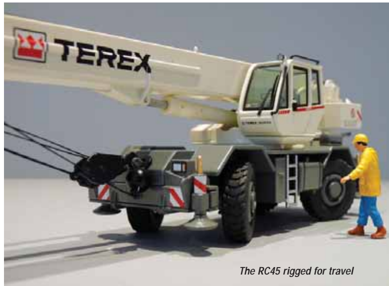
The RC45 rigged for travel