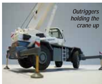
Outriggers holding the crane up