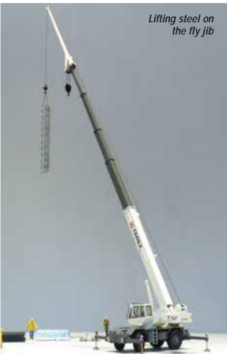
Lifting steel on the fly jib