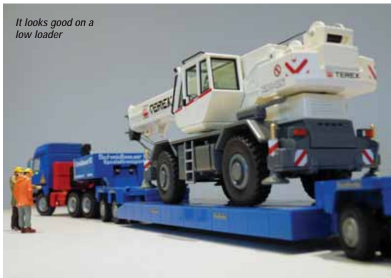
It looks good on a low loader