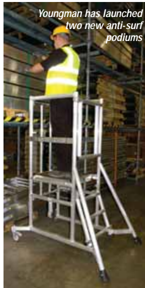
Youngman has launched two new anti-surf podiums

The P1000-AS and P1500-AS units, which offer working heights of 2.94 and 3.44 metres respectively.