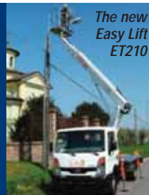
The new Easy Lift ET210

Italian-based Easy Lift will launch its truck mounted aerial lift range in the UK and Ireland at Vertikal Days in late June. The company will show its new 21 metre ET210 telescopic model with over 10 metres outreach. See Vertikal Days guide.