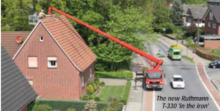
The new Ruthmann T-330 'in the iron'