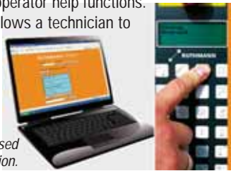
Ruthmann Connect can be accessed from any laptop or work station.

Ruthmann has also introduced a new telematics package called Connect. The remote diagnostics system utilises Rösler's Obserwando system that takes information into a central data centre, from where it can be accessed by any computer with a secure password. Connect includes all the normal theft-prevention and location features as well as monitoring operating hours, usage/access control, diagnostics and operator help functions. In the event of a problem, the system allows a technician to remotely check for the usual problems including emergency stops depressed, outriggers incorrectly set up, lack of fuel etc... often saving an expensive call out.