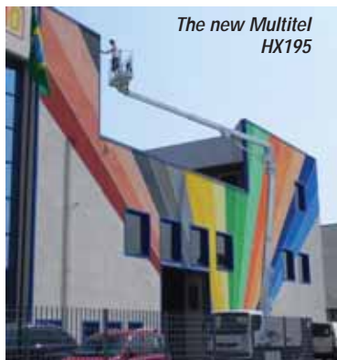
The new Multitel HX195

Melvyn Else managing director of Access Industries – Multitel's UK distributor said: "If you compare the HX195 envelope with that of other platforms in this size range you cannot fail to be impressed. The 1,400 x 700mm basket has up to 60 degrees of rotation in either direction, while the hydraulic controls are fully proportional and very smooth to operate." The company says that it the third new product to be shown will remain a secret until the show.