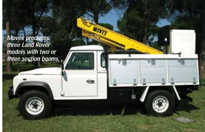
Movex produces three Land Rover models with two or three section booms