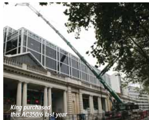
King purchased this AC350/6 last year

King Lifting purchased a new 350-tonne capacity AC350/6 and two other Terex AC40/2L ATs in the latter part of 2010.