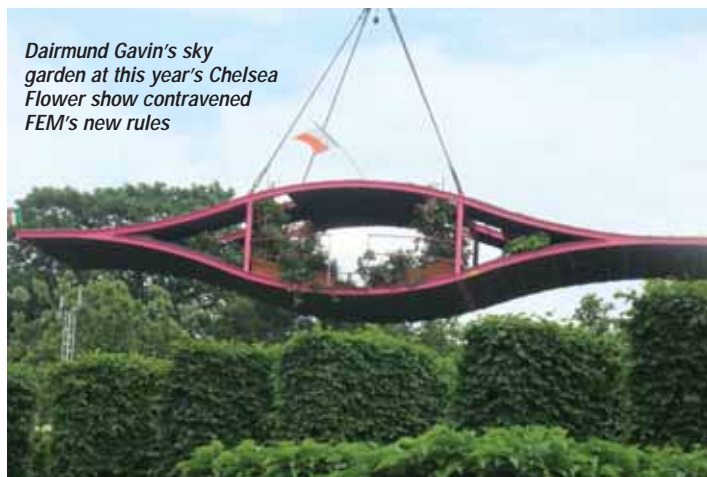
Dairmund Gavin's sky garden at this year's Chelsea Flower show contravened FEM's new rules

When these conditions are met and a hook suspended platform does have to be used it lays out some simple requirements and guidelines that should be followed. They include de-rating the cranes lift capacity by 50 percent, running the 'job' with an empty platform to gauge stability and available capacity and conducting an overload test for all parts of the platform and rigging chains/cables. The paper also 'bans' lifting people for fun, such as Bungee jumping or base jumping.