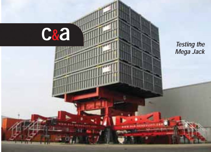
Testing the Mega Jack

Heavy lift and transport company ALE has launched a new Mega Jack system which the company says 'is capable of lifting 50,000 tonnes to a height of 25 metres'. Developed for the offshore industry to jack up larger and heavier oil and gas platform modules and other large structures, the system utilises jacking towers each with a capacity of 5,200 tonnes