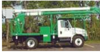
A rear mounted Aerial Lift bucket truck

Altec chief executive Lee Styslinger III, said: "This acquisition provides us with a unique opportunity to strengthen service to our tree care, landscape and line clearing customers. Aerial Lift has a well-established reputation for producing reliable, quality products for more than 50 years and will enhance Altec Nueco's support for customers in these industries."