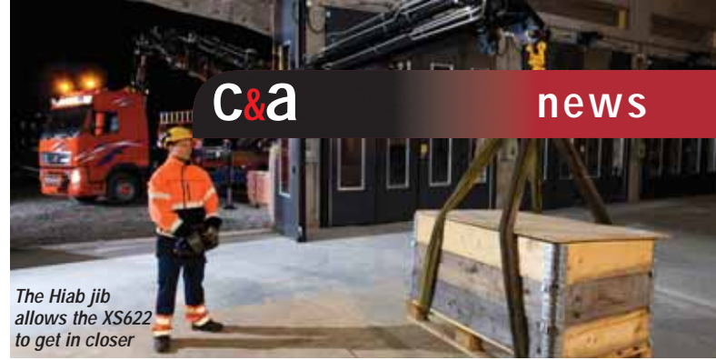
The Hiab jib allows the XS622 to get in closer