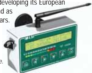
LSI's GS550 load indicator console.

LSI specialises in stainless steel wireless load indicators and associated safety components such as anti-two block cut-outs, anemometers and boom angle sensors. The company is in the process of developing its European product distribution and has worked with Crowland as a UK-based master distributor for the past two years. The LSI products are ideally suited to retrofitting to older cranes or to replace existing systems that have become expensive to maintain.