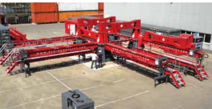
ALE's new Mega Jack system.

and four jacking bases containing a hydraulic jack with a stroke of 1,250mm. A temporary support is situated on top of each jacking base, which is also a hydraulic turntable. The result is a simple, but powerful five metre by five metre self-erecting tower, which can be built up until it reaches the desired height. The whole system is totally scalable with the number of towers adapted and increased according to the size, weight and balance of the structure. ALE says that it opens up new possibilities for an offshore sector under increasing pressure to build ever bigger rigs. It also plans to continue developing the Mega Jack system to handle heavier loads to heights of 50 metres.