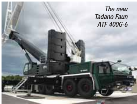
The new Tadano Faun ATF 400G-6

The company says that the new crane is not just an updated version of the 360 tonne AFT360G-6 that it showed at Bauma in 2007, but is an entirely re-engineered product that is easier to set up and road in Europe. It is still rated at 360 tonnes at three metres radius with the 400 tonnes at 2.7 metres.