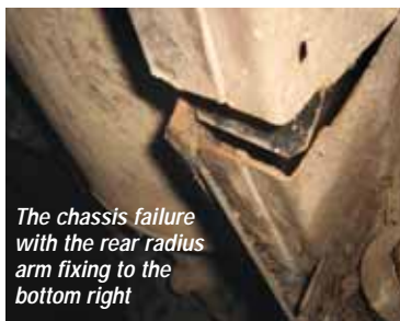
The chassis failure with the rear radius arm fixing to the bottom right

our report on a number of 2009 Gardner Denver chassis failures. The bulletin highlights a weakness around a hexagonal hole in the chassis behind the cab and calls for substantial chassis reinforcement plates to be installed. The recall is free of charge and is estimated to take seven and a half hours. If you have one of these platforms and have not heard from the supplier of the platform or a Land Rover dealer then we would recommend you contact your nearest Land Rover dealer and quote Programme number Q135.