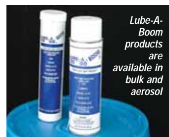
Lube-A-Boom products are available in bulk and aerosol

Lube-A-Boom - formed in 2002 - is based in Indianapolis, Indiana and markets a range of specially developed greases and lubricants for telescopic booms.