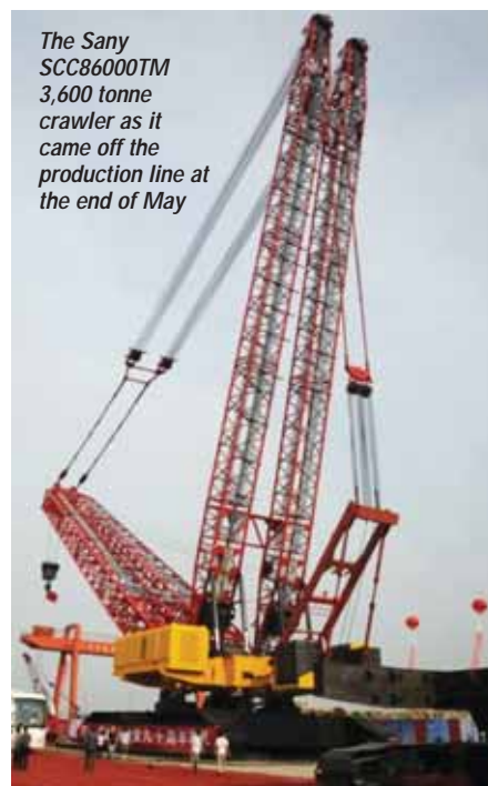
The Sany SCC86000TM 3,600 tonne crawler as it came off the production line at the end of May

Sany has not released any detailed information or responded to requests for a statement on the new crane. It looks very similar to the 3,200 tonne Terex CC8800 Twin from the front with twin booms and derrick mast. The track set up is more similar to the Manitowoc 31000 utilising four smaller tracks rather than the more traditional two. It also looks as though the bulk of the counterweight will be carried on a four tracked ballast carrier in a super lift type format.