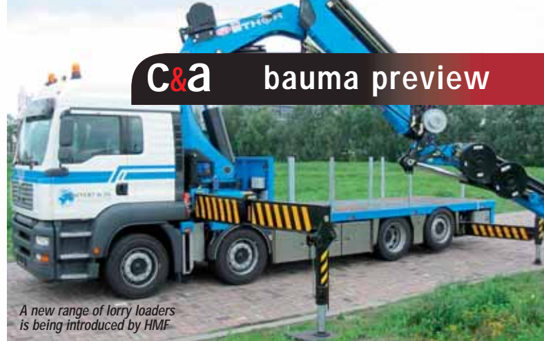
A new range of lorry loaders is being introduced by HMF

metres with a tip load of 1.5 tonnes and completes the S range of cranes - Jost's most successful product worldwide. Ease of erection and transportation feature in its design with the heaviest