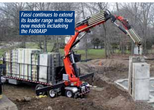
Fassi continues to extend its loader range with four new models including the F600AXP

Haulotte will unveil its own range of telehandlers which will include two models, the four tonne capacity and 17 metre lift height HTL 40-17 and the three tonne capacity, 14 metre HTL 30-14. The company says it is focussing on the construction sector and is aiming for 'robust and easy to drive machines'.