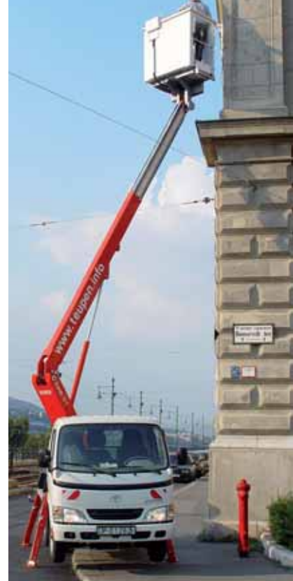
Teupen Euro B12 is a 12 metre high working platform mounted on a 2.8 tonne Toyota Dyna chassis.

Teupen's new crawler-mounted aerial access platform is Leo 18GT. With a working height of 17.9 metres and a 7 metre outreach it slots between the Leo 15 and Leo 23. The ground pressure in standard working position is 1.9kN per sq m and 5.52 kN per sq cm in transport mode allow the machine to travel over most surfaces. Working "footprint" is 2,93m x 3,92 m and with an overall length of 4710mm (3995mm without the basket) width of 780mm and travel height of 1980mm the unit is capable of getting into most situations.