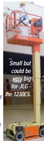
Small but could be very big for JLG - the 1230ES.

Swing-out trays provide easy access to frame and power-pack components and four 6Volt 220A/hr