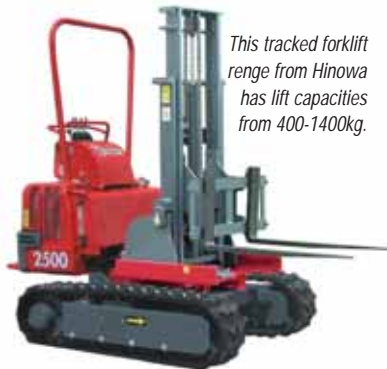
This tracked forklift range from Hinowa has lift capacities from 400-1400kg.

Hinowa is launching an unusual machine - the tracked forklift. Aimed at the construction, road and landscaping markets, the unit is ideal for sites that are muddy, sandy or have steep gradients. Basically it is a tracked dumper chassis with a rigid masted forklift on the front. Lift capacity varies from 400-1400kg.