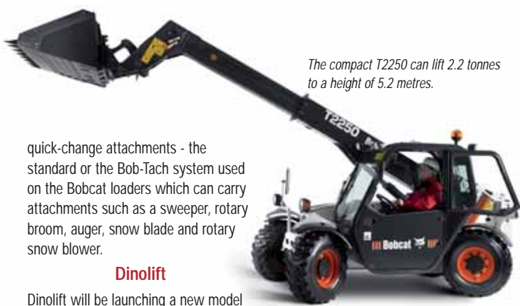
The compact T2250 can lift 2.2 tonnes to a height of 5.2 metres.

quick-change attachments - the standard or the Bob-Tach system used on the Bobcat loaders which can carry attachments such as a sweeper, rotary broom, auger, snow blade and rotary snow blower.