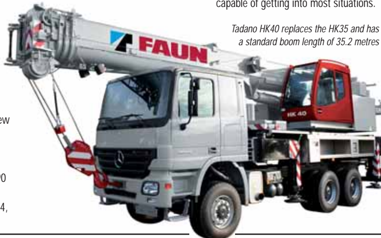
Tadano HK40 replaces the HK35 and has a standard boom length of 35.2 metres

Other new models include the 55 tonne rough terrain GR 550EX and the truck mounted HK40.