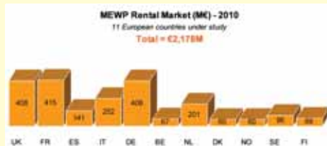
The MEWP rental market across the 11 European countries under study.

included in the European report. New for this year is the analysis of fleet mix, comparing the proportion of scissors and booms. Special rates are available for IPAF members at www.ipaf.org/reports