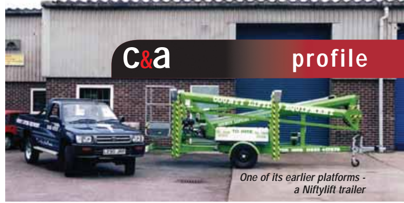
One of its earlier platforms - a Niftylift trailer

tonne Kato but it was too wide and too tall for our needs."