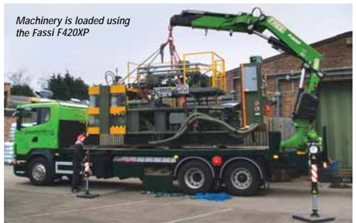
Machinery is loaded using the Fassi F420XP