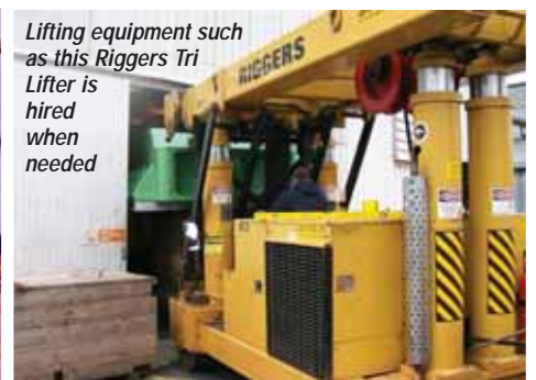
Lifting equipment such as this Riggers Tri Lifter is hired when needed