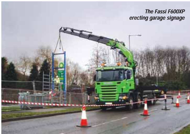
The Fassi F600XP erecting garage signage

changed with many large local industrial manufacturers - such as British Timken which relocated to Eastern Europe - closing down, downsizing or moving. We therefore had to look for new customers and with construction booming at the time we picked up a lot of work such as the positioning of roof trusses, which was good for