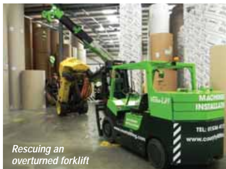
Rescuing an overturned forklift

The mainstay of our industrial moving side of the business are the Versa-Lift machines. "We should have purchased them 10 years ago and kept a smaller crane fleet. We had an Iron Fairy but the Versa-Lifts outperform traditional pick and carry cranes and can effectively unload a truck load of equipment and then carry and place it in its final destination. We also have one that has the expensive remote control option - controlling the driving,