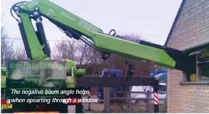
The negative boom angle helps when operating through a window