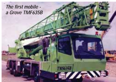
The first mobile - a Grove TMF635B