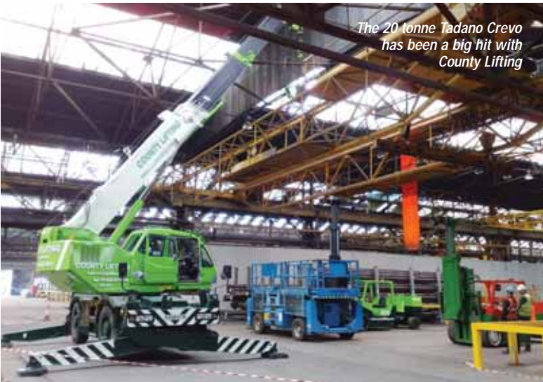
The 20 tonne Tadano Crevo has been a big hit with County Lifting

County Lifting operates the crane hire and machinery moving business under the one banner, even though they are two separate but indivisible companies. It also has a fabrication department which can manufacture most items including overhead lifting systems and purpose-built scissor grabs giving customers the full package. Geographically it used to limit itself to a 50 mile radius around Kettering but now has an international transport license and has customers with facilities throughout Europe