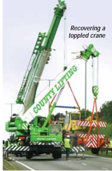
Recovering a toppled crane

"We are going to have to look at spider cranes and we will also look at some more tracked stair climbers. We currently have two stair robots which can carry one tonne up stairs. I would like to add a new 110 tonne/metre plus lorry