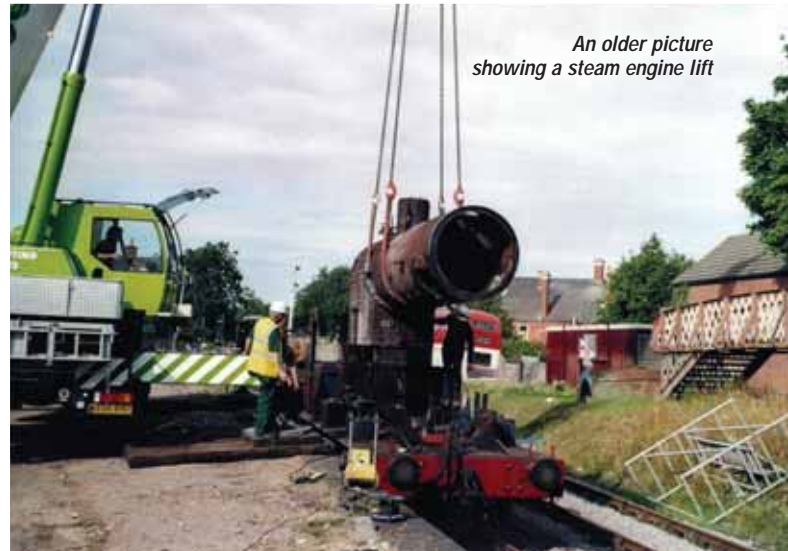
An older picture showing a steam engine lift

While Drury believes that there are better alternatives to the 25/30 tonne truck cranes in the UK he is interested in seeing the reaction to the new 35 tonne Zoomlion truck crane that was launched at Vertikal Days. "Today's ATs have moved on so much, but it will be interesting to see what other crane rental companies make of the Zoomlion. Modern sites really need a more