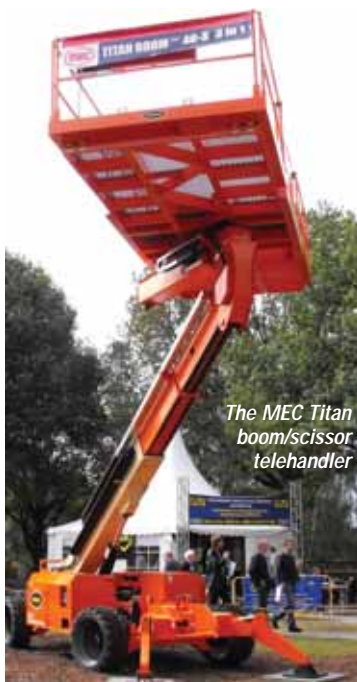
The MEC Titan boom/scissor telehandler

If you have not already seen the MEC Titan then this is another stand not to miss. The company may also show its Crossover scissor lift.