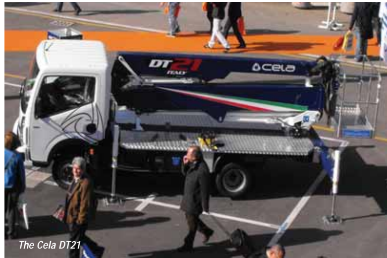
The Cela DT21