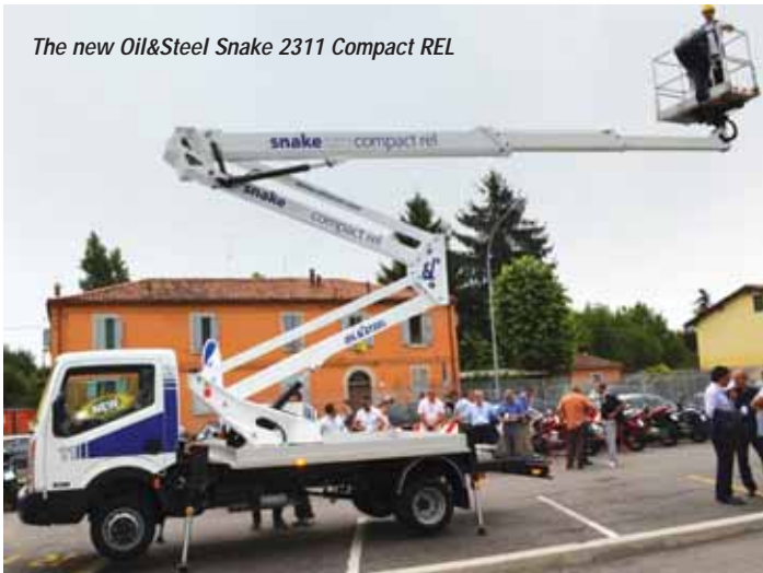
The new Oil&Steel Snake 2311 Compact REL

range of its self-propelled lifts. Products on show will include its 120T compact 12 metre trailer lift, HR17N, HR17 Hybrid 4x4 and HR21 Hybrid AWD.