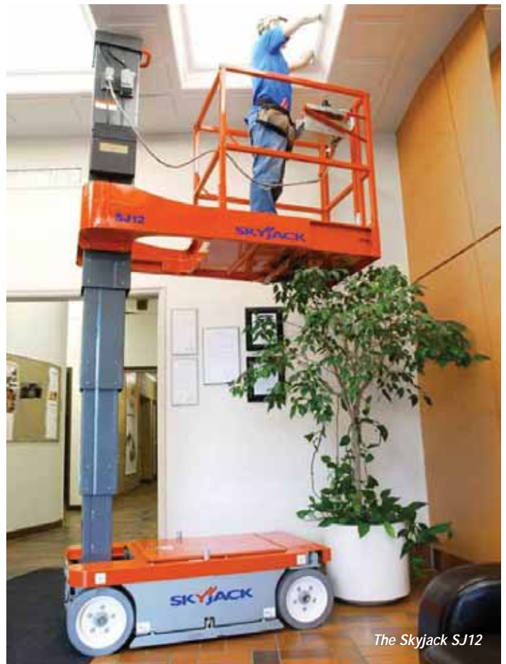
The Skyjack SJ12

Teupen will unveil two new spider lifts, a new truck mount and a new 13 metre trailer lift. The spiders are the Leo15GT Plus and the Leo18GT Plus both of which build on the existing Leo GT products, but incorporate new stabilisers and an articulating jib. The new Leo18