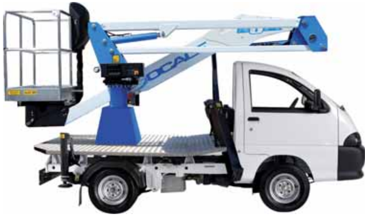
The Socage A314NAT.

this year. The unit offers up to 21 metres of outreach and 320kg of platform capacity, complete with a jib with 185 degrees of articulation and a full 180 degrees of platform rotation.