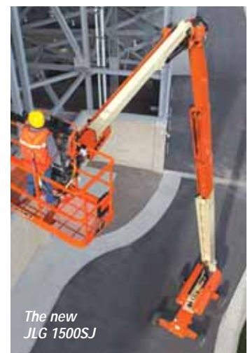
The new JLG 1500SJ

For many visitors Apex will be the first opportunity to see JLG's new 150ft platform height 1500SJ in the iron. The world's largest self-propelled boom offers a working height of more than 47 metres and can be transported without special permits. Based on the 1350SJ it features a telescopic articulating jib which provides up 7.62 metres outreach at full boom elevation. It is also a chance to see the recently launched 34ft articulated Rough Terrain boom the 340AJ and the new smaller Toucan 8E mast boom.