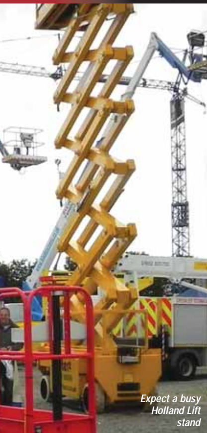
Expect a busy Holland Lift stand