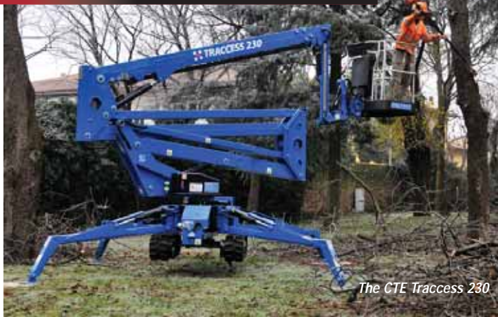
The CTE Traccess 230