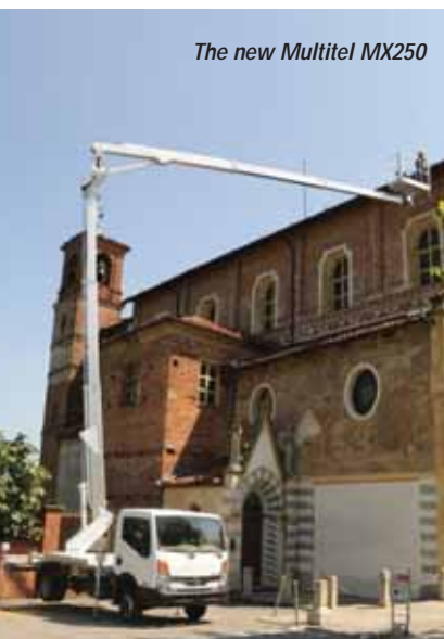
The new Multitel MX250