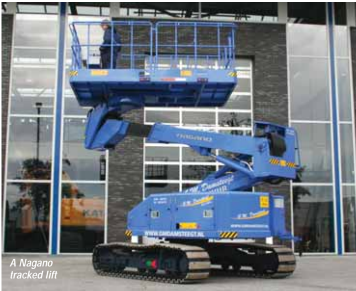
A Nagano tracked lift