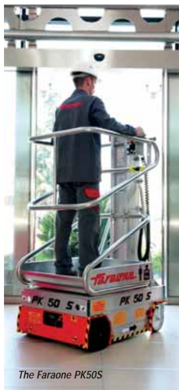
The Faraone PK50S

continuous slew, 180 degrees of platform rotation and 150 degrees of jib articulation as standard. A product not to miss!