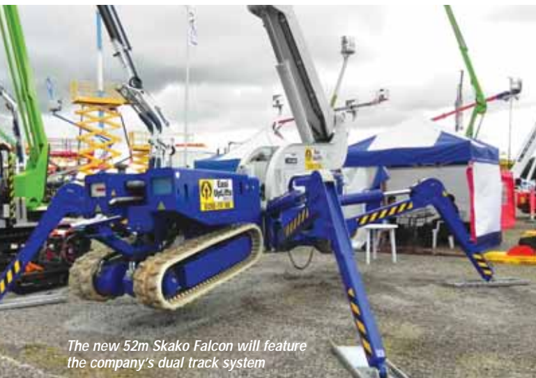
The new 52m Skako Falcon will feature the company's dual track system