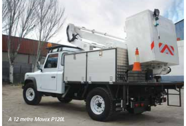
A 12 metre Movex P120L