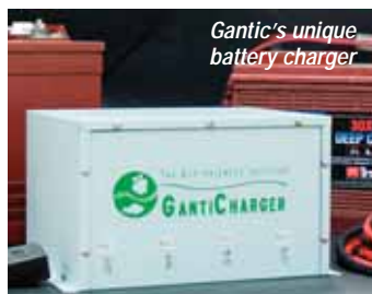
Gantic's unique battery charger

Norwegian-based Gantic has taken a completely new look at battery charging for aerial lifts. Its chargers offer lower energy consumption, extend battery life as well as charging to their maximum capability, all thanks to its unique approach of treating each battery in a pack as an individual.