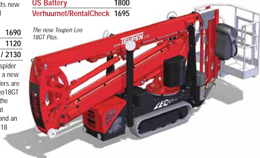
The new Teupen Leo 18GT Plus.

Dates & Opening Hours: Wednesday Sept. 14 09.30 - 18.00 h. Thursday Sept. 15 09.30 - 18.00 h. Friday Sept. 16 09.30 - 17.00 h.