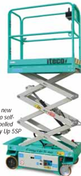
The new Iteco self-propelled Easy Up 5SP

Imer/Iteco has much to talk about including a self-propelled version of its Easy Up 5 push around scissor lift, dubbed the Easy Up 5SP which offers a five metre work height and weighs just 490kg. Also check out its first vehicle mounted lift, a straight telescopic mounted on a 3.5 tonne Nissan Cabstar chassis.