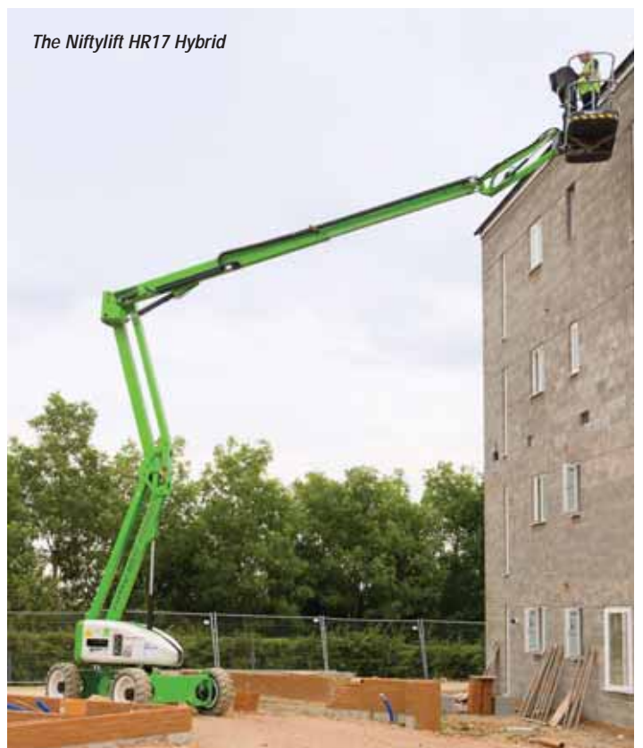
The Niftylift HR17 Hybrid

Niftylift will be focusing on its market leading innovations including its hybrid power system, SIOPs safety system and Tough cage that it is fitting to an increasingly wide