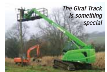
The Giraf Track is something special

Giraf Track is one of those products that you should not miss. The company is carving out a strong niche for itself among users such as utilities, where its combination of high capacity, extra-large platform, tracked telehandler and crane in a package that can cross challenging terrain and level itself proves a winning combination.