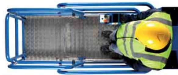
The Power Tower Nano is now available in three versions.