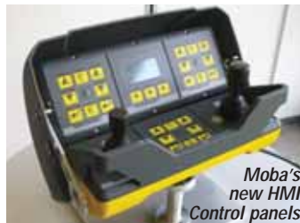
Moba's new HMI Control panels