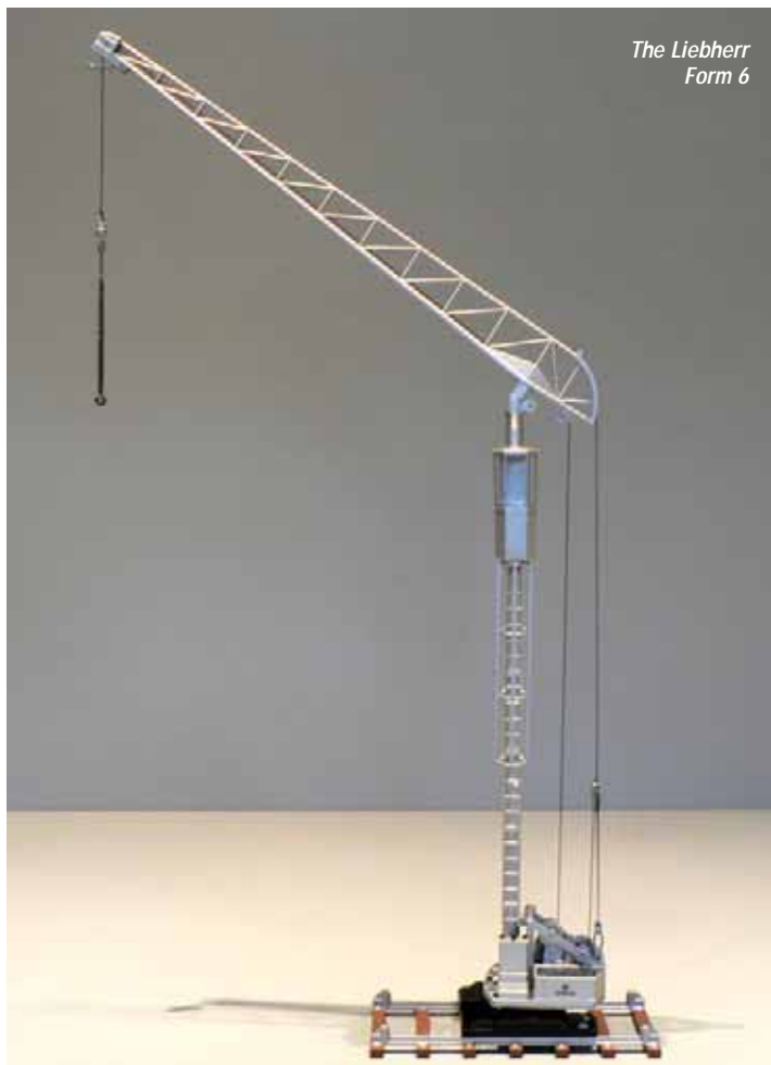
The Liebherr Form 6

mode with the travelling axle fixed. As an alternative pose the erection of the crane can be simulated, but only to a degree as the model is not particularly stable except when the mast is close to vertical.