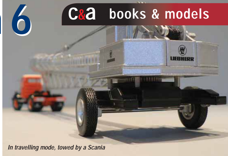
In travelling mode, towed by a Scania

The jib is a pleasing piece which replicates the lattice work of the original effectively. It is actually made of two castings with the underside being a discrete section attached to the top two sides. There are some nice metal sheaves at the mast end of the jib, and at the jib tip there is a moving hoist cut-out bar. The hook is modelled well and comes with a set of lifting chains. The two winches can be operated by the supplied keys and they work smoothly, although the hoist winch really needs a load on the hook to lower properly and for this purpose a small metal barrow is included which provides a load for the crane. The crane can be posed in transport