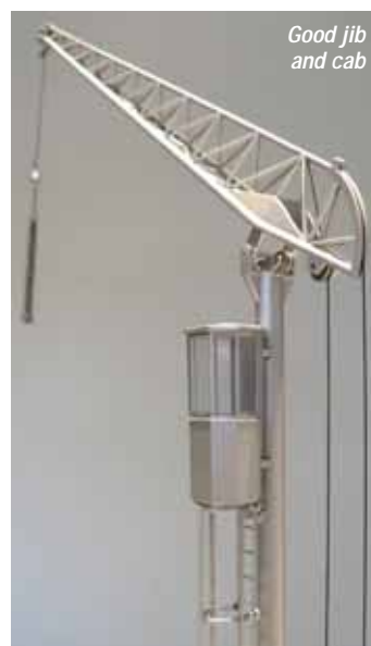
Good jib and cab