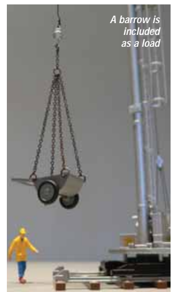
A barrow is included as a load