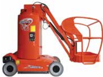
Originally known as the AMWP11.5-8100 the Dingli Whirlwind 11.5 has been joined by the smaller 10 metre Whirlwind 10.

UpRight (now Snorkel) introduced this idea to the mast boom when it launched a narrow, 800mm wide, eight metre mast boom in the 1990s. The advantages of a narrower platform largely failed to appeal, with most buyers preferring to stay with the standard 10 metre Dingli appears to be finding some success having sold a number of its 11.5 metre machines to customers in Australia. Finland. France the