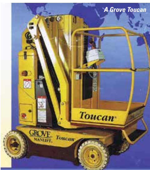
A Grove Toucan