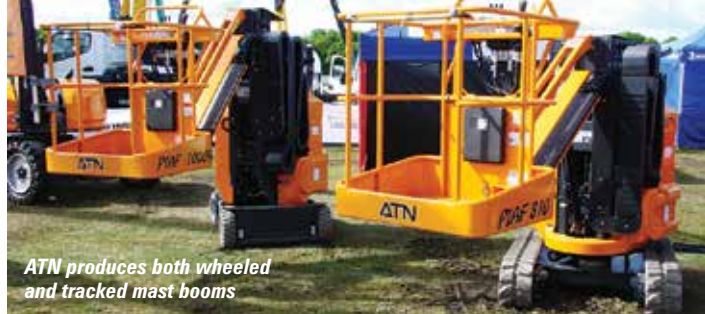
ATN produces both wheeled and tracked mast booms