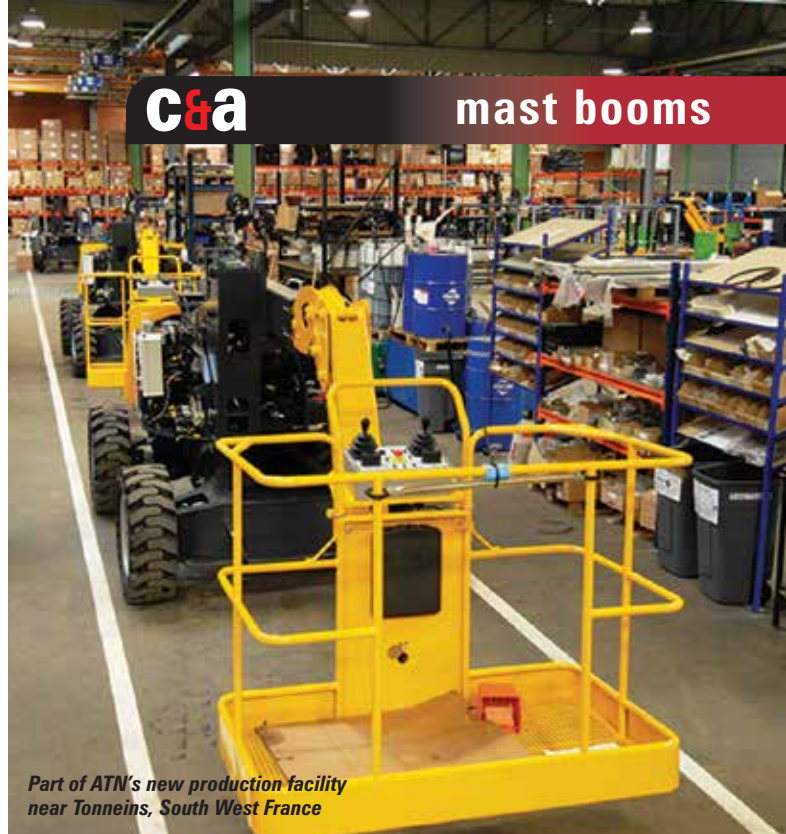
Part of ATN's new production facility near Tonneins, South West France

Following on from the mast booms, ATN produced its first articulated,