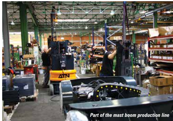
Part of the mast boom production line

"Machines are assembled at the facility with components and prefabricated parts arriving from all over the world, including Sri Lanka, Slovakia, France, Spain, Romania,