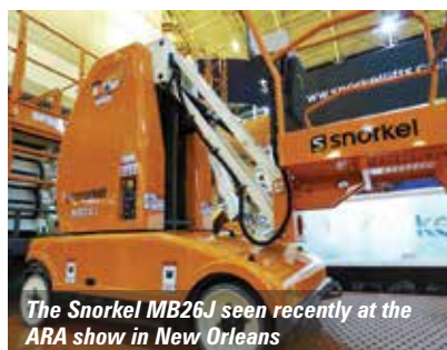
The Snorkel MB26J seen recently at the ARA show in New Orleans