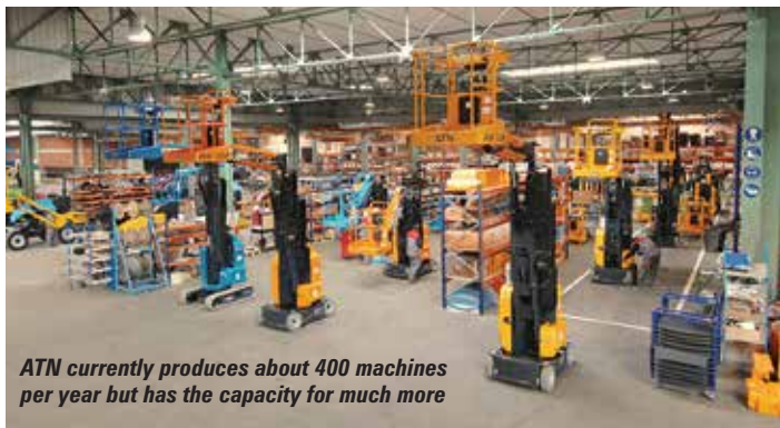
ATN currently produces about 400 machines per year but has the capacity for much more

in Japan. Mast booms now account for just half of ATN's current production, and only 30 percent of its revenues. The production of diesel scissors is growing, but has encountered several problems. "For rental companies the RT scissor is expensive to buy and rental returns are low," says Duclos. "It also suffers abuse as it is a heavy duty product but as it is in demand we have to offer a product but it is not very profitable."