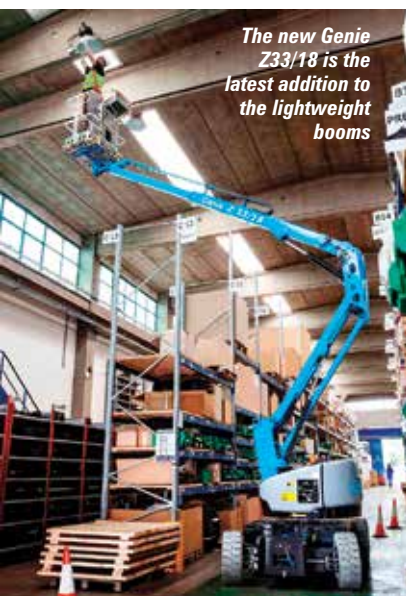
The new Genie Z33/18 is the latest addition to the lightweight booms

The mast boom might initially appear to be at a disadvantage with outreach limited to three or four metres. However they have the advantage of being lighter and