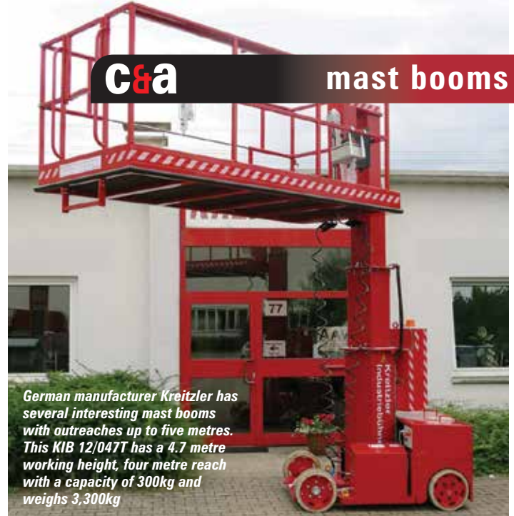
German manufacturer Kreitzler has several interesting mast booms with outreaches up to five metres. This KIB 12/047T has a 4.7 metre working height, four metre reach with a capacity of 300kg and weighs 3,300kg

The bulk of mast boom sales comprise the 10 metre working height models, with an overall width of just under a