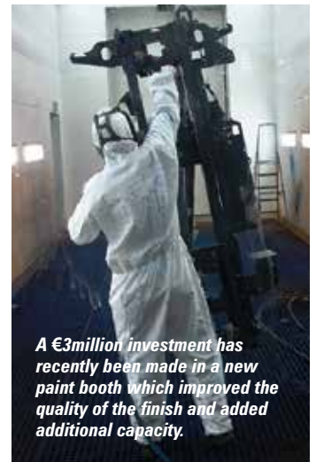
A €3million investment has recently been made in a new paint booth which improved the quality of the finish and added additional capacity.

For ATN the initial product was the crawler and then wheeled mast boom. Crawler units are becoming increasingly popular so it will launch an eight metre electric and a 10 metre crawler unit at Intermat for applications such as greenhouses in France and The Netherlands, where soft ground is an issue. Tracked lifts are also very popular