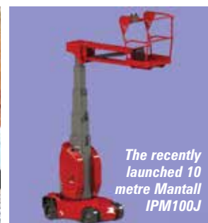
The recently launched 10 metre Mantall IPM100J

UK, Netherlands, Russia and New Zealand.