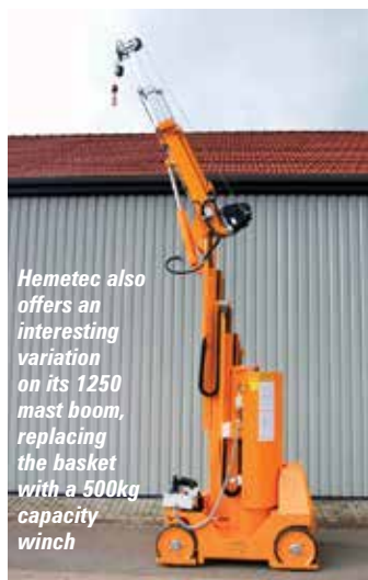
Hemetec also offers an interesting variation on its 1250 mast boom, replacing the basket with a 500kg capacity winch

Several Chinese aerial lift manufacturers are now looking at the mast boom market, and the leading manufacturer Dingli now has two models. Its first 11.2 metre platform - originally known as the AMWP11.5-8100 but now known as the Whirlwind 11.5 has been joined by the smaller 10 metre Whirlwind 10 which is pretty much the same, but uses one mast section less. Dingli is also different in that it includes an automatic pothole protection device as standard,