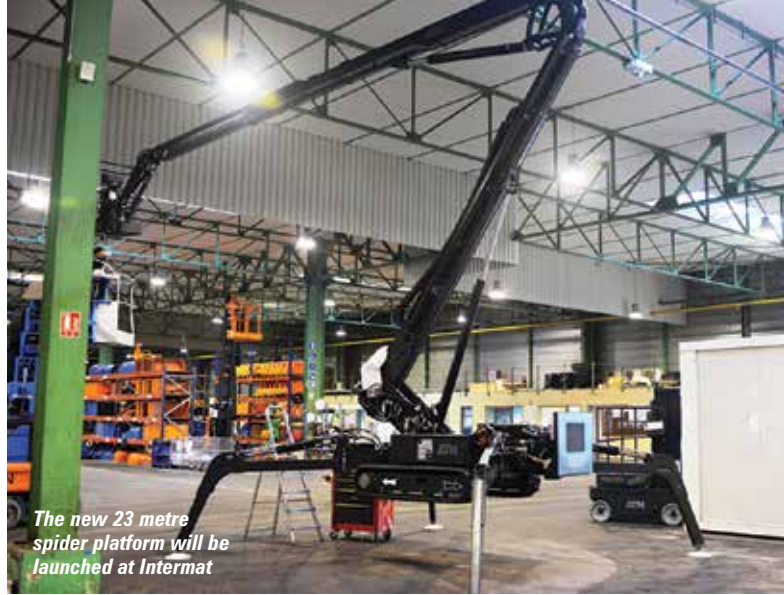
The new 23 metre spider platform will be launched at Intermat

The facility is situated on a 40,000 square metre plot so there is plenty of room to expand if necessary. A €3million investment has recently been made in a new paint booth which improved the quality of the finish and added additional capacity. A new office building also being constructed bringing together the production, sales and engineering departments. The new factory is within a few