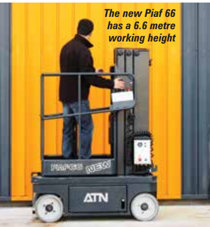
The new Piaf 66 has a 6.6 metre working height

completely offering no protection. Replacements are expensive - say €1,500 - and over the life of a machine may need replacing up to three times, good money for the manufacturer, but a significant cost to the rental company. There can also be problems with machines and we as the manufacturer have a responsibility to fix them even after the warranty period has expired."