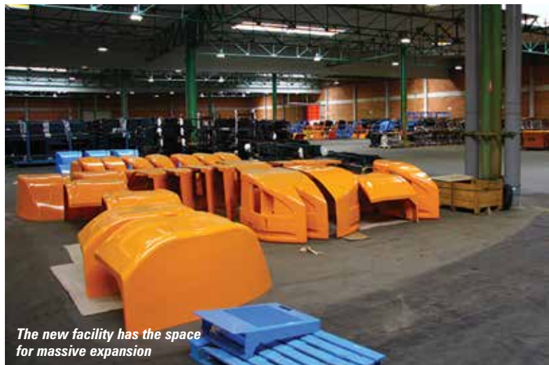
The new facility has the space for massive expansion

hundred metres of Duclos' old facility - now owned by JLG - where the Toucan products are still built.