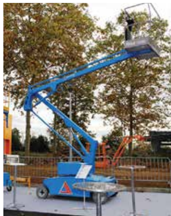
Early Delta Systemes machines.

"After 27 years in this market I can see that the major manufacturers have been successful by doing a good job for the customer. However I think that they have lost sight of this philosophy, because they are now more finance or corporate orientated. They have an eye on the short term gain or stock market price, and not on the long-term relationship with customers. Take machine covers for example. They used to be made from fibreglass however the damage after an accident/impact was expensive to repair. Then they were made of much cheaper plastic however when it is damaged it breaks