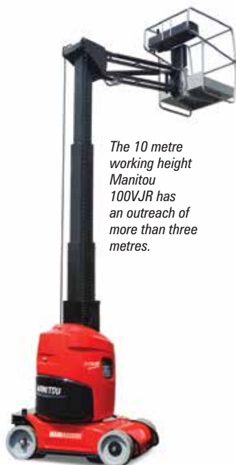
The 10 metre working height Manitou 100VJR has an outreach of more than three metres.