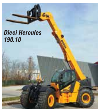
Dieci Hercules 190.10

Italian telehandler company Dieci will show the 29.9 metre/four tonne 360 degree Pegasus 40.30, capable of 40kph. The new machine is fitted with the Easy work system which allows it to work in any position, automatically adapting the performance according to the outrigger configuration. Also launched is the new heavy duty 19 tonne/10.2 metre Hercules 19.10. Features include a lockable third differential, a boom raising, speed