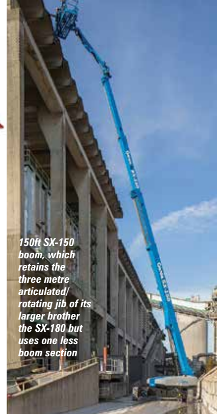
150ft SX-150 boom, which retains the three metre articulated/rotating jib of its larger brother the SX-180 but uses one less boom section

As well as the award-winning 200kg capacity LiUP self-contained tower crane elevator, Liebherr will display the 172 EC-B 8 Litronic Flat-Top crane introduced to the market last autumn. Succeeding the 160 EC-B, it has been completely revised with a 15 percent increase in jib tip capacity to 2,100kg at a radius of 60 metres. Maximum capacity is