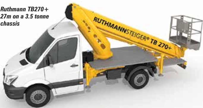
Ruthmann TB270+ 27m on a 3.5 tonne chassis

capacity or up to 16.4 metres outreach with its reduced 100kg capacity - almost two metres more than the current unit. The machine on the stand has been sold to French rental group Killoutou.