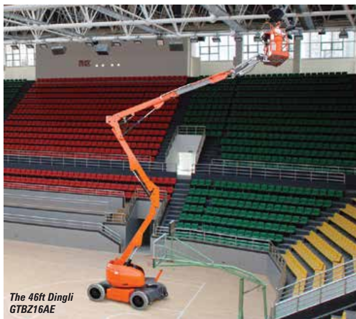
The 46ft Dingli 6TBZ16AE