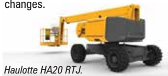
Haulotte HA20 RTJ.

Long-time Intermat supporter Haulotte is also celebrating a 30th anniversary, and is promising a major innovative product launch. We do know that it will unveil new versions of the Star 8 and Star 10 mast booms, along with a 60ft articulated boom - the HA20 RTJ Pro - based on the recently launched HA16 RTJ Pro, with four wheel drive, four wheel steer, 360 degree slew, oscillating axle and Activ'Shield secondary guarding system. The company will also unveil improvements to its larger booms in the form of the RTJ Pro models of the HA32, HA41 and HT43 with better equipment levels, including a new platform, improved covers and Activ'Shield secondary guarding. On the telehandler front, updated machines will include new Tier IV final Kohler engines which do not need a diesel particulate filter along with numerous detailed changes.