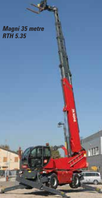
Magni 35 metre RTH 5.35

increasing regenerative system and an inching pedal allowing it to run at slow speed with engine at full throttle.