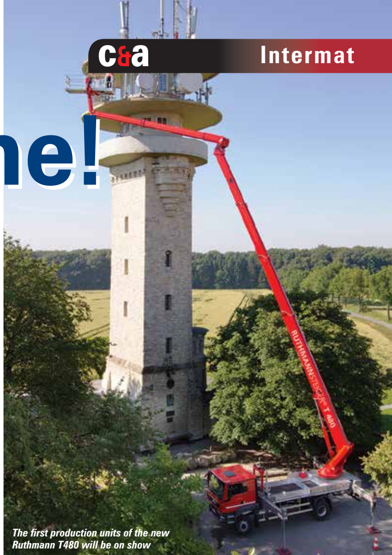
The first production units of the new Ruthmann T480 will be on show

German truck mounted platform manufacturer Ruthmann will unveil the TB270+ - a new version of its 27 metre TB270 on a 3.5 tonne chassis. The redesign was forced by the increased weight of the new Euro 6 truck chassis, which are now beginning to ship. This necessitated a lighter top of course if the 3.5 tonne GVW was to be respected. Ruthmann says it has employed innovative steel fabrication techniques and its 'multi-bevelled' boom and superstructure designs from the 22 metre TBR 220 to cut weight, while improving performance - including the ability to go to the machine's full height with its maximum 230kg platform