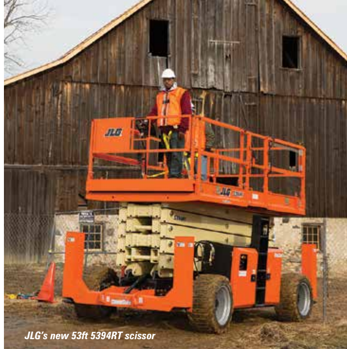
JLG's new 53ft 5394RT scissor

has a working height of 23 metres and platform capacity of 230kg, with an overall length of 5.54 metres and width of 1.88 metres and will be available with its own trailer.