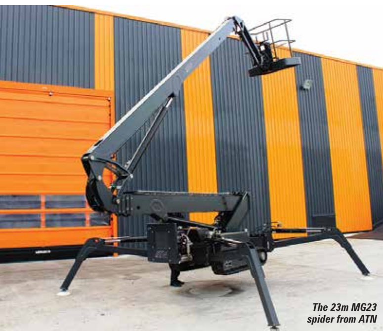
The 23m MG23 spider from ATN

French aerial work platform manufacturer ATN will launch two new machines - the Piaf 1010 tracked mast boom and a 23 metre spider lift - the MG23. The spider