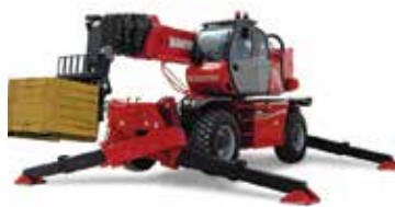
Manitou will show its new 32 metre 360 degree telehandler, the MRT 3255.

Manitou's main new product launch will be "an aerial work platform" but it could not be coaxed into