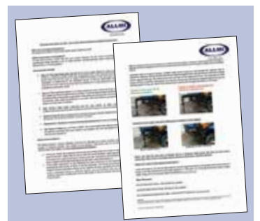
ALLMI has released guidance on loader crane documentation and stabilisers

For a copy of this guidance, please contact ALLMI.