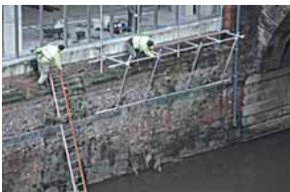
Working over a canal.

These two are installing or removing a cantilever platform for working over a canal. While the platform might well be ideal, the risks in erecting it are clearly not. The HSE warns that risk assessments must also