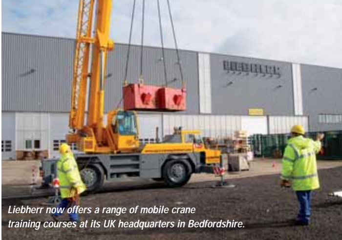
Liebherr now offers a range of mobile crane training courses at its UK headquarters in Bedfordshire.