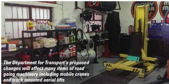
The Department for Transport's proposed changes will affect many items of road going machinery including mobile cranes and truck mounted aerial lifts

The public consultations will close on the 5th March 2015. If you have any comments on the proposed changes email: david.smith@cpa.uk.net