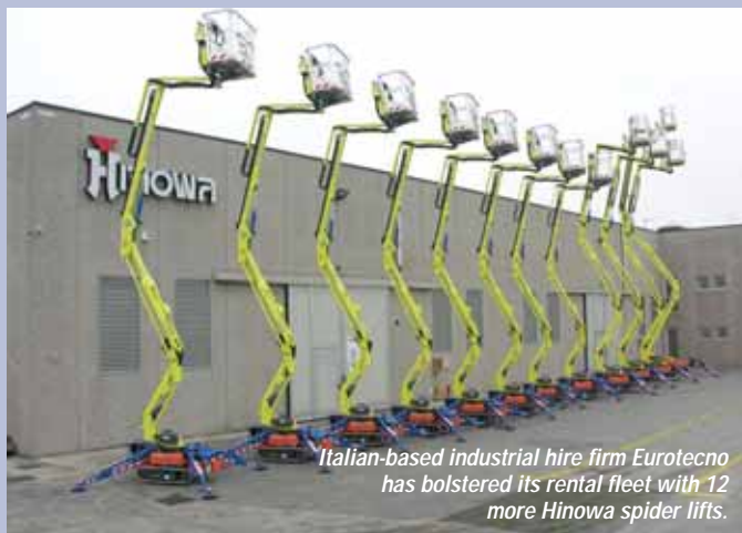
Italian-based industrial hire firm Eurotecno has bolstered its rental fleet with 12 more Hinowa spider lifts.

Italian-based rental company Eurotecno has added 12 more Hinowa tracked spider lifts to its fleet. The order includes a selection of units from the latest Hinowa IIS range, including the 14 metre Gold Lift 14.70, 17 metre Gold Lift 17.80 and 23 metre Light Lift 23.12.