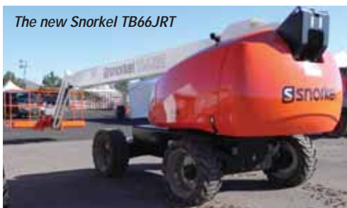
The new Snorkel TB66JRT

and 2.5 metres overall height. The new boom uses the same Polaris chassis as the 62ft A62JRT, which is also common to the company's 40/46ft booms.