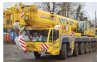
NMT's new six axle Terex AC200-1P can travel with up to 25 tonnes of counterweight along with all its tackle and steel outrigger mats.

In the UK the crane can travel with 25 tonnes of its maximum 68.5 tonne counterweight as well as the extension and normal range of blocks and tackle.