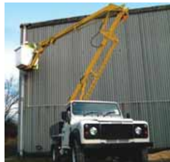
A Gardner Denver Land Rover mounted lift.