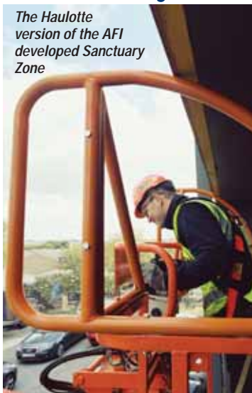
The Haulotte version of the AFI developed Sanctuary Zone

The Sanctuary Zone comprises steel frames mounted on either side of the platform to create a roll-bar effect. By projecting to a height of around 1.8 metres from the platform floor, they mechanically prevent an overhead obstruction from crushing the operator. So far Haulotte and Genie have developed Sanctuary Zones for their booms. The product will be openly available.