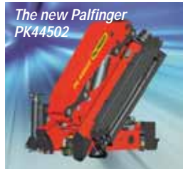
The new Palfinger PK44502

Towards the top of the range, the 85.5 tonne/metre PK 92002 SH will be the largest of Palfinger's three model SH range. It offers up to nine hydraulic extensions and a maximum outreach of 22.5 metres. Crammed full of Palfinger's crane technology it includes the double slewing system, maintenance-free boom system, high performance stability control - HPSC - and Power Link Plus. A new addition is the electronic position damper - Soft Stop - which 'cushion stops' all crane movements before the mechanical end stop is reached, preventing jerky movements and collisions caused by swinging loads.