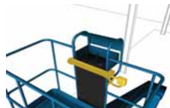
The SkySiren cuts lift functions and sounds an alarm if it senses excess pressure

Developed with Blue Sky over the past three years, it can reportedly be retro-fitted to most boom lifts in a matter of minutes. A longitudinal pressure sensitive rubber strip placed between the operator and the control panel cuts the boom lift functions immediately, in the event of excessive pressure while