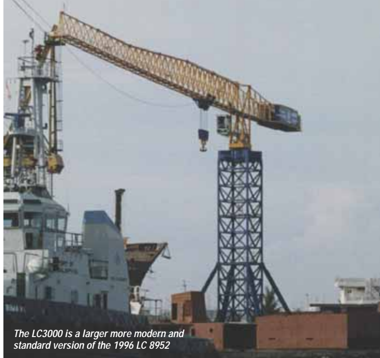
The LC3000 is a larger more modern and standard version of the 1996 LC 8952

The jib sections are big - the largest being 6.2 metres high by 10 metres long. To make them transportable, they fold in half in order to fit into a standard 40ft container. Two tower sections are available, with either a four or 5.5 metre square section, both can be dismantled for transport. The 5.5 metre tower uses the same corner quadrants as the four metre, but with expander sections on each of the four sides. Freestanding height is 88 metres and only two ties are required