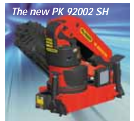
The new PK 92002 SH