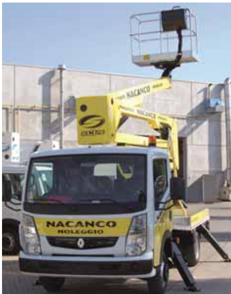
Nacanco has purchased 45 Socage truck mounted platforms

Nacanco has chosen the dual riser articulated lifts to satisfy growing demand for self-drive truck mounted lift rental. The two models include simple full hydraulic controls. All 45 units are mounted on 3.5 tonne Renault Maxity 110.35/5 AC L2 chassis.