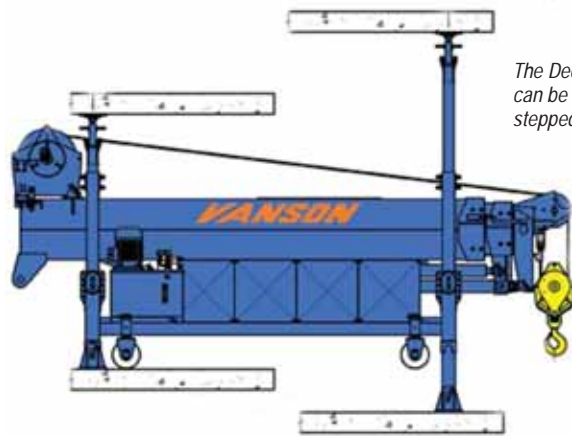
The Deck Loader can be set up on stepped surfaces.

loading decks on each level below. The benefits are that it eliminates the need for telehandlers or tower crane for routine unloading and placement work, freeing up space on the ground which might not even exist, while offering higher capacities and under hook heights than most mini cranes.