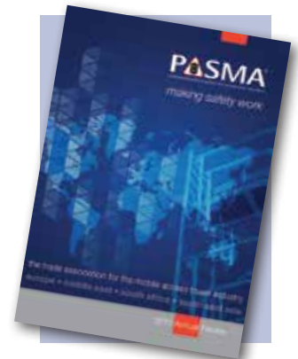
PASMA's Annual Review contains the contact details for all its members

At the end of the meeting, delegates received a copy of the 16-page 2015 PASMA Annual Review containing the contact details for all members. Now available online at www.pasma.co.uk