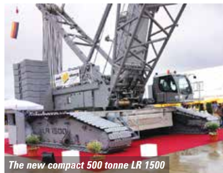
The new compact 500 tonne LR 1500