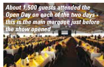
About 1,500 guests attended the Open Day on each of the two days - this is the main marquee just before the show opened