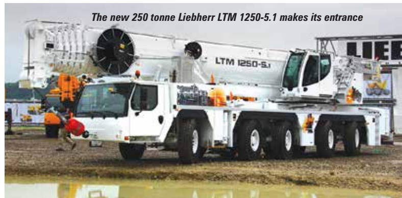
The new 250 tonne Liebherr LTM 1250-5.1 makes its entrance

new 250 tonner the strongest five axle All Terrain on the market. The main boom stays at 60 metres, as does the bi-fold 12.2 to 22 metre swingaway while the maximum hook height has increased seven metres to 110 metres, with the use of seven metre inserts and a connecting section between boom nose and extended swingaway. The 'jib' can be manually or hydraulically luffed by up to 45 degrees.