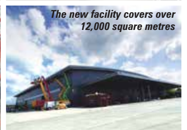
The new facility covers over 12,000 square metres