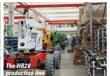
The HR28 production line