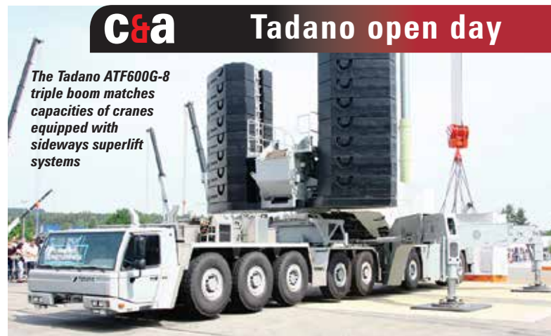
The Tadano ATF600G-8 triple boom matches capacities of cranes equipped with sideways superlift systems