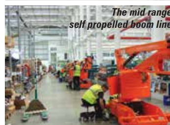
The mid range self propelled boom line