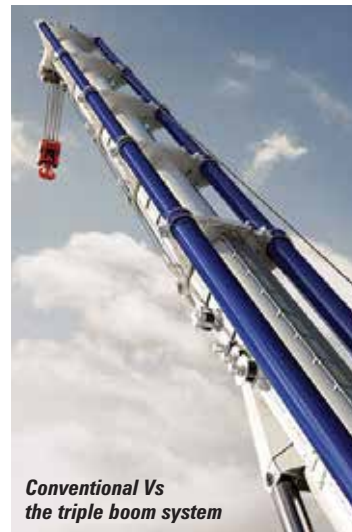
Conventional Vs the triple boom system