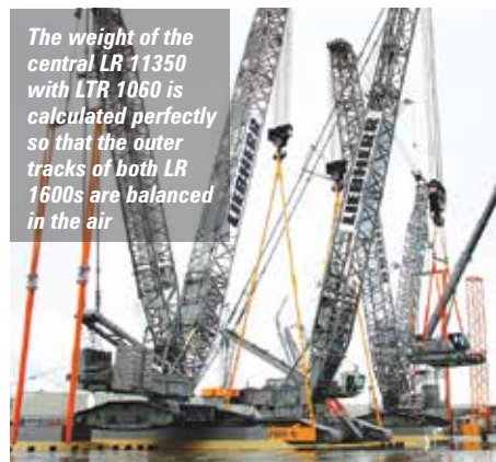
The weight of the central LR 11350 with LTR 1060 is calculated perfectly so that the outer tracks of both LR 1600s are balanced in the air

The day was rounded off in style with an evening laser, music and firework show.