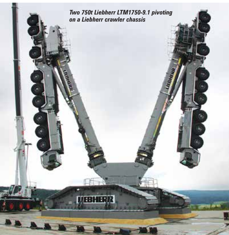
Two 750t Liebherr LTM1750-9.1 pivoting on a Liebherr crawler chassis