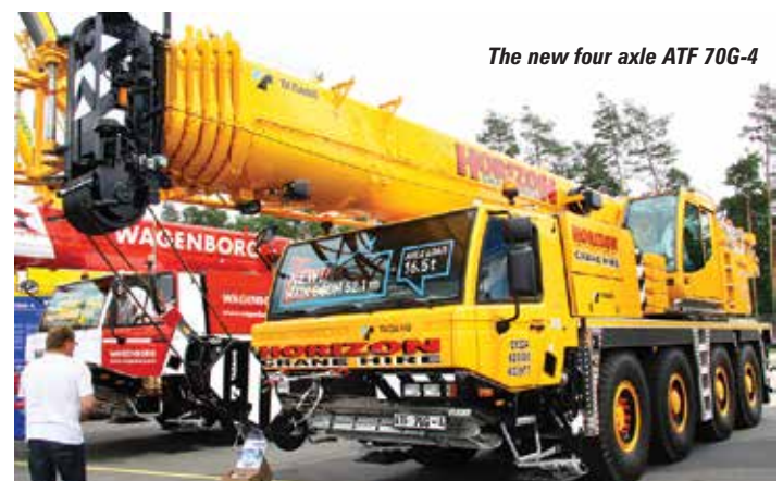
The new four axle ATF 70G-4

Its other key benefit is the greatly reduced tailswing - 6.3 metres less - than most guyed boom cranes.