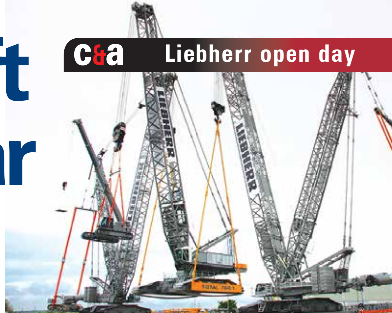
The LR 11350 in the centre - with LTR 1060 on the hook - is being lifted by two LR 1600s each using an LTR 1220 as ballast

The LTM 1250-5.1 is said to offer capacity improvements of between 15 and 20 percent over its predecessor the LTM 1220-5.2 thanks to a larger counterweight - 88 tonnes compared to 78 tonnes - which Liebherr claims makes the