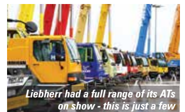
Liebherr had a full range of its ATs on show - this is just a few