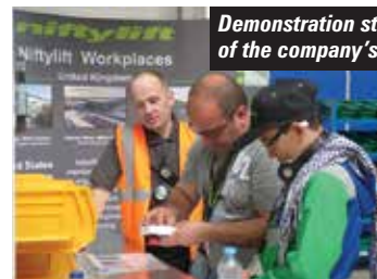
Demonstration stations showed some of the company's assembly methods