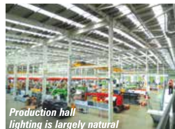
Production hall lighting is largely natural