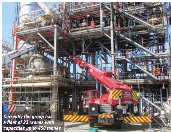
Currently the group has a fleet of 33 cranes with capacities up to 450 tonnes

The group's aim is to have a fleet of 12 cranes up to 100 tonnes capacity in each depot, with a view to expand to a fleet of 50 cranes in the next three years. Supporting the four depots will be its two large cranes placed centrally to the depot network. The fleet also includes four Spierings mobile tower cranes - one, five axle unit and three six axle units which will be added to when it takes delivery of a new six axle unit in February 2016.