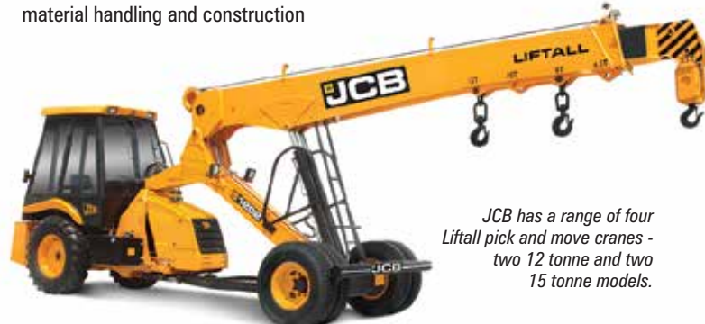
JCB has a range of four Liftall pick and move cranes - two 12 tonne and two 15 tonne models.