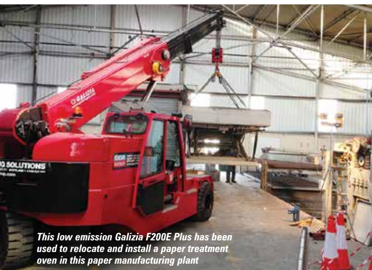
This low emission Galizia F200E Plus has been used to relocate and install a paper treatment oven in this paper manufacturing plant

equipment manufacturing company with a leading share of the mobile and tower crane market segments. It also manufactures mobile tower, crawler, truck mounted cranes and loader cranes as well as general construction equipment including backhoe loaders, vibratory rollers, forklifts and tractors. As well as its seven model range of articulated pick & carry cranes ACE has introduced a more modern looking line of six pick & carry cranes with cabs mounted over the front axle. Its largest capacity crane so far is the 16 tonne SX170 which weighs in at 14.9 tonnes and has the option of a three or four section slotted boom and a 29mph maximum road speed. These cranes use commercial truck drivelines and