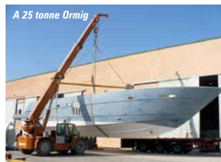
A 25 tonne Ormig