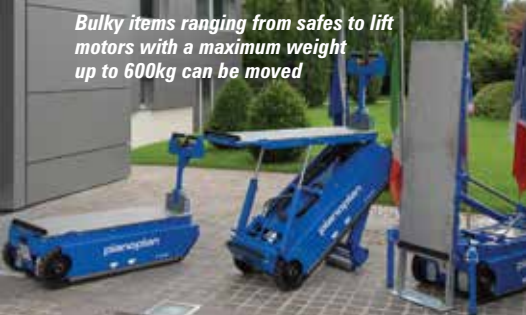
Bulky items ranging from safes to lift motors with a maximum weight up to 600kg can be moved