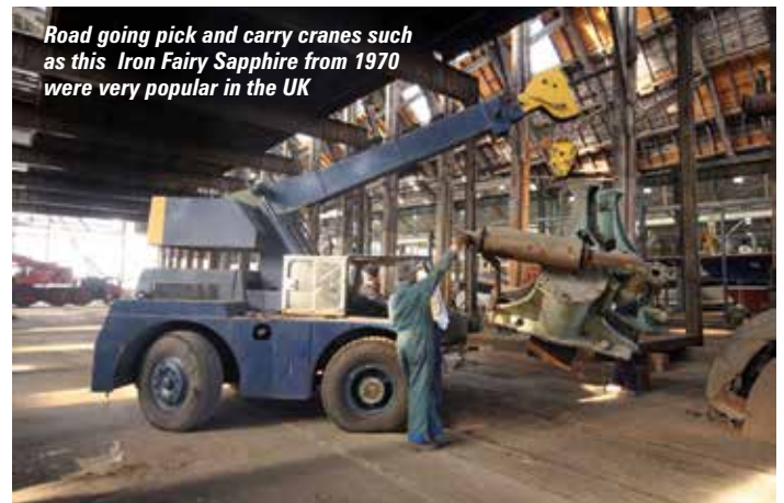
Road going pick and carry cranes such as this Iron Fairy Sapphire from 1970 were very popular in the UK

can cope with gravelled yards and they have limited boom lengths or forward reach. The American industrial Versa-Lift forklift offers an alternative to this design and has carved out a niche for itself for moving heavy machinery, being compact and having very good lift capacity but ideally needs a good surface to operate on.