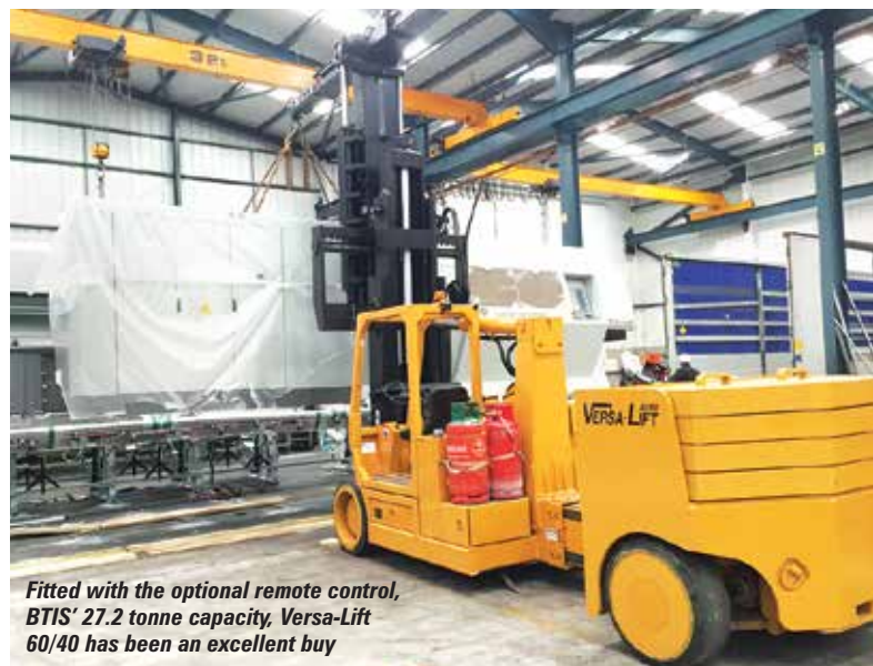
Fitted with the optional remote control, BTIS' 27.2 tonne capacity, Versa-Lift 60/40 has been an excellent buy