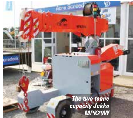
The two tonne capacity Jekko MPK20W

trailers and SPMTs etc. For smaller items there are now many types of equipment that can carry out the job - some may be very small and insignificant looking, but they can be king in really restricted spaces.