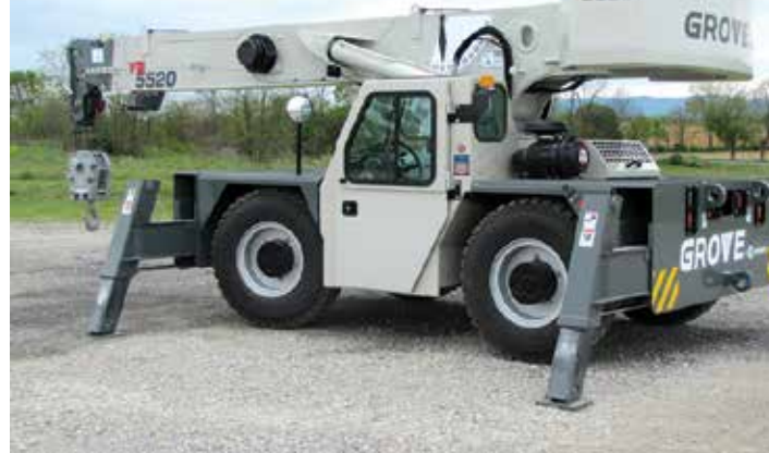
The new Grove Yardboss compares very favourably against the old Grove AP415 and the Jones IF15A

will travel with its maximum 16 tonne load at 800mm from its front bumper, as opposed to the 18 tonne Yardboss YB5520 that can only manage six tonnes.