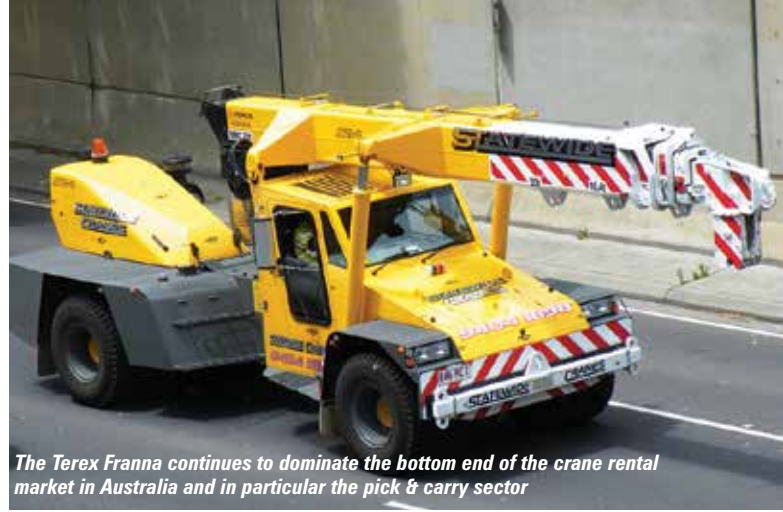
The Terex Franina continues to dominate the bottom end of the crane rental market in Australia and in particular the pick & carry sector

JCB has a range of four Liftall pick and move cranes - two 12 tonne and two 15 tonne models - with either two, three or four section booms giving lift heights from 8.5,