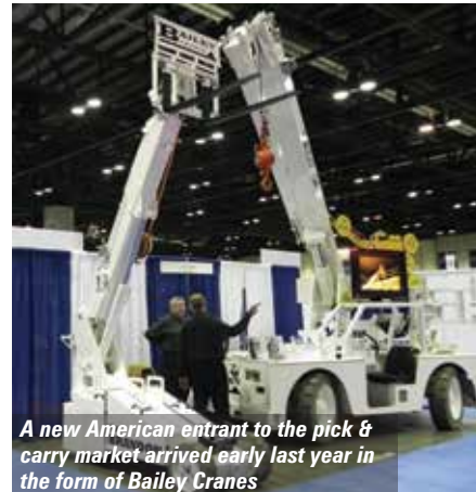
A new American entrant to the pick & carry market arrived early last year in the form of Bailey Cranes