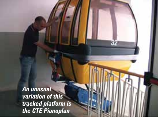
An unusual variation of this tracked platform is the CTE Pianoplan