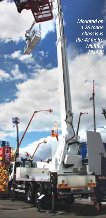
Mounted on a 26 tonne chassis is the 42 metre Multitel MJ420

The truck mounts included the 21 metre MX210 with 9.8 metres of outreach, and permanently inboard jacking at the front and H-frame outriggers at the rear. It also has all inboard jacking facility, with a useful outreach envelope for working in cities and other congested areas. The MX 210 has an all aluminium sub-frame to keep the weight down and when stowed is less than 2.6 metres high and six metres long. The 42 metre MJ 420 with double telescopic boom geometry can be mounted on either an 18 tonne or a 26 tonne GVM chassis. The unit on show was on the heavier of the two and had around 30 metres of outreach.