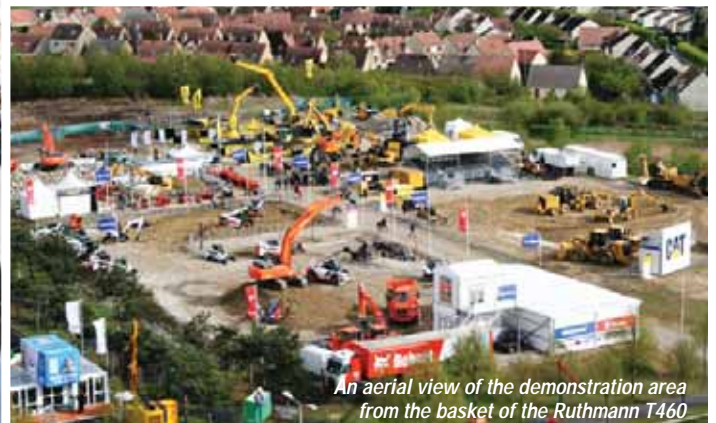
An aerial view of the demonstration area from the basket of the Ruthmann T460