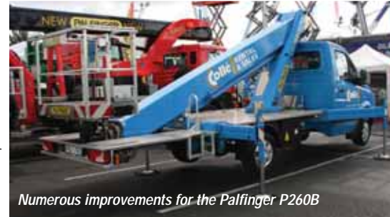
Numerous improvements for the Palfinger P260B

The HT23RTJ claims a class beating 18.1 metres of outreach and a very fast 53 seconds lift speed to full height