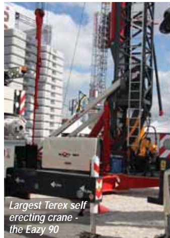
Largest Terex self erecting crane - the Eazy 90

Ease of transportation was a prime factor in the development of the Eazy 90 with three different axle