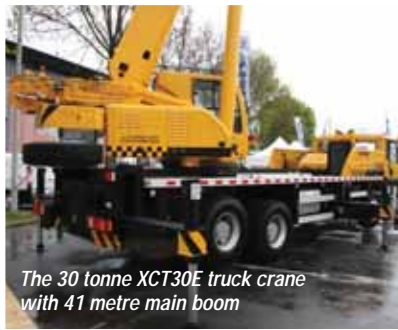
The 30 tonne XCT30E truck crane with 41 metre main boom