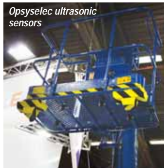
Opsyselec ultrasonic sensors

French company Opsyselec showed another variation on platform safety using ultrasonic sensors mounted on the platform. The system automatically detects objects at distances from 300mm to three metres with an accuracy of up to 10mm. In theory the system could be mounted under, to the sides or on top of the cage automatically stopping all machine functions if an object is detected within the predetermined range.