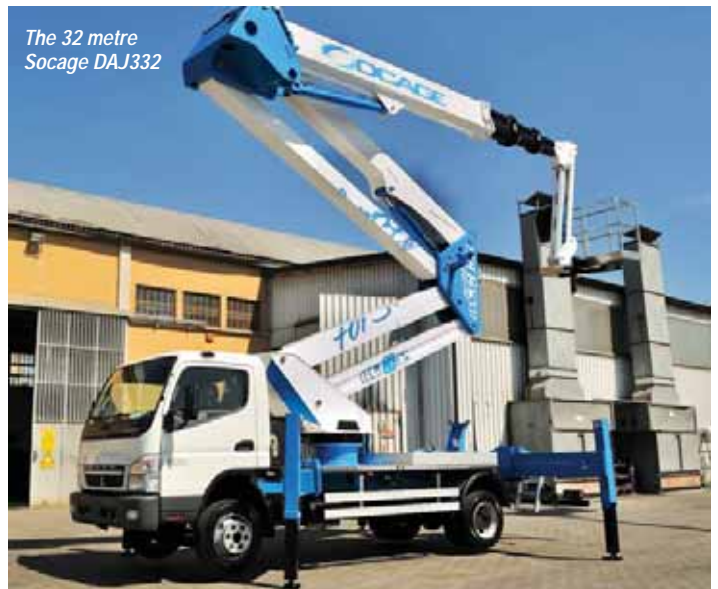
The 32 metre Socage DAJ332

Socage unveiled its new 32 metre DAJ332 mounted on a 7.5 tonne Mitsubishi Canter truck. Derived from the DA328, the new truck mount offers a maximum outreach of 20 metres with 80kg or 17.8 metres with 225kg platform capacity. As well as its automatic hydraulic outrigger set up, the