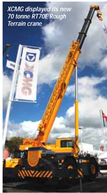
XCMG displayed its new 70 tonne RT70E Rough Terrain crane

Chinese manufacturer XCMG displayed its new 70 tonne RT70E Rough Terrain crane jointly developed with an R&D company in Germany.