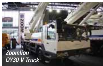
Zoomlion QY30 V Truck