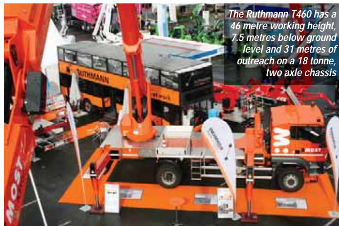
The Ruthmann T460 has a 46 metre working height, 7.5 metres below ground level and 31 metres of outreach on a 18 tonne, two axle chassis