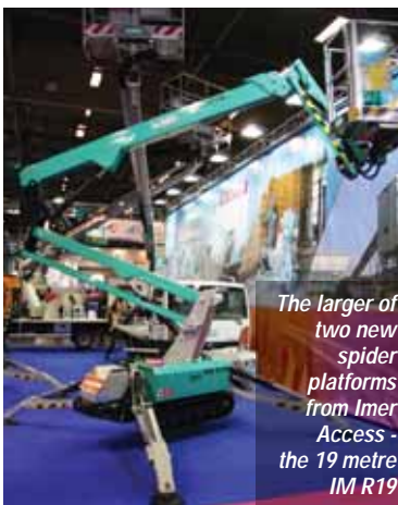
The larger of two new spider platforms from Imer Access - the 19 metre IM R19

Imer Access launched its new IM R line of spider lifts with two new models - the 19 metre IM R19 and the 15 metre IM R15. The range will be extended to four models - probably with the addition of a 23 metre at the top end - at Bauma next year. These new spider lifts should not be confused with the LEM series - the LEM 1200 to LEM 2200 - produced by Platform Basket for sister company IHLmer which will continue as a separate range.