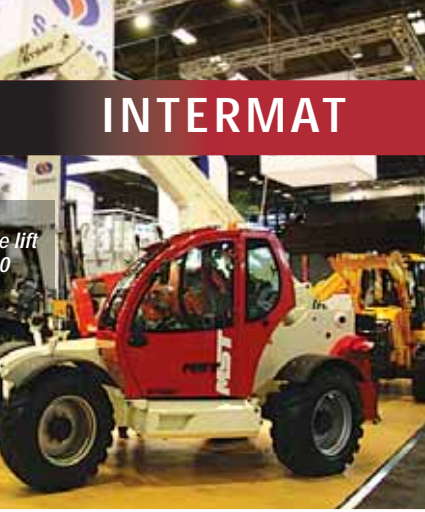
The four tonne capacity 8.7 metre lift height MST ST9.40