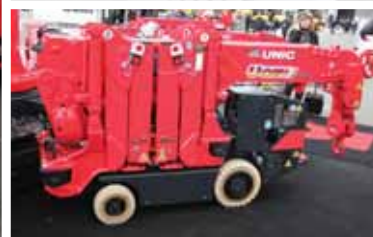
Attracting a lot of interest were the two new wheeled Unic Radial models.

Designed in Germany to European standards, the new AT has a 60 metre U-shaped main boom and 43 metre, three position fly jib giving a maximum lift height of 102 metres. The five axle chassis offers 12 tonnes axle weights, 10x10x10 drive/steer and an 80 kph road speed. Overall length is just under 16 metres and width is 2.99 metres. Power comes from a Euro IIIB Mercedes diesel.