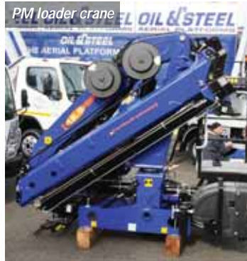
PM loader crane