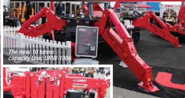
The new 10 tonne capacity Unic URW-1006