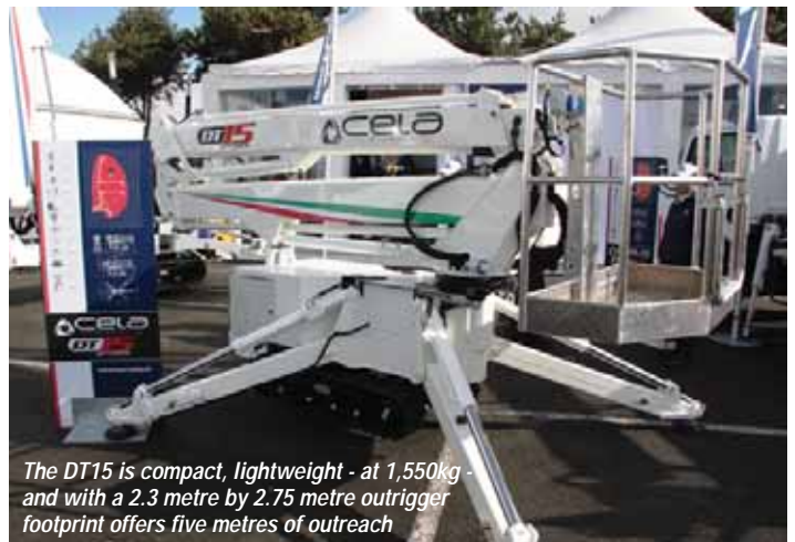
The DT15 is compact, lightweight - at 1,550kg - and with a 2.3 metre by 2.75 metre outrigger footprint offers five metres of outreach

Largest in the three model range is the DT24 with 12 metres outreach and 14 metres up and over reach. Weighing 2.8 tonnes, the unit has a 4.8 metre by 3.55 metre outrigger spread and can reach 4.5 metres