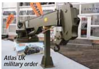
Atlas UK military order