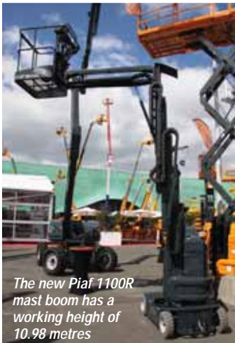
The new Piaf 1100R mast boom has a working height of 10.98 metres