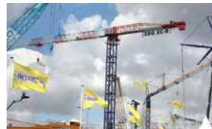
The new 380 EC-B 16 Litronic flat top crane rated at 380 tonne metres its Liebherr's largest in the 15 model range.

Although Liebherr had another very impressive stand, there were few new product launches at the show, with new models being held back for its Customer Days in June. However it did unveil its new 380 EC-B 16 Litronic flat top tower crane - at 380 tonne/metres it is the largest in the 15 model range. The flagship crane - also available in 12 tonne format - has a maximum radius of 75 metres and can lift 3,400kg at the jib tip. Liebherr says that it can also be fitted with an IC or HC tower system - the 256 IC and 365 IC towers having cross-sections of 1.9 by 1.9 metres making them