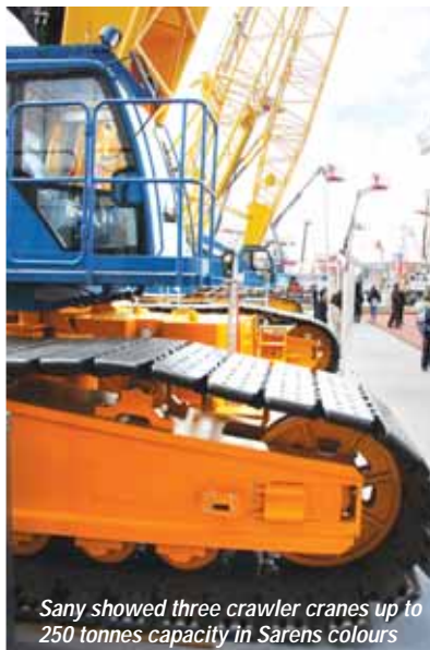
Sany showed three crawler cranes up to 250 tonnes capacity in Sarens colours

Sany was the most prominent of the many Chinese manufacturers, with a hugely impressive stand/building. As well as three crawler cranes - the 250 tonne SCC2500C, the 100 tonne American designed SCC8100 and the 150 tonne SCC1500D - all in Sarens colours, the main crane interest was the new, 220 tonne SAC2200F All Terrain crane.