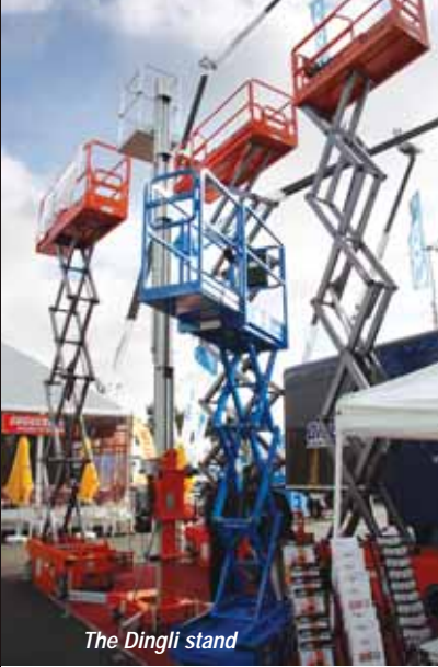
The Dingli stand

attracted more interest. With all the features of the tracked models the non-marking rubber tyres make them ideal for shopping centres or other indoor locations.