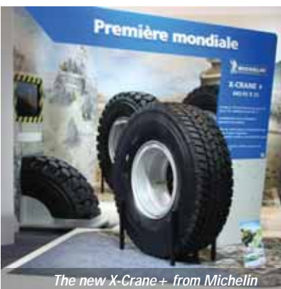
The new X-Crane+ from Michelin

Michelin introduced its new X-Crane+ tyre in the 445/95 R25 TL 174F size which it says can handle the UK's higher axle loadings. The manufacturer says the tyre lasts 15 percent longer than its predecessor, is designed to wear evenly and is