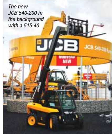
The new JCB 540-200 in the background with a 515-40