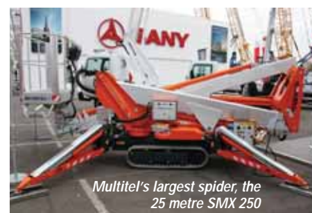
Multitel's largest spider, the 25 metre SMX 250

weight which at 2,660kg is 600 to 700kg lighter than many other platforms in this size range allowing it to be transported on a trailer towed behind a regular 4x4 vehicle. With up to 11.65 metres of outreach, narrow and standard jacking footprints, the unit is extremely versatile. The narrow footprint is less than three metres wide, but still offers full 360 degree rotation.