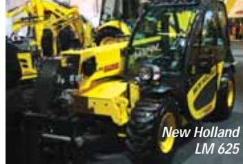
New Holland LM 625