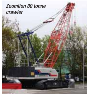
Zoomlion 80 tonne crawler