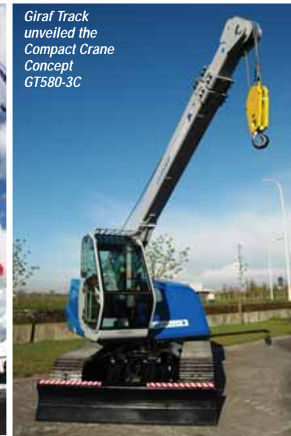
Giraf Track unveiled the Compact Crane Concept GT580-3C

company AFI-Uplift. SanctuaryZone is a simple, cheap, retrofittable structure that protects from crushing against overhead obstructions. More details on page 24.