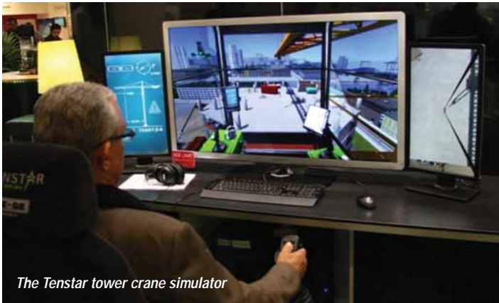
The Tenstar tower crane simulator

screen or LCD display and professional seat with controls.