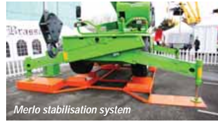
Merlo stabilisation system