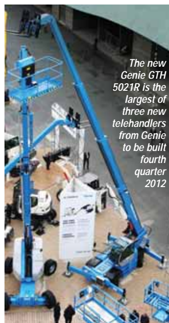
The new Genie GTH 5021R is the largest of three new telehandlers from Genie to be built fourth quarter 2012

The 4018 is said to have impressive hydraulic speeds, telescoping to maximum height in 13 seconds. Its 3.8 metre turning radius ("the tightest in its class"), low cab height and narrow width make it idea for cramped conditions. The GTH 5021 is also compact for its size. Both provide easy access to major components and include an upgraded cab. Production of the