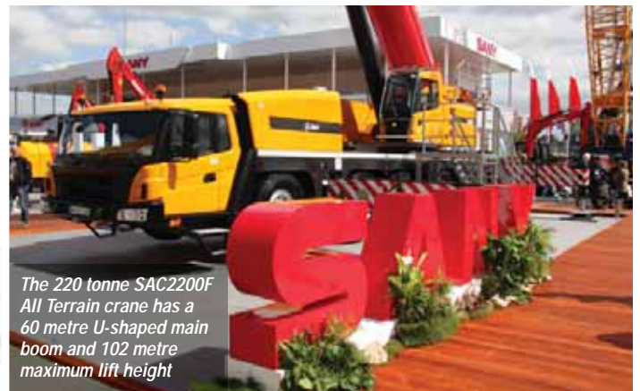
The 220 tonne SAC2200F All Terrain crane has a 60 metre U-shaped main boom and 102 metre maximum lift height

In spite of the impressive look of the 1006, the wheeled 'Radial' models