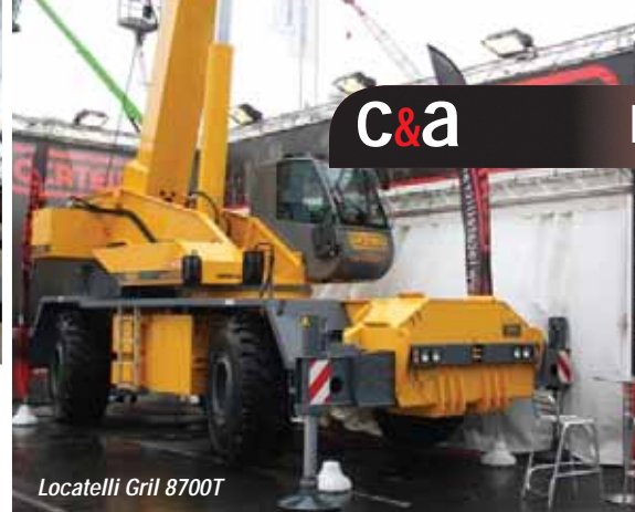
Locatelli Gril 8700T

options available to save time on the road and around the jobsite.