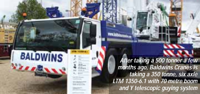
After taking a 500 tonner a few months ago, Baldwins Cranes is taking a 350 tonne, six axle LTM 1350-6.1 with 70 metre boom and Y telescopic guying system

suitable for erection in lift shafts. With the IC tower system, a free standing under hook height of almost 70 metres is possible. The 380 EC-B 16 can be transported on five trucks with the heaviest component - the slewing ring and platform - weighing 7.4 tonnes.