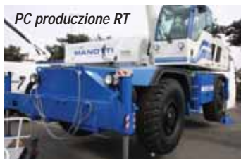
PC produzione RT