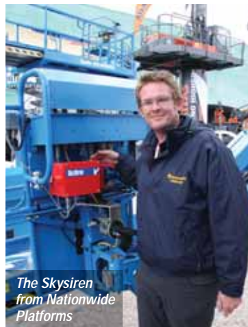
The Skysiren from Nationwide Platforms

One of several anti-crush safety systems for boom lifts was shown by Workzone - part of UK rental