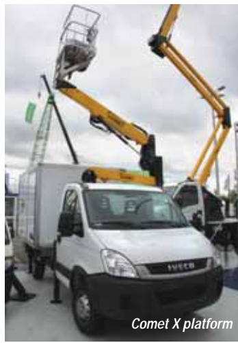
Comet X platform