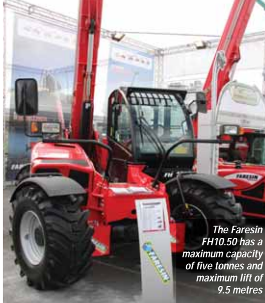
The Faresin FH10.50 has a maximum capacity of five tonnes and maximum lift of 9.5 metres

easier to mount. It can also be seen at Vertical Days in June.