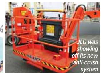
JLG was showing off its new anti-crush system

Swedish company Tenstar Simulation showed off its impressive range of operator simulator products for construction machines including loader cranes and tower cranes. The units can be used with either a projector and