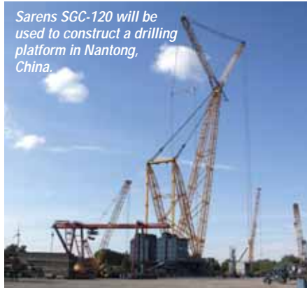
Sarens SGC-120 will be used to construct a drilling platform in Nantong, China.

The project at the Cosco Shipyard for Cheviot Octabouy starts in October and involves lifting several modules of the top-side drilling platform with a total weight of 15,000 tonnes. The heaviest module will weigh 1,300 tonnes. The SGC-120 is currently finishing a contract in Arizona, USA.