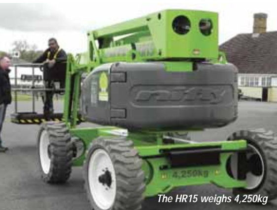
The HR15 weighs 4,250kg

In Europe transportation on 26 tonne delivery trucks should be possible. Power options include diesel 4x2, diesel 4x4 or Hybrid/ Bi-Energy 4x4 with a full battery powered unit possible. Gradeability is 40 percent, platform rotation a full 180 degrees and jib articulation 150 degrees.