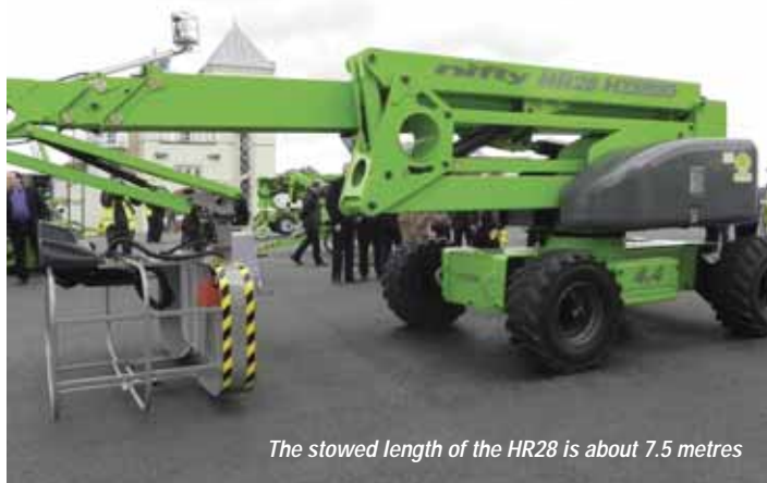
The stowed length of the HR28 is about 7.5 metres

In Europe transportation on 26 tonne delivery trucks should be possible. Power options include diesel 4x2, diesel 4x4 or Hybrid/ Bi-Energy 4x4 with a full battery powered unit possible. Gradeability is 40 percent, platform rotation a full 180 degrees and jib articulation 150 degrees.