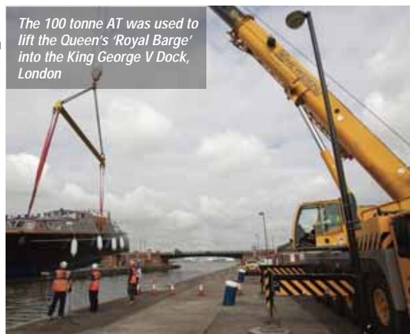
The 100 tonne AT was used to lift the Queen's 'Royal Barge' into the King George V Dock, London

Hewden used a 100 tonne All Terrain crane to lift the Queen's 'Royal Barge' the tender for Britannia into the King George V Dock in London. The vessel was used to ferry the Queen and the Duke of Edinburgh to the Spirit of Chartwell - for the 1,000 strong flotilla on the River Thames.