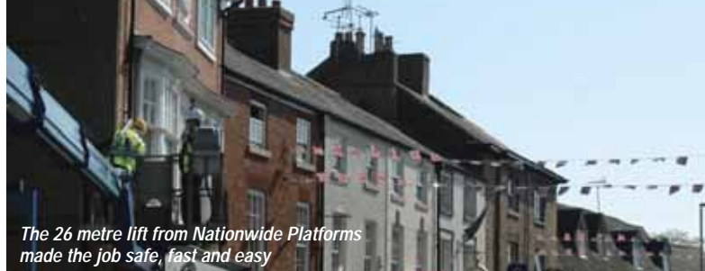
The 26 metre lift from Nationwide Platforms made the job safe, fast and easy

The 11 year old lift had undergone its annual inspection nine months earlier, however the engineer that carried out the inspection has been charged with failing to notice severe corrosion around the back of the chassis and the rear outrigger brackets. By September the problem was causing the outrigger interlock switches to 'trip' and the owner is accused of having ignored or overridden one or more switches to solve the problem, rather than shutting the unit down and having it checked out.