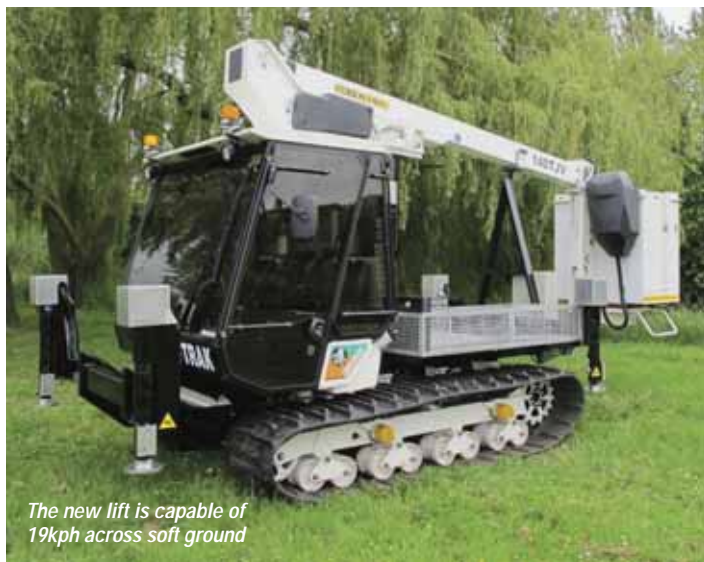
The new lift is capable of 19kph across soft ground

A number of modifications have been made to suit the vehicle, including special levelling jacks and a sub-frame design. The unit, is aimed at the electricity distribution industry. Skyking says that it feels there is a gap in the market for a tracked platform which can be driven over reasonably long distances.