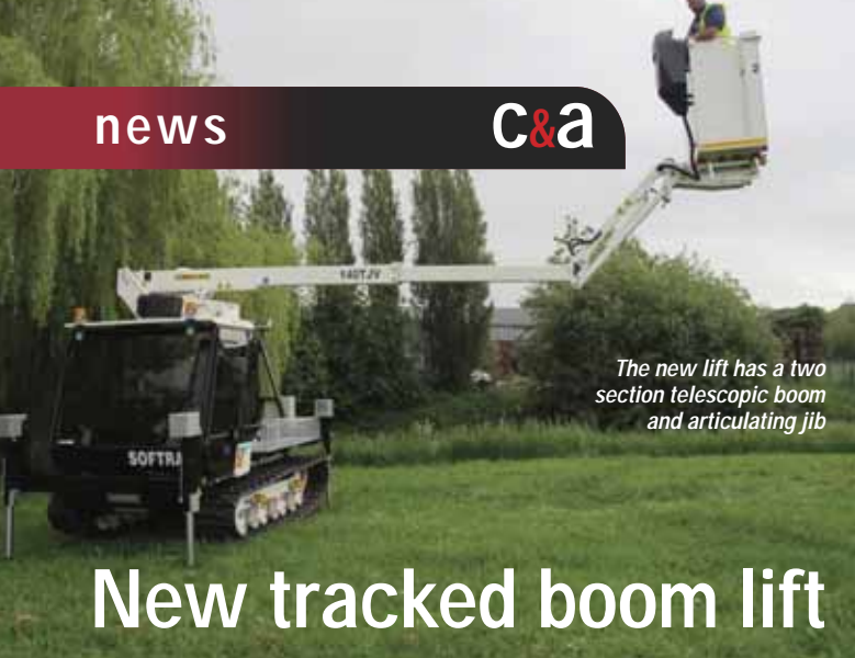
The new lift has a two section telescopic boom and articulating jib