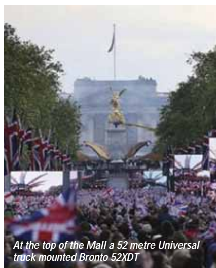
At the top of the Mall a 52 metre Universal truck mounted Bronto 52XDT

The unit was supplied to a flagpole specialist, contracted to complete a full inspection and replace a damaged guide rope on the 13 metre high pole.