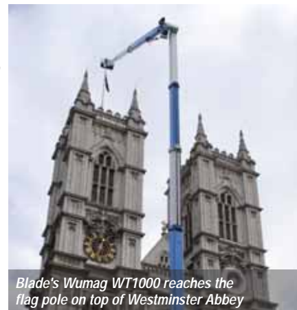
Blade's Wumag WT1000 reaches the flag pole on top of Westminster Abbey

At the other end of the spectrum Blade Access helped Westminster Abbey - scene of English coronations since 1066 - to inspect and repair its roof mounted flag pole at a height of 80 metres in preparation for both the jubilee and the upcoming Olympics. The job required the UK's largest truck mounted lift the Palfinger WT1000 to reach the flag pole on the north tower above the great west door after ladders or scaffolds on the roof were rejected on safety grounds.