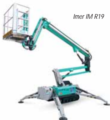
Imer IM R19

Imer will show a selection of products including its brand new 19 metre IM R 19 spider lift unveiled at Intermat, the Iteco Easy Up 5, a 5.2 metre push-around scissor which can also be self-propelled, the 10 and 12 metre IT10090 and IT10122EX battery powered scissor lifts.