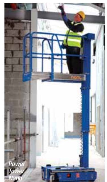
Power Tower Nano

Power Towers will show the latest version of its original Power Tower alongside the Nano and NanoSP. You might also get to see details of a brand new low-level access concept that the company is near to finalising.