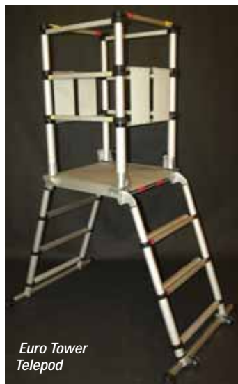
Euro Tower Telepod

Euro Towers will show its 3T Ladder Frame and Advanced Guardrail towers as well as the Teletower and Telepod - its new telescopic range of products. The Telepod offers three platform levels - 600mm, 800mm and one metre.