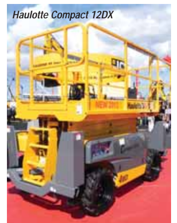
Haulotte Compact 12DX

Haulotte will highlight its new Compact 10 and 12 DX compact Rough Terrain scissor lifts. The four wheel drive machines are fitted with new Kubota Tier IV engines, automatic hydraulic differential locks and heavy duty levelling jacks as well as new covers and a host of other product improvements.