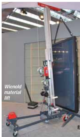
Wienold material lift