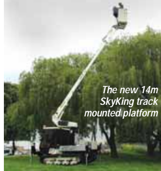
The new 14m SkyKing track mounted platform

The Palfinger Platforms and GSR truck and van mounted distributor is