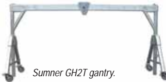
Summer GH2T gantry.

Summer - the leading producer of portable material handlers and welding equipment - will unveil the new GH2T portable gantry crane.