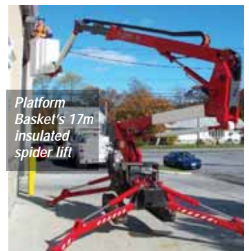
Platform Basket's 17m insulated spider lift

platform capacity. This will also be the first chance to see the first fully insulated (46kVa) spider lift, the 17 metre PB18.90.46 in the UK.