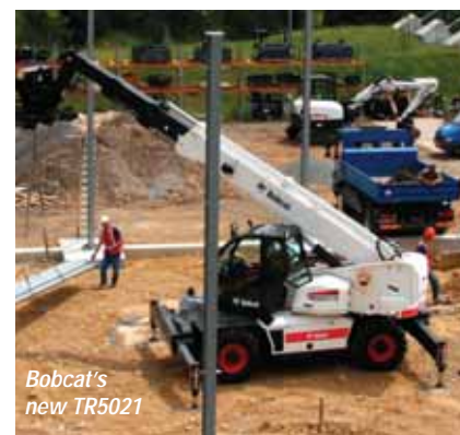
Bobcat's new TR5021

Making its debut at Vertikal Days this year Bobcat will show its five tonne/20.5 metre TR50210 rotary telescopic handler alongside its seven metre/four tonne TL470HF fixed frame model with 130hp power unit.