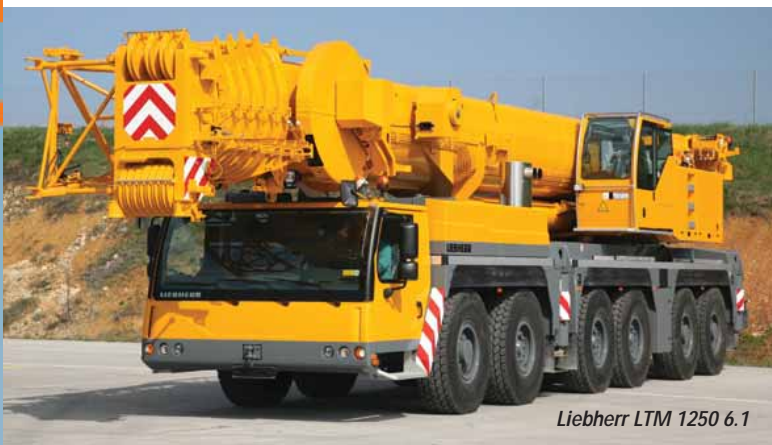
Liebherr LTM 1250 6.1