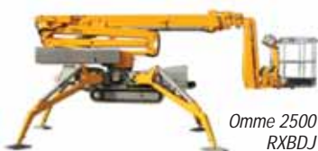
Omme 2500 RXBDJ

APS, the UK distributor for Omme Lift and Hinowa, will show a selection of spider lifts including the first public debut of the new 25 metre Omme 2500 RXBDJ articulated boom spider lift and the Omme 3700RBDJ. Hinowa models will include the 17 metre 17.80 and popular 23 metre 23.12. The company is also the exclusive UK dealer for Wienold and will show the 3.5, 5.0 and 6.5 metre WLU material lifts.