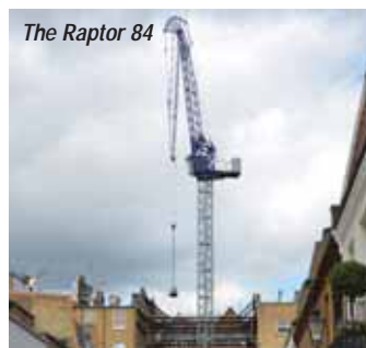
The Raptor 84

City Lifting will unveil a new version of the Swedish-built Raptor 84 articulated jib tower crane. While structurally the same - complete with its four metre out-of-service dimension - the new model includes a new winch speed monitoring system using 'Safety Programmable Logic Controllers' (PLC) where the speed achieved is constantly checked against the speed expected according to controller position and load.