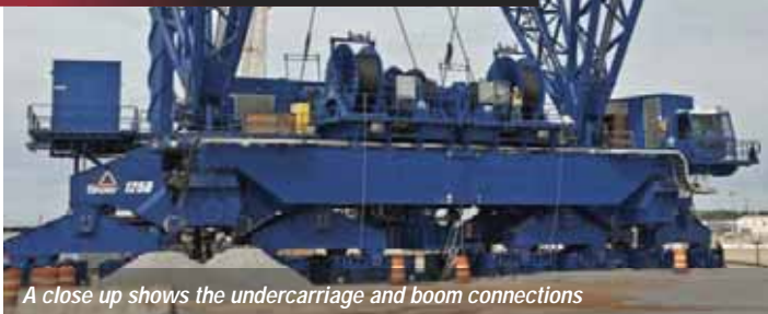
A close up shows the undercarriage and boom connections