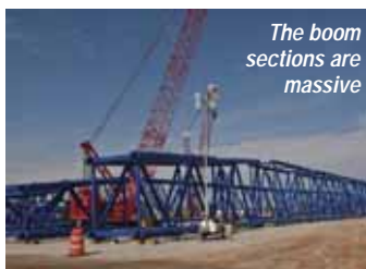
The boom sections are massive

boom and 63 metre fixed jib can lift 3,740 tonnes at 73 metres, 760 tonnes to 195 metres and 455 tonnes to 241 metres. Most lifts for this project will be in the range of a 1,000 tonnes at long radii.