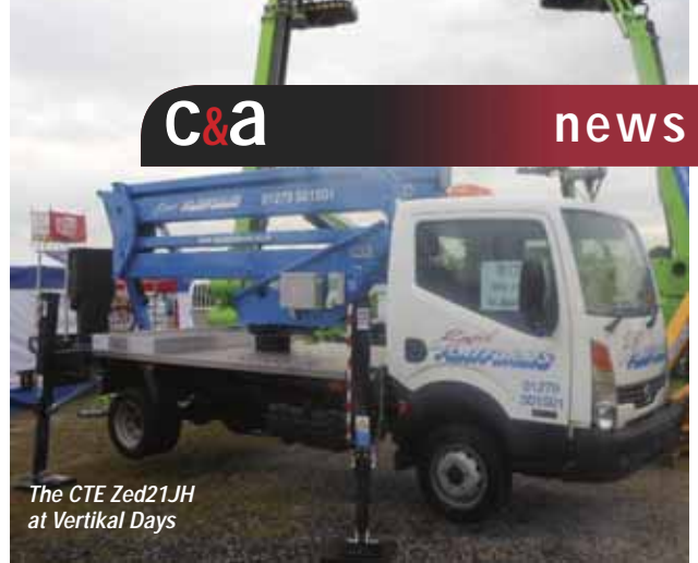
The CTE Zed21JH at Vertikal Days

Rapid Platforms has taken delivery of the UK's first 21 metre CTE Zed21JH 3.5 tonne truck mounted lift. The new platform - unveiled at Intermat in April and on show at Vertikal Days - has now been delivered to the Bishop's Stortford based company. The new, more compact lift offers up to 10 metres of outreach with a 300kg unrestricted platform capacity.