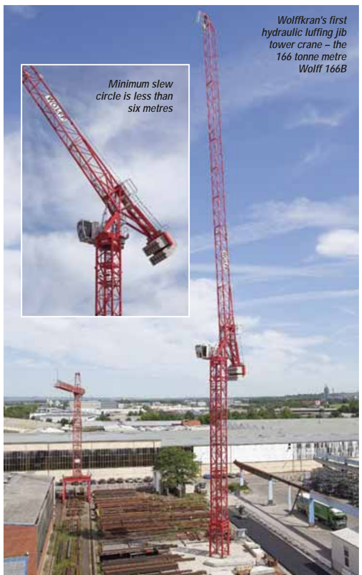
Wolffkran's first hydraulic luffing jib tower crane - the 166 tonne metre Wolff 166B

Minimum slew circle is less than six metres