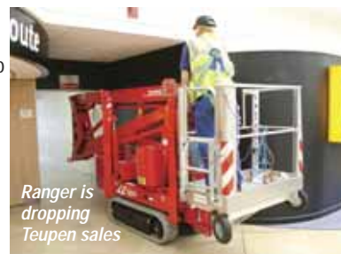
Ranger is dropping Teupen sales

We understand that Teupen is considering some form of direct sales in the UK, possibly through a factory appointed salesperson.