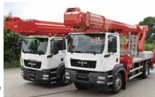
Gerken's new T 580 and T 460 truck mounted platforms.

The T 460 is also mounted on an 18 tonne MAN chassis and boasts a 600kg platform capacity and up to 31 metres outreach. It is fitted with Ruthmann's latest 'Lift-Up' material handling system for bulky and awkward sized items.