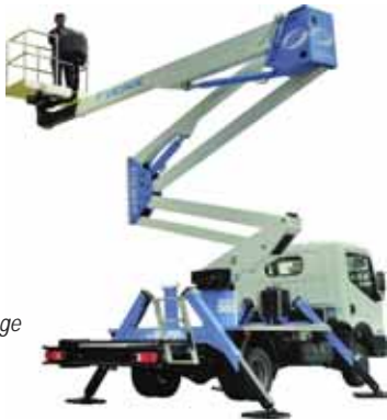
The Socage DA320.

Adiya supplies equipment and services for construction and national utility companies which include the Bahrain Defence Force, Ministry of the Interior, Electricity & Water Authority, Ministry of Education, Ministry of Public Works and the National Guards of Bahrain.