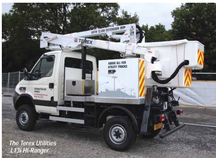
The Terex Utilities L13i Hi-Ranger

South Yorkshire-based TDL Equipment - formerly Terex Distribution - is to distribute and support some Terex Utilities products in the UK. It will start with the Terex L13i Hi-Ranger articulating telescopic aerial device which made its debut at Vertikal Days. The L13i features an insulated platform, 200kg platform capacity, 12.6 metre working height and up to 6.1 metres of outreach. Stable without outriggers, it also features full pressure controls on the side of the platform and a telescopic fibreglass upper boom.