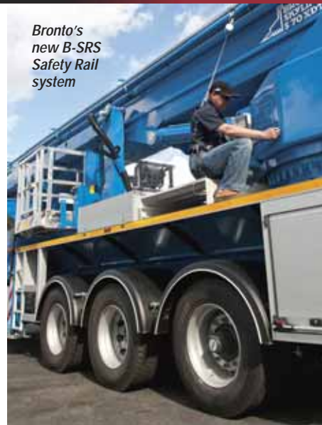
Bronto's new B-SRS Safety Rail system

Bronto has launched a new safety system for those carrying out routine maintenance and inspections on its truck mounted lifts. The B-SRS Safety Rail is a lanyard attachment rail built into each side of the lift's base boom, providing safe freedom of movement along the full length of the machine. The system, developed with the support of lead customer Nationwide Platforms, consists of sliding anchor points for fall arresters, intended to be used as part of a personal fall protection system with full compliance of EN 363.