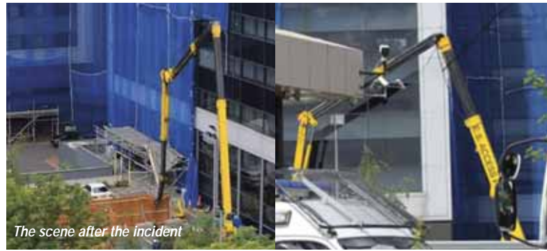
The scene after the incident