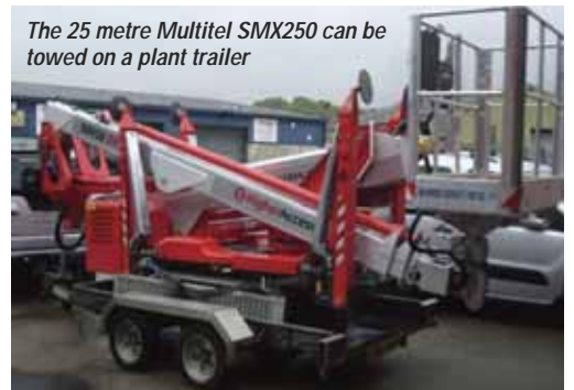
The 25 metre Multitel SMX250 can be towed on a plant trailer

UK based spider lift specialist Higher Access has taken delivery of the first 25 metre Multitel SMX 250 spider lift in the UK. The 250 offers up to 11.65 metres of working outreach, has two outrigger settings - standard and narrow - with full 360 degrees rotation in both configurations. Overall stowed length is 4.8 metres and if the cage is removed the overall height drops to 1.92 metres making it easier to pass through standard doorways. The machines overall weight of 2,660kg allows it to be transported on a two axle plant trailer, towed behind a heavy 4x4, such as a Land Rover.