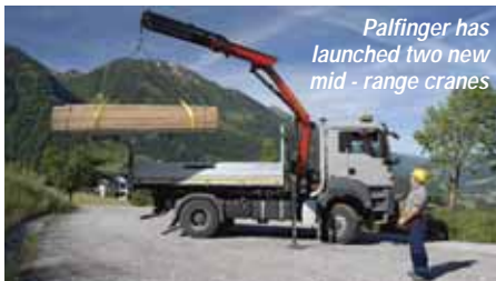
Palfinger has launched two new mid-range cranes

Other features include Soft Stop an electronic limit position damper that comes into operation before the mechanical end stop is reached for smoother operation and to help reduce load swing, and Power Link Plus giving the user constant lifting power over the entire working range. The reverse linkage boom can be angled upwards by 15 degrees above the horizontal and both cranes also have the option of the newly developed tiltable stabilisers that can be pivoted upwards through 180 degrees.