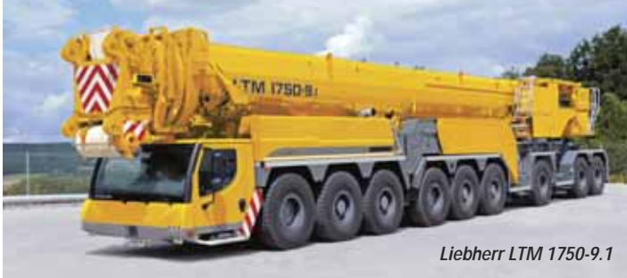
Liebherr LTM 1750-9.1