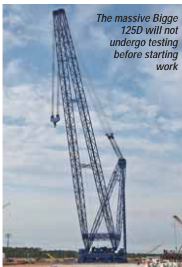
The massive Bigge 125D will not undergo testing before starting work

Bigge's first 4,000 tonne AFRD 125D heavy lift crane has been erected at the Vogtle nuclear power plant in Burke County, near Waynesboro, Georgia. The massive crane, which uses a 5,000 tonne in-ground concrete counterweight, will play a major part in construction of the Vogtle 3 and 4 generating plants. Shaw Group is building the plants - which use an advanced Westinghouse pressurised water reactor, powering a General Electric turbine and electric generator - for client Southern Company. The crane, rigged with 170 metres of main