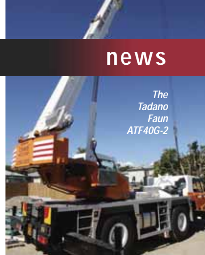
The Tadano Faun ATF40G-2

The first 40 tonne Tadano-Faun ATF 40G-2 All Terrain crane to arrive in Australia has been delivered to Ipswich, Brisbane-based crane rental company Crane Hotline - the same company to take delivery of the first 65 tonne Tadano All Terrain in Australia. The ATF 40G-2 includes a 35.2 metre main boom and nine metre swingaway extension which offsets by up to 40 degrees.