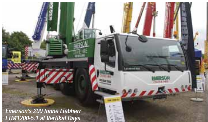
Emerson's 200 tonne Liebherr LTM1200-5.1 at Vertikal Days

The LTM1200 has a 72 metre main boom and was ordered with a 22 metre bi-fold swingaway extension, complete with hydraulic luffing up to 45 degrees. Two extra seven metre intermediate sections take the maximum hook height to 108 metres. An integrated assembly jib which offsets by up to 60 degrees is also included. This unit was supplied with an additional four tonnes of supplementary counterweight in addition to the standard 72 tonnes, in order to provide enhanced capacities at height and long reach. In the UK the crane can travel with both the 12 tonne base counterweight and four tonne supplement on-board.