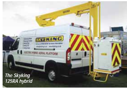
The Skyking 125RA hybrid

The UK distributor for GSR and Palfinger