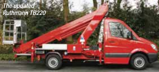
The updated Ruthmann TB220

The TB 220.2 can either be mounted on a Mercedes Sprinter, Nissan Cabstar, Renault Maxcity or VW Crafter chassis. For an off-road version, the Iveco Daily 4x4 can also be used. The larger TB 270 and the TBR 200 can also now be mounted on the VW Crafter chassis.