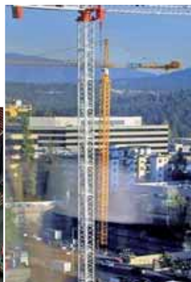
(Above) A picture taken prior to the collapse shows the crane (rear) was possibly up to a metre off vertical.

around six metres from the ground, saving the operators life. Early investigations centred around the cranes' foundation - a 20 metre long by 10 metre wide H shaped steel-beamed chassis supported on four concrete pillars in the basement of the