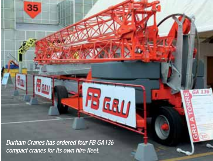
Durham Cranes has ordered four FB GA136 compact cranes for its own hire fleet.