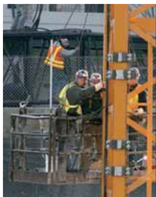
Cracks were discovered in a different tower crane barely a city block away. It has now been dismantled for further tests.

Following the accident Washington State inspectors have visited the 13 other tower cranes in downtown Bellevue as a precaution. Initially they did not find anything untoward, but on December 1, it was discovered that a tower crane just one city block away from the site of the fatal collapse had been discovered with large cracks in the vertical tubes of at least one tower section. The 100 metre high Liebherr crane was erected by the same company, Northwest Tower Crane Service. Steel collars were fitted to prevent the cracks from spreading. A metallurgist who X-rayed the section thought the cracks which were possibly caused by blocked drain holes serious enough for the crane to be dismantled.