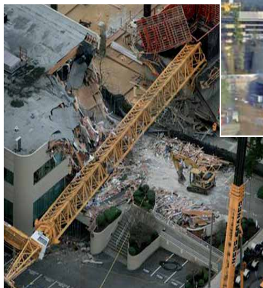
When the foundation of the crane failed it caused massive levels of damage killing a man in a top floor apartment. The crane driver survived.