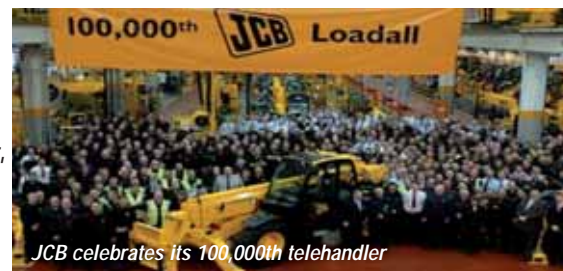
JCB celebrates its 100,000th telehandler

In the October issue of C&A we reported briefly on JCB's celebrations as its 100,000th telehandler, a Loadall 530-140, was delivered in Mid October.