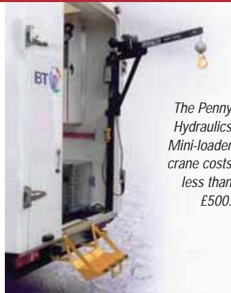
The Penny Hydraulics Mini-loader crane costs less than £500.

BT has been installing the cranes since 2001 for a range of tasks, particularly where regulations forbid manual handling due to weight. Penny Hydraulics modified its standard crane with a shorter boom and a less powerful winch to reflect the specific application, making it