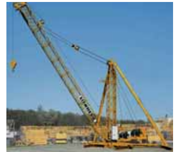
The new 200 DR 5-10 derrick crane for dismantling internal climbing tower cranes from high buildings.

Liebherr has launched a new derrick crane, the 200 DR 5-10, which it says has been designed to dismantle tower cranes of up to 300 metre/tonnes. Its articulated extendible base will adapt to the tops of most tall buildings and can be configured to lift 7.5 tonnes at a radius of up to 25 metres or 10 tonnes at up to 20 metres radius with the stresses being transferred to the buildings' structure. The 200DR 5-10 is equipped with two stiff leg supports, but can also be configured without them. The hoist gear is designed to cope with heights of up to 320 metres on two falls of cable.