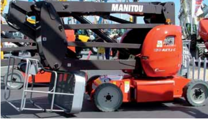
A number of booms can tuck their jibs under to reduce transport length