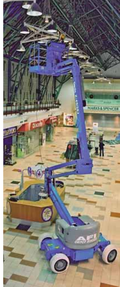
Larger retail applications such as cleaning and repair are ideal for 35 to 45 ft articulating booms - note the tyre covers.

Nifty which leads the small boom sector in the UK, introduced a rough terrain version of its popular HR12N earlier this year. The original Nifty HR12 was weak when it came to gradeability, the later Bi Energy version significantly improved on this, although it's off road - steep slope capability can hardly be called impressive and is not among the reasons buyers like this machine. The new HR12-4x4 changes all that. Available in Electric, Diesel or Bi-Energy formats, it can now demolish steep slopes and loading ramps. Its four wheel drive and extra ground clearance as well as its light weight makes soft muddy conditions a pleasure, rather than an obstacle to skirt around. The new model weighs in at 3,300kgs and is a touch wider than the standard 'N' at 1.6 metres. Finally the new engine cover gives the gawky looking HR12 a more attractive and rugged look, although it will still not win many beauty contests.