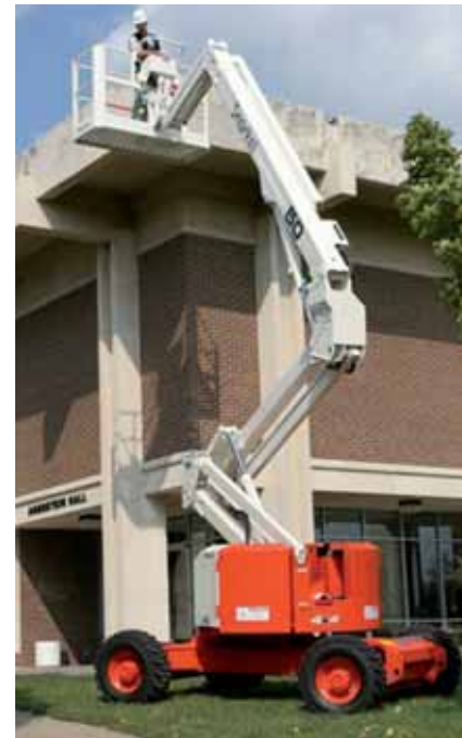
The Snorkel AB50J, its newest articulated boom has simpler, more reliable controls

Snorkel is another producer looking to gain a bigger share of the articulated boom market. The company has made tremendous progress since its remnants were acquired by Elwood Holdings in 2003. However the renewed business has been built on the back of the company's straight telescopic booms which always had a strong reputation. More recently Snorkel has reopened a facility to step up electric scissor lift production, we also understand that is working on at least two new articulated booms although the company would not confirm this. The Snorkel UNO41 is ancient and long overdue for replacement, its AB50J, a more recent offering, is now coming into its own as the