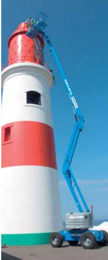
The Platform Company supplied a Genie Z60/34 articulated boom to carry out work on the Souter lighthouse

While the lighthouse is no longer functional the building is maintained to a high standard by the National Trust. When the time came to carry out routine external checks and repairs to the light and paint work, it contacted the Newcastle branch of the Platform Company to provide an efficient access solution. The company supplied one of its new Genie Z60-34 articulated booms. The lifts geometry and 1.8 metre jib proved ideal for reaching all of the contours of the lighthouse.