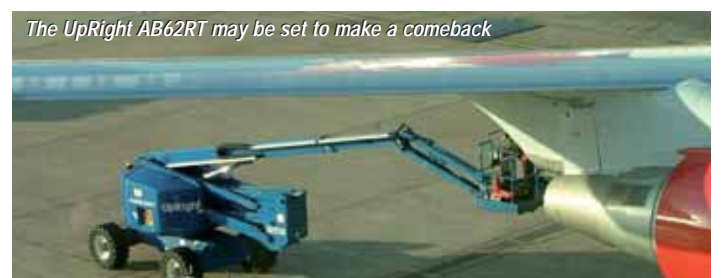
The UpRight AB62RT may be set to make a comeback