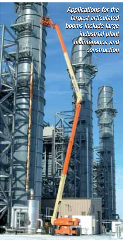
Applications for the largest articulated booms include large industrial plant maintenance and construction

One of the changes slowly creeping in is a shift from the 45ft boom market upwards by as much as 8ft. There are now at least 10 different models of articulating boom with platform heights in the 50 to 53ft range. We compare nine of them in Chart 1, below.