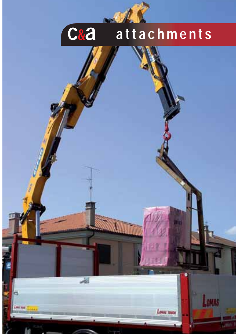
Specific attachments optimise the performance and utilisation of the loader crane as well as improving safety.

All the leading lorry loader manufacturers - Palfinger, Hiab, Fassi and PM - have produced excellent financial results and many are expanding production to meet this increased demand. Even the USA - an area usually preferring straight booms - industry estimates put the knuckle boom market up 50 percent, admittedly from a smallish but still sizeable total. All these factors add up to increased demand and a busy time for attachment suppliers.