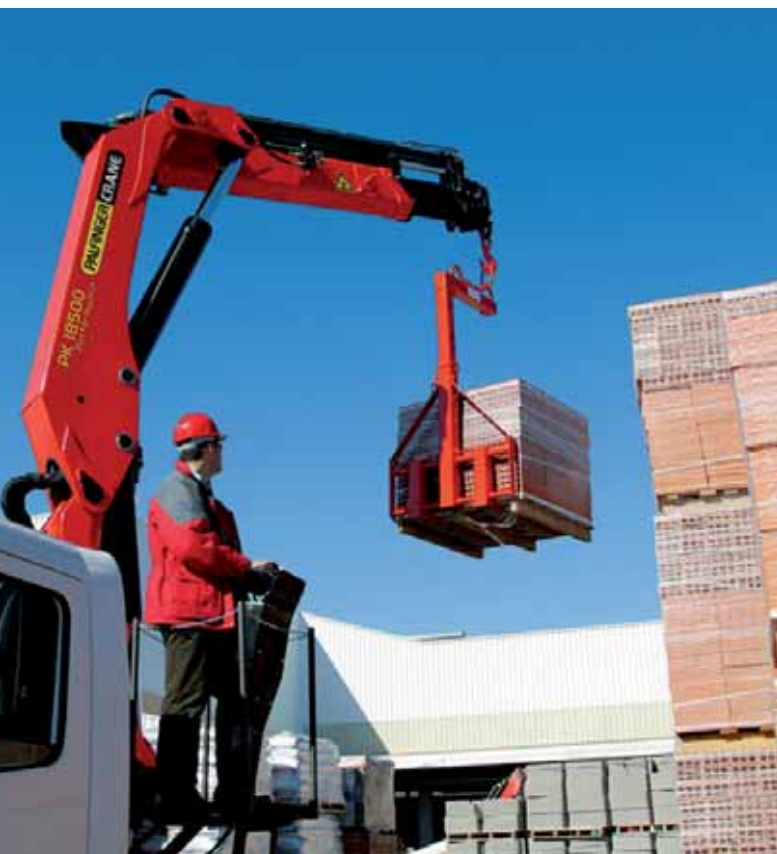
There are many different designs of pallet forks - all making loading and unloading much easier.

In recent years however, loader manufacturers have started to offer their own range of attachments to further improve the utilisation of their cranes.