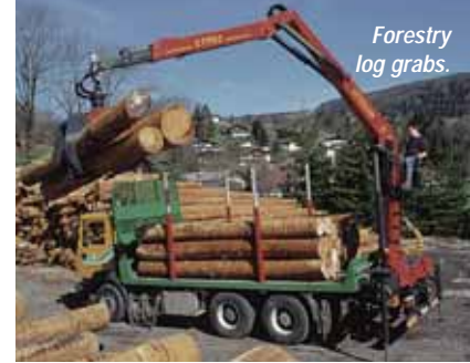
Forestry log grabs.

"The most popular attachment in the UK is a half cubic metre bucket," said Approved Hydraulics' Geoff Hindle. "However in other parts of Europe the open sided general purpose grab is very popular as it can also pick up poles and sheets as well as soil and waste. And by fitting rubber edges can also handle packs of bricks." The company has just sold a unit to a local council so it will be interesting to see how it