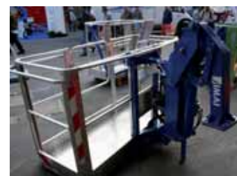
IMAI offers a full range of baskets.

The RH rotating hook is recommended to be used with the FTP pallet forks to eliminate any stress on the crane caused by the load and also to help with load positioning. Hydraulic rotators - both flanged and without flanges - are also available with the company developing a load monitoring unit (LMU) - comprising of a load-sensing hook and receiver - which acts as a load limiting device for manual extensions to comply with EN12999. The hook is available in three weight versions 2,000kg, 3,200kg and 5,400kg with the display placed near the controls showing the load on the hook. A similar device called the RLC is also available from rival loader crane manufacturer Ferrari.