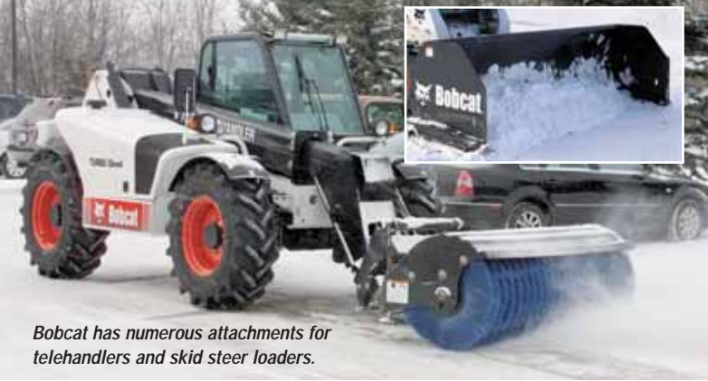
Bobcat has numerous attachments for telehandlers and skid steer loaders.

There also exists a huge range of attachments for other items of equipment such as telehandlers, excavators and the original 'Swiss Army Knife' machine - the skid steer loader. Here is just a brief look at a few recent attachment additions.