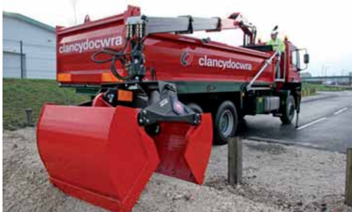
The 500 litre clam shell bucket is the most popular in the UK.

Estimates suggest that more than 50,000 articulated loader cranes were sold worldwide in 2005. Reports suggest that this will increase by around a further seven percent this year and looks set to continue into 2007. The UK and Ireland is an important market possibly taking up to 10 percent of the worldwide total this year.