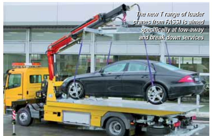
The new T range of loader cranes from FASSI is aimed specifically at tow-away and break down services

diverse range of applications that fit within the capacity of the lorry loader have created interest in several sectors including the recycling industry for bespoke attachments to handle, for example, glass bottle banks, and others to lift, rotate and discharge 1100/1200 litre wheeled containers. Local Authorities are also now seeking a safer solution to replacing and erecting new street lighting columns. The list is endless and will continue to grow as the performance and popularity of the lorry loader grows and there is an increasing need for mechanized handling.