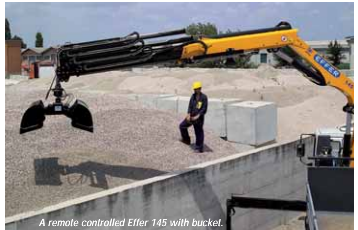
A remote controlled Effer 145 with bucket.

A large percentage of the demand in the UK for attachments is brick/block and clamshell grabs for the 'muck away' civil engineering and local authority sector. However, new demands from a