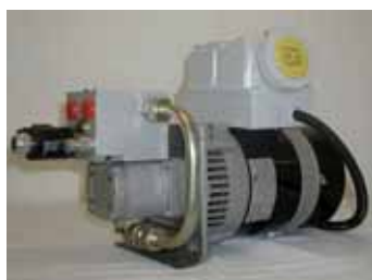
The hydraulic generator powers hand tools and other equipment.

Haulotte is the latest producer to install the company's generators having recently taken delivery of 30 of its 3.5Kva 110v units. This generator is designed to operate in isolation to the functions of