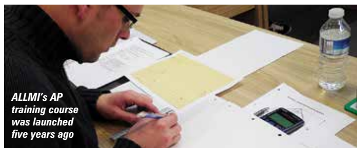
ALLMI's AP training course was launched five years ago

The ALLMI Appointed Person course is the UK's only accredited AP programme dedicated to lorry loader lifting operations and to be fully compliant with the requirements of BS7121 Part 4. The course content was developed by a group of experienced representatives from a variety of manufacturers, fleet owners and training providers, as well as the UKCG and HSE.