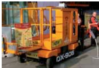
Oxley launched a new air powered version of its OX906 self propelled vertical lift

Leader launched a totally new 20 metre telescopic on the new Nissan Cabstar. The JET200 claims an 8.5 metre outreach at a height of up to 16 metres, with 200kgs capacity. This is achieved with a patented articulating jib which stows inside