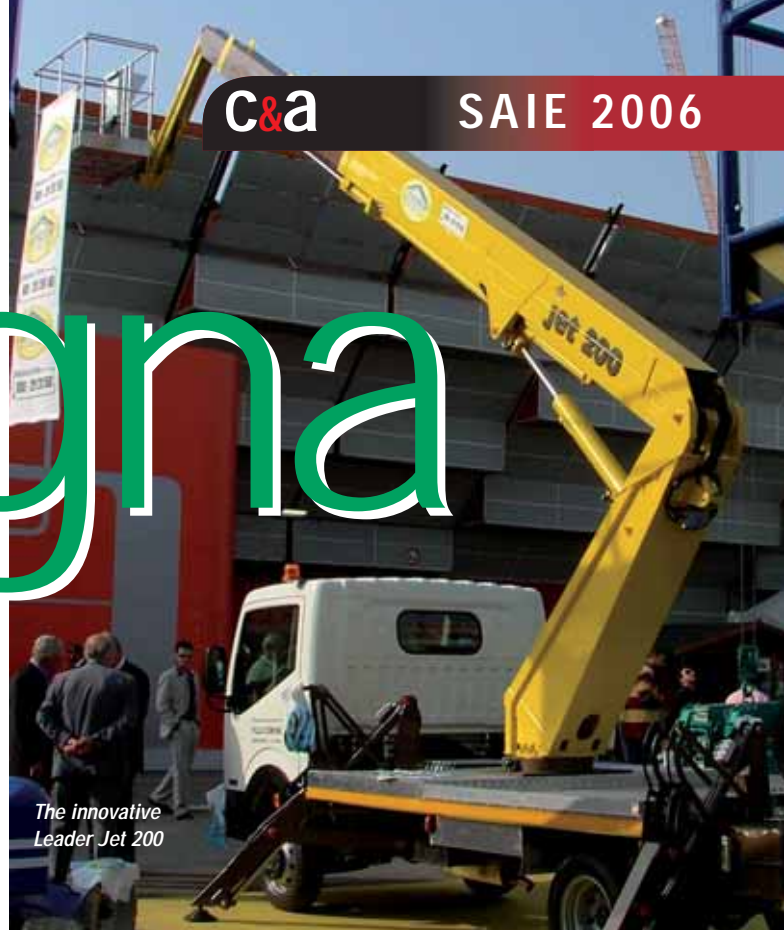
The innovative Leader Jet 200