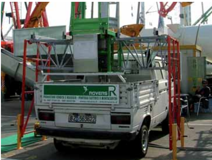
Rovers has designed a simple system for self unloading a mast climber base unit

Four new Eagle S machines, the 6232, 5031, 3824 and 3224 join the two models shown at Internat earlier this year bringing the full range to six machines with working heights up to 62 metres and outreach of up to 32 metres. All hoses and electrical