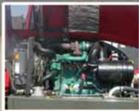
Easy engine access.