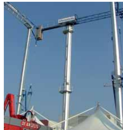
The Benazzato 'Serie 3005 Flat', features a solid galvanized steel octagonal tower, which says the company saves transport space and 'makes a fashion statement'.

San Marco launched two new self erectors, The SMH244NH previously built as a special for customers in Holland, features hydraulic outriggers for fast set up - designed for shorter jobs with more frequent moves.