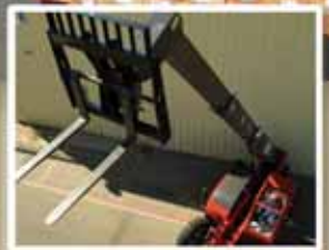
Impressive, maximum reach.