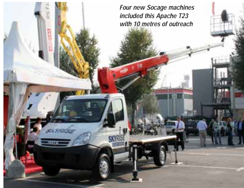
Four new Socage machines included this Apache T23 with 10 metres of outreach

The 50 metre TJ50 truck mount with its dual telescopic booms plus jib is designed for 26 or 32 tonne trucks. The larger chassis offers 30 metres of outreach with 300kg, while the smaller unit offers an overall length of less than 10 metres. One to look out for from Socage in the near future is a 42 metre platform on an 18 tonne chassis.