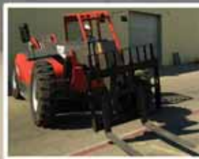
Tilts 10° right or left.