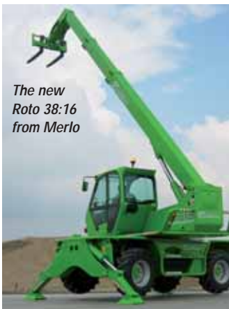
The new Roto 38:16 from Merlo