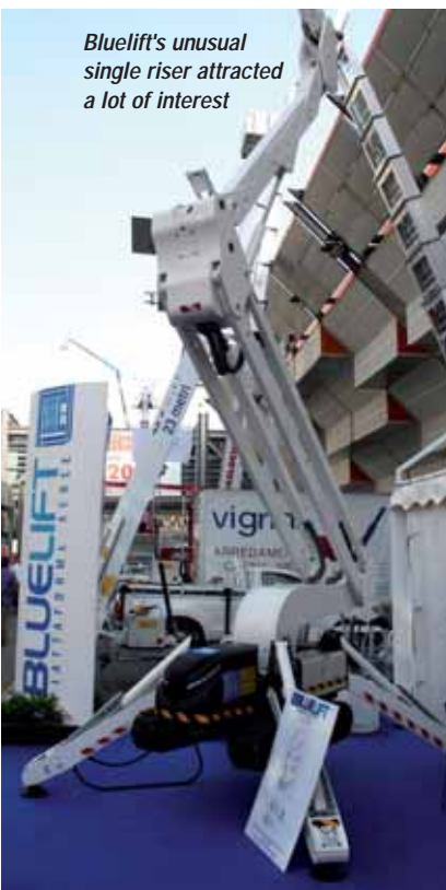
Bluelift's unusual single riser attracted a lot of interest

Bluelift, showed off its growing spider lift range. The well designed, high specification product range now extends from 12 to 21 metres. Its new 16 metre SA16 Compact features a single riser and three stage telescopic boom, providing almost eight metres of outreach. The company has already signed up a number of distributors, including Rothlehner in Germany, Cherry Picker in Ireland and is set to confirm an appointment for the UK.