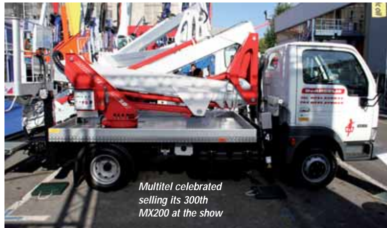
Multitel celebrated selling its 300th MX200 at the show