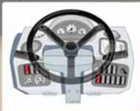
Comprehensive, intuitive console.