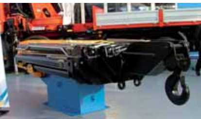
Only the second boom of the massive Effer 2750 was on display