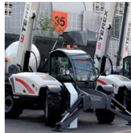
Terex showed its new 4013SX telehandler, a stripped down, lower cost unit with a mechanical gearbox, aimed at the rental market.

Fourth in global sales behind Palfinger, Hiab and Fassi, PM is keen to close the gap and plans to install a new, compact and simpler version of its Powertronic electronic management system in its 2 to 10 tonne/metre range. It also plans to use funds from its IPO, due later this month, to increase production and improve its international distribution.