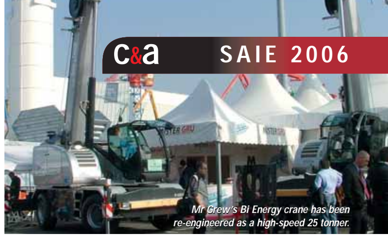
Mr Crew's Bi Energy crane has been re-engineered as a high-speed 25 tonner.

The 'Clever Crane' from Gelco offers an 'off the shelf' engineered solution for erecting self erecting cranes 2.75m above rights of way that cannot be closed. 12 models are available, all of which can travel with the tower erected and can climb steep slopes and set up on uneven ground.