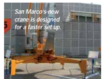
San Marco's new crane is designed for a faster set up.

Cattaneo - available in the UK through Weaving Machinery - introduced three new self erectors, the CM73A, the CM76B and the largest the CM90S4 which has a one tonne capacity at 41 metres radius and 25 metres under hook height.