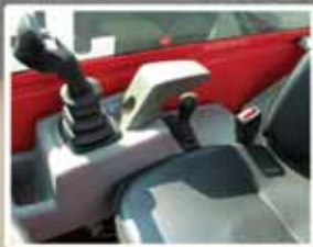
Joystick moves with operator's seat.