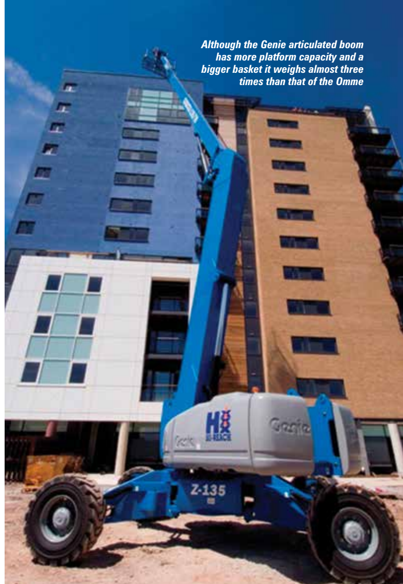
Although the Genie articulated boom has more platform capacity and a bigger basket it weighs almost three times than that of the Omme

The new Bluelift Hybrid line claims to be the first compact track mounted spider lift to combine a