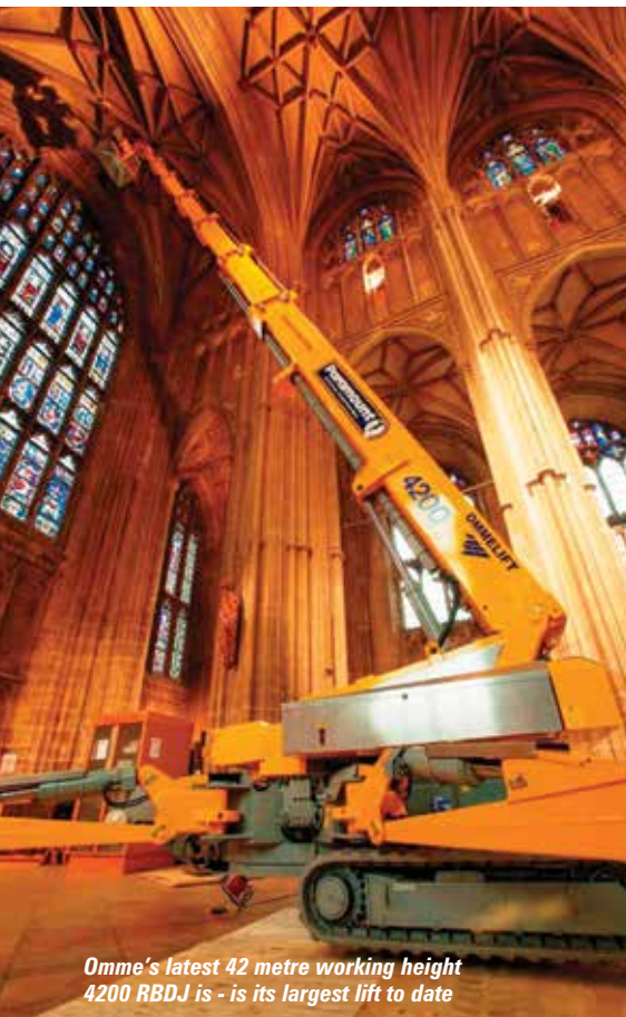
Omme's latest 42 metre working height 4200 RBDJ is - is its largest lift to date