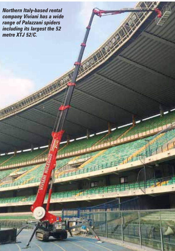
Northern Italy-based rental company Viviani has a wide range of Palazzani spiders including its largest the 52 metre XTJ 52/C.

22.10 EVO (Evolution) which is lighter (less than 3,000kg) and has 30kg more basket capacity at 230kg.