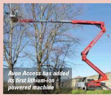
Avon Access has added its first lithium-ion powered machine

of the job." The machine has an unrestricted platform capacity, of 230kg, and up to 9.7 metres of outreach. The dual sigma riser provides a perfectly parallel lift, ideal for working on walls, while its 800mm overall width and stowed height of less than two metres, allow it to pass through narrow doorways. The easy-set outriggers include single button self-levelling.