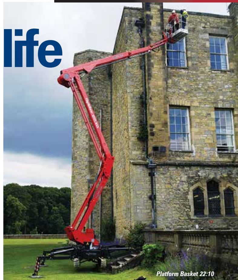
Platform Basket 22:10

Two issues ago we took an in-depth look at hybrid technology and in particular how it is being applied to scissor and boom lifts. Hybrid technology however is also becoming important in other access platforms, and most particularly, spider lifts. One of the early pioneers of multi power source drives for access equipment was Danish manufacturer Omme Lift. It has been building aerial lifts for 35 years and produced its first bi-energy model - the Ommelift 2500EBD, a trailer mounted boom with diesel and battery power - in 1994. This platform had a powerful battery pack, which allowed independent and environmentally friendly operation which was especially appreciated in residential areas. However it was found that in certain applications - such as tree work - the battery did not have enough capacity to work for the whole day - and this was more apparent when the temperatures were low. The solution was to combine battery and engine power creating, with the engine acting