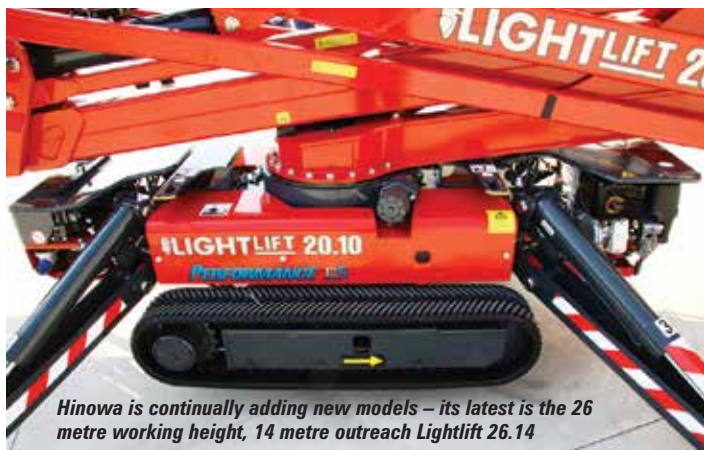
Hinowa is continually adding new models – its latest is the 26 metre working height, 14 metre outreach Lightlift 26.14

The first manufacturer to offer lithium powered spiders was, as already mentioned, Italian manufacturer and spider lift market leader Hinowa, which launched its first, all-battery powered tracked Goldlift 14.70 at the end of 2009. This it followed with a 19 metre version about six months later when