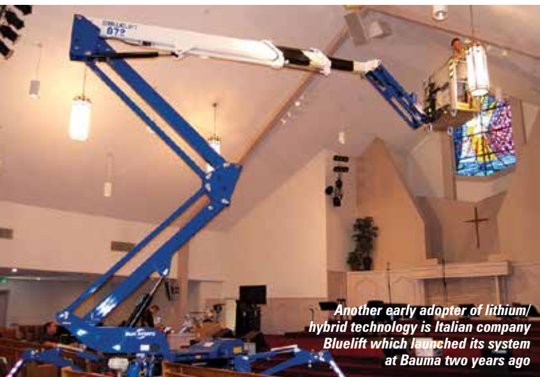
Another early adopter of lithium/hybrid technology is Italian company Bluelift which launched its system at Bauma two years ago

choose between either battery power or combustion engine. Bluelift uses a 90 amp hour (200Amp/Hour on C22 model) lithium, iron-phosphate battery pack mounted directly to the machine which powers all functions in both travel and lift modes. The battery lasts between six to eight hours on one charge - claimed to be 20 percent better than the average - and can be recharged to 80 percent of full capacity within two hours when connected directly to mains power of either 110 or 240V.