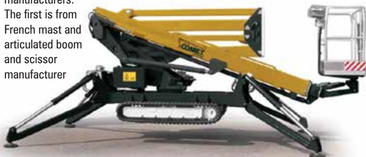
CoMet is also entering the market with its first spider lift the 21.3 metre Leopard

The first is from French mast and articulated boom and scissor manufacturer