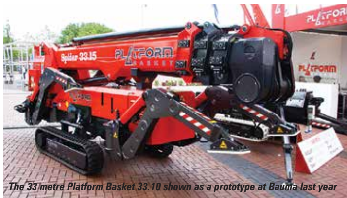
The 33 metre Platform Basket 33.15 shown as a prototype at Bauma last year