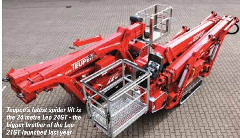
Teupen's latest spider lift is the 24 metre Leo 24GT - the bigger brother of the Leo 21GT launched last year

The Leo 24GT also features a new basket design allowing the replacement of any of its constituent parts when damaged. The new lithium battery drive option is now in series production. Seen at the last Intermat on the Leo 21GT, the battery pack fits into the same housing as the combustion engine and consists of four Lithium-ion cells which supply the 48 volt system,