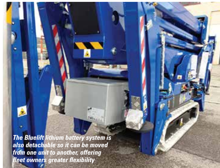
The Bluelift lithium battery system is also detachable so it can be moved from one unit to another, offering fleet owners greater flexibility