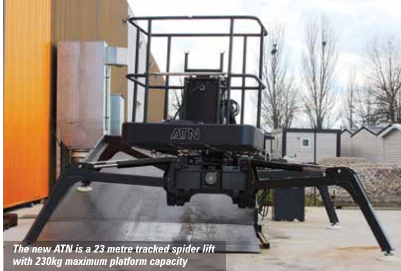
The new ATN is a 23 metre tracked spider lift with 230kg maximum platform capacity

Platform Basket has also recently updated its 22.10 launching the new