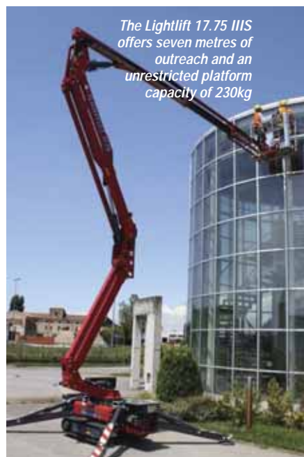
The Lightlift 17.75 IIIS offers seven metres of outreach and an unrestricted platform capacity of 230kg

Hinowa's marketing director Davide Fracca said: "This machine is very interesting for a wide range of customers. We expect to gain additional market share with this Heavy Duty product, which complements our existing IIIS line."