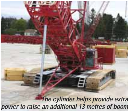
The cylinder helps provide extra power to raise an additional 13 metres of boom