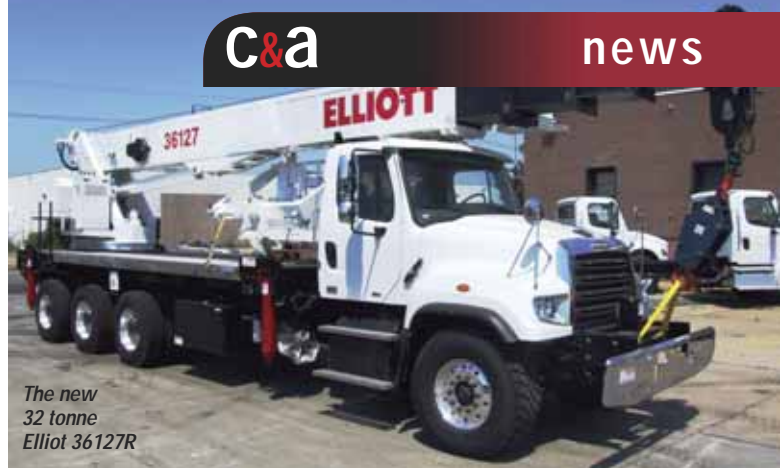
The new 32 tonne Elliot 36127R