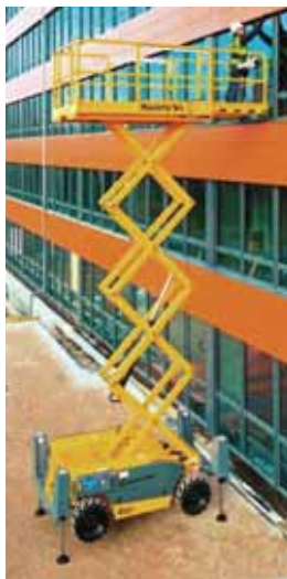
The C10DX is now available in North America as the Compact 2268RT.

With platform heights of 26 and 33ft, the 68 inch wide units offer a 450kg and 565kg platform capacity respectively. The automatic hydraulic differential lock helps the machines cope with uneven ground, while the newly designed auto-levelling jacks option provide fast set up and ensures that all four legs are in contact with the ground. The models will initially be manufactured in Europe and shipped to North America.