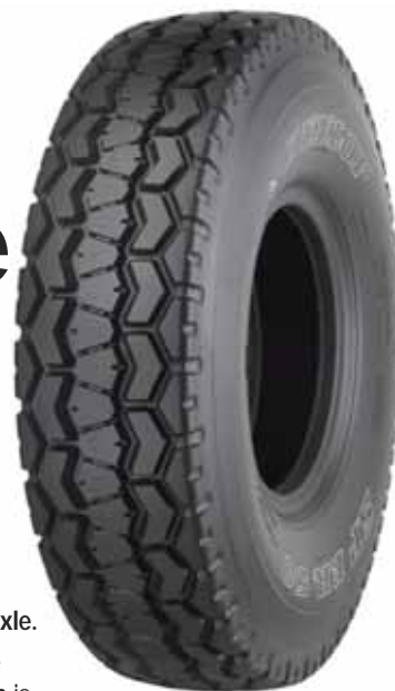
The Dunlop ER50 All Terrain crane tyre

The tread on the new tyre retains the continuous zigzag central zone, which is said to improve the footprint, prevent vibration and result in better ride comfort.