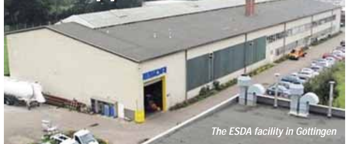
The ESDA facility in Göttingen