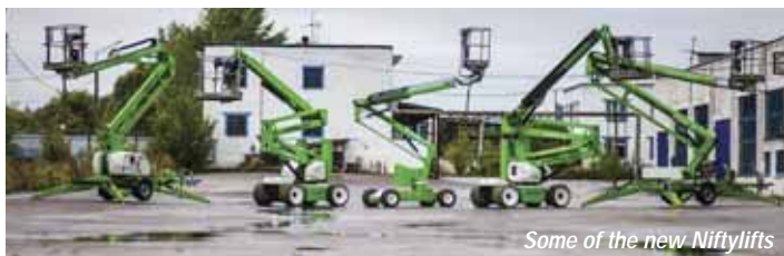
Some of the new Niftylifts