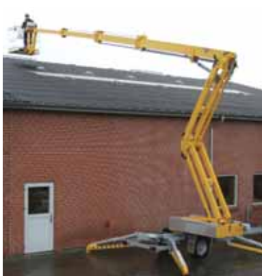
Omme Lift's new 2300 EX was unveiled at this year's Platformers' Days.

The dual riser lift offers an outreach of up to 12.7 metres with an approximate up and over height of six metres. Weighing 3,150kg it is 7.32 metres long and 1.7 metres wide and powered by a 200Ah battery pack. It can also be used in conjunction with a petrol or diesel engine or supplied as a 230V AC mains unit.