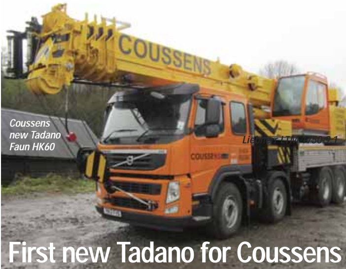
Coussens new Tadano Faun HK60