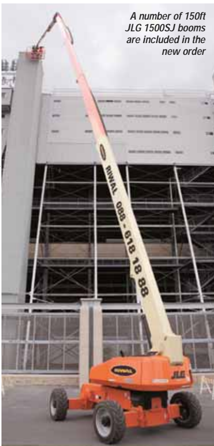
A number of 150ft JLG 1500SJ booms are included in the new order

JLG's managing director Europe Wayne Lawson added: "It is encouraging to see Riwal investing in its fleet, particularly as a substantial percentage of the product mix includes new models which JLG has launched in the last 24 months."