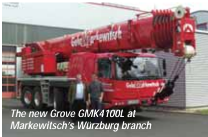
The new Grove GMK4100L at Markewitsch's Würzburg branch