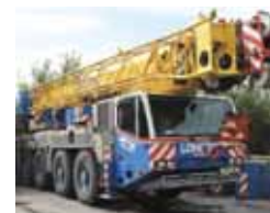
Longton's cranes are being sold at auction.

UK-based Longton Crane Hire of Stoke on Trent appointed an administrator in August who promptly decided to cease trading and liquidate the company's assets. An online auction is being held this month to dispose of the remaining cranes and transport.