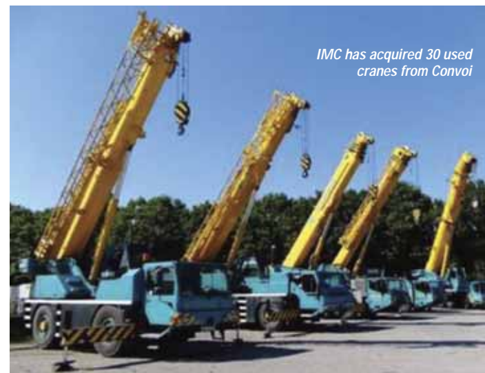
IMC has acquired 30 used cranes from Convoi

German crane dealer International Mobile Cranes (IMC) has acquired a fleet of used cranes from the Dutch-based heavy lifting and haulage company Convoi.