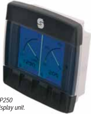
DP250 display unit.

The company has also introduced four extended memory controller models which provide increased memory and storage capacities. The models are pin-for-pin compatible with the company's standard 24, 38 and 50-pin MC controllers and available for retrofit. The main benefit of the new controllers - which are user-programmable with the Plus+1 Guide - is the larger 256KB flash