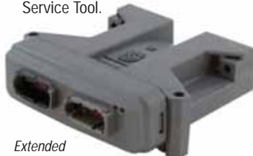
Extended memory Controller.

memory. It also provides an unlimited amount of read/writes which enables users to store positioning data, hour metres, time at level, data logging and position control as frequently as necessary. The 2MB of serial flash/vault memory is also beneficial for storing data such as machine performance, troubleshooting data and actual work hours, which can later be extracted using the Plus+1 Service Tool.