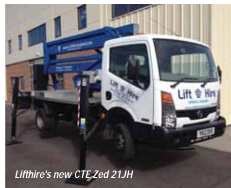
Lifthire's new CTE Zed 21JH

The Zed21JH was purchased to meet increased demand for self-drive truck mounts and will be used for window cleaning, gutter maintenance, industrial cleaning, sign installation and highways. The company liked the 21JH's compact dimensions, 300kg unrestricted platform capacity, ease of operation, articulating jib and 'H' type outrigger design.