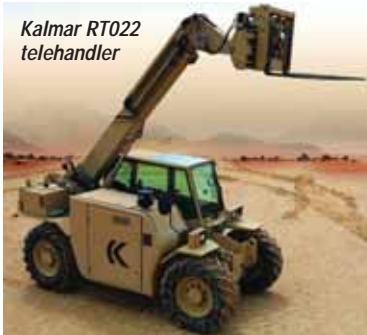
Kalmar RT022 telehandler

The company has also launched a 2.25 tonne capacity, 5.4 metre lift height RT022 military telehandler, which is designed to work in and out of ISO containers with an overall width of 1.9 metres and an overall height of two metres. It has side-shift forks, can operate in up to a metre of water and climb grades of up to 45 percent.