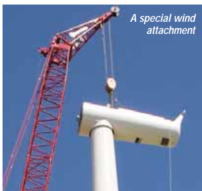
A special wind attachment

When Luxembourg-based Heerema needed to replace a 10 year old Manitowoc 2250 on one of its vessels, Lift Solutions was able to help with various modifications, including raising the operator's cab to an eye level of 5.5 metres, establishing an auxiliary electronic control system to serve as backup for crane and computer controls and installing an auxiliary hydraulic system to control the main hoist, whip hoist, swing and personnel handling winch in case of engine failure.