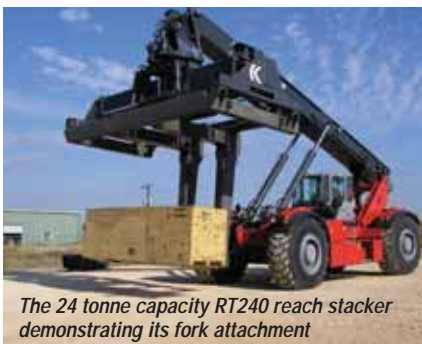
The 24 tonne capacity RT240 reach stacker demonstrating its fork attachment

Kalmar RT has shipped its first ever civilian Rough Terrain reach stackers to Western Australia. The Toll Group - one of Asia's leading logistics companies - purchased the four Kalmar RT240s for the Gorgon Project, a joint venture led by Chevron Australia to develop the greater Gorgon gas fields off the coast of Western Australia, the