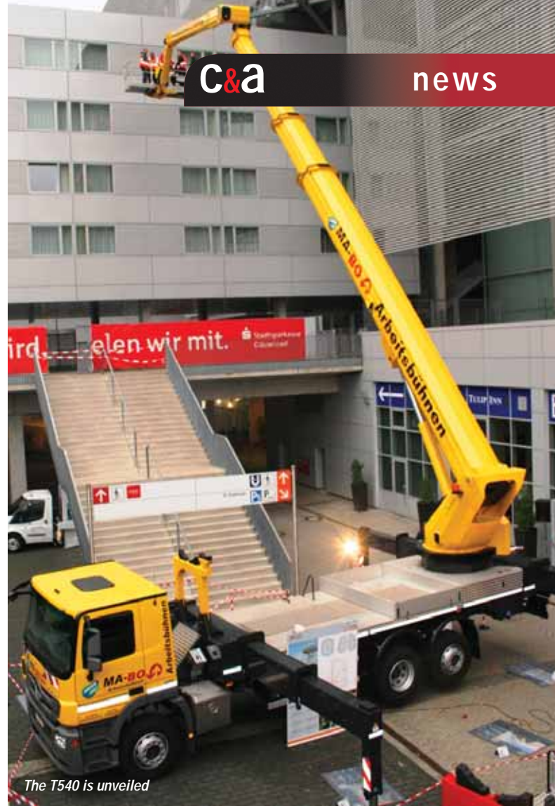
The T540 is unveiled

Both on paper and up close there is no denying that the T540 is an impressive machine with the highest working height and outreach. It also has a respectable platform capacity as well as the best outreach with maximum capacity. Having tried the T540 in wet and windy conditions the machine was very smooth and stable. The 40 metre outreach is dependent on load, slew position, and the platform size/type selected. The machine also has the widest outrigger spread which will undoubtedly affect its useable outreach. As with all machines the cost, distribution and brand preference will play a part in its success.