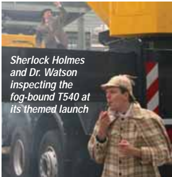
Sherlock Holmes and Dr. Watson inspecting the fog-bound T540 at its themed launch

Earlier this month German truck mounted lift manufacturer Ruthmann launched its 54 metre Steiger T540 in Düsseldorf, Germany. The T540 is the second model in the company's 'height performance' range, following the introduction of the 46 metre T460 at Intermat earlier this year. Ruthmann also confirmed the range is set to be topped with a 70 metre plus model at Bauma 2013.