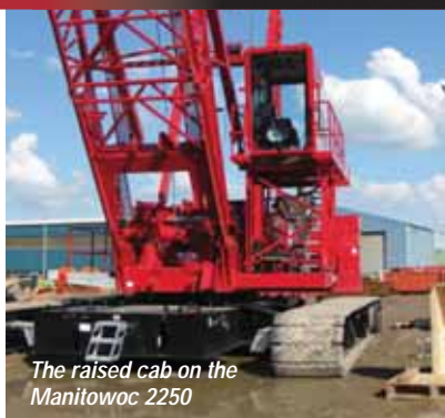
The raised cab on the Manitowoc 2250