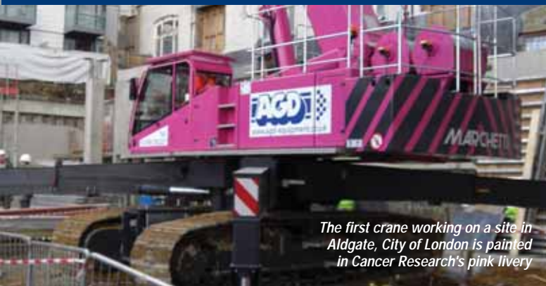
The first crane working on a site in Aldgate, City of London is painted in Cancer Research's pink livery

AGD Equipment, the UK/Ireland distributor for Marchetti cranes has taken delivery of two new crawler cranes for its rental fleet. Both are 70 tonne capacity Marchetti Sherpa CW70.42L with 42 metre main booms, however one is equipped with an access platform giving a working height of more than 50 metres.