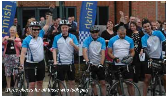
Three cheers for all those who took part

The Lavendon Group Cycle Challenge in September raised £25,000 for various charities around Europe. In total around 40 Lavendon employees took part in the event in which four mixed teams of employees from Nationwide Platforms (UK), Gardemann (Germany), Lavendon (France) and DK Rentals (Belgium) completed a 790km bike ride through each of the four countries.