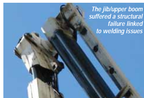
The jib/upper boom suffered a structural failure linked to welding issues

fishplate welding was associated with the failure. WorkSafe has ordered all Italmec work platforms in Australia to undergo radiographic testing of their boom and jib welds and any identified as unsafe are to be immediately removed from service.