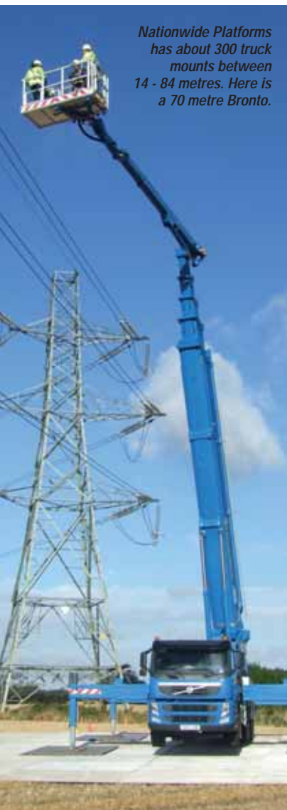
Nationwide Platforms has about 300 truck mounts between 14 - 84 metres. Here is a 70 metre Bronto.