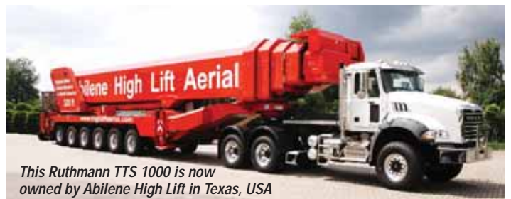
This Ruthmann TTS 1000 is now owned by Abilene High Lift in Texas, USA

companies, fire departments, high rise inspection work and local authorities for lighting and tree trimming applications. Those applications still dominate the market, but have been augmented by a dramatic rise in demand from wind farms and a steady flow of work for television coverage of major sporting and national events and cleaning work.