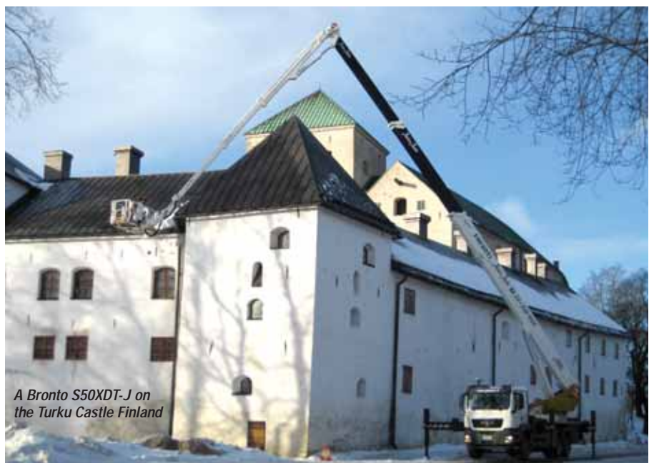
A Bronto S50XDT-J on the Turku Castle Finland