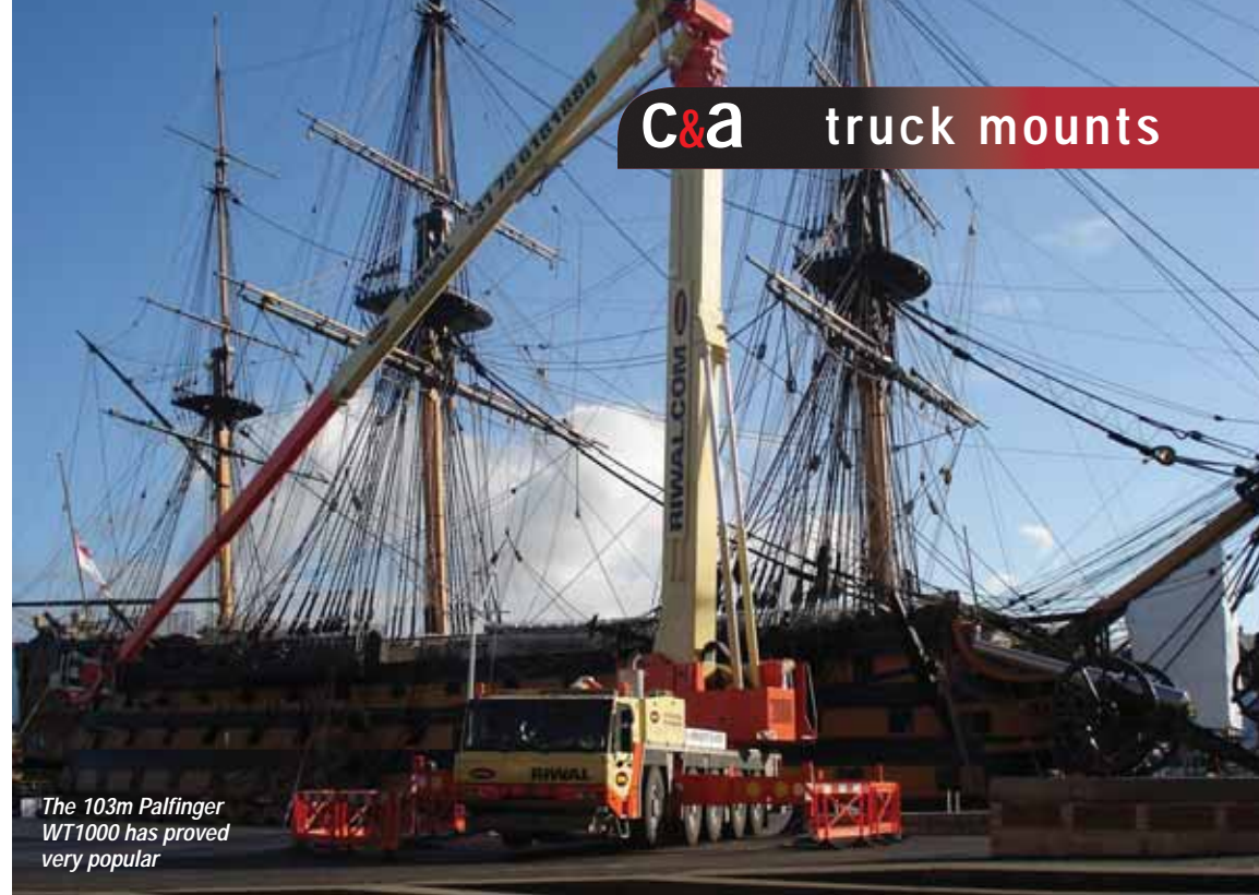
The 103m Palfinger WT1000 has proved very popular

Most recent product introductions (and anticipated launches at Bauma) have been in the 50 to 75 metre range with several new models being introduced by Bronto and Ruthmann over the past 18 months. Palfinger - which acquired Wumag in 2008 and merged the brand a year later - has been relatively quiet on large truck mounted introductions, concentrating more on its smaller and specialist (the old Bison) product range rather than the larger models. It is being particularly coy about disclosing any information about its new 90 metre platform which we expect it to unveil at Bauma following news published in the newsletter from German rental company Gerken,