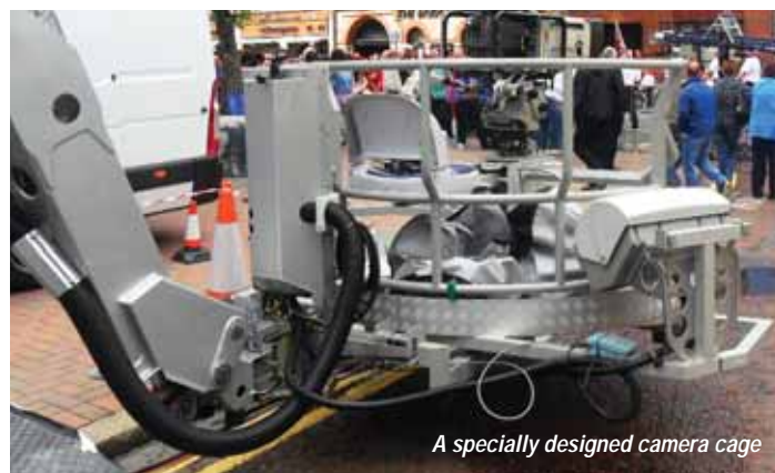
A specially designed camera cage

Almost every product feature we now write has a Chinese element. With a very small local market access equipment has yet to make an impact, although small locally produced truck-mounted lifts are built in serious volumes, but they are very much limited to local market tastes. As with other market sectors this is changing and at