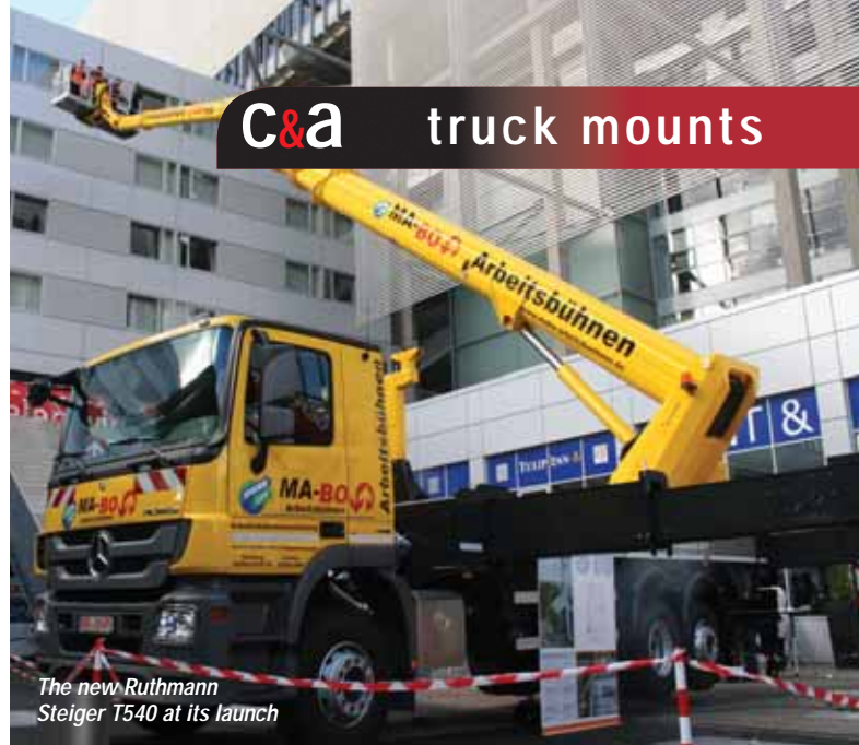
The new Ruthmann Steiger T540 at its launch

At the moment demand is such that these big machines are best owned by companies that work internationally, as demand in most countries is still too limited to keep one unit fully occupied.