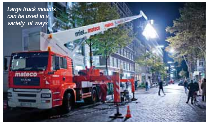
Large truck mounts can be used in a variety of ways

Their popularity and use was initially driven by demand from utility