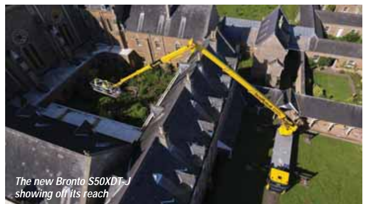
The new Bronto S50XDT-J showing off its reach

development times, early predictable cost calculations and with larger component order volumes, lower overall costs.