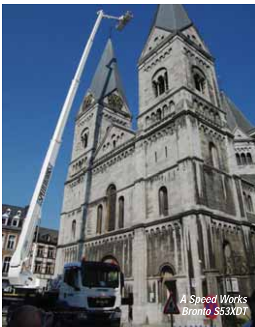
A Speed Works Bronto S53XDT

The MAN chassis includes a rear steering axle and Hydro-Drive - essentially giving four wheel steer and drive performance at speeds of less than 30kph - making the machine highly manoeuvrable and well suited for both off-road and inner city applications. With the recent success for Bronto in the UK