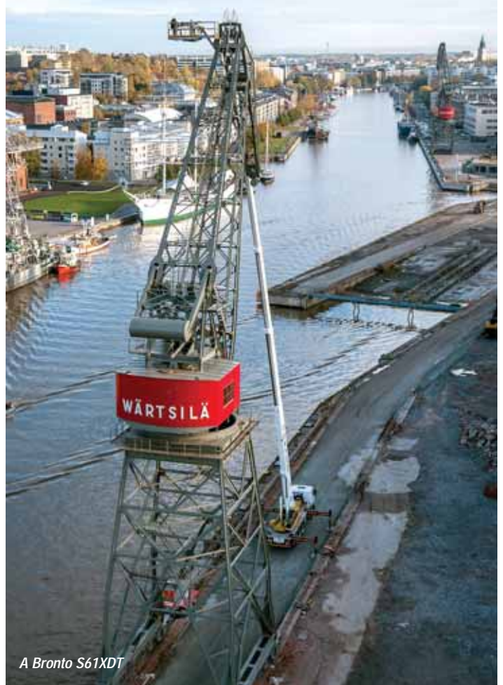
A Bronto S61XDT

The design parameters for the T540 were set using customer and operator input at the early development stage and included greater outreach, articulating jib, longer upper boom, 600kg capacity and good off-road capability. The T540 shares almost three quarters of its components with its smaller brother – the T460 - however the lower boom, superstructure, rotary joint, chassis frame and jacking system have all been redesigned. There are numerous manufacturing and production advantages of using the same parts particularly shorter