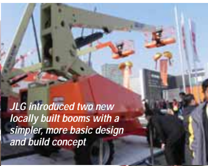
JLG introduced two new locally built booms with a simpler, more basic design and build concept