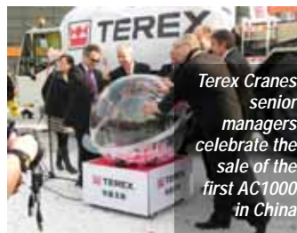
Terex Cranes senior managers celebrate the sale of the first AC1000 in China

Sinomach showed two truck cranes - the Changjiang 100 tonne TTC100G1-III and the 70 tonne TTC070G1 - that looked like Terex copies. The result of the joint venture, they no longer carry any Terex identification. Terex itself took the opportunity to launch its new 1,000 tonne AC1000 and announced its first sale in China. Other products included a new locally built 36 tonne truck crane, the Toplift 036G with 38 metre boom and 14 metre swingaway.