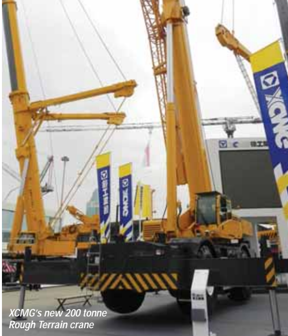
XCMG's new 200 tonne Rough Terrain crane