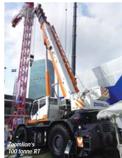
Zoomlion's 100 tonne RT