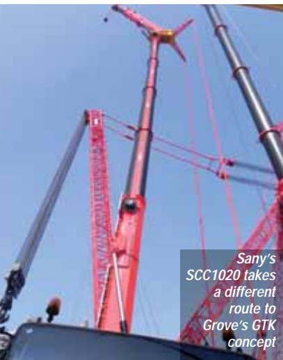
Sany's SCC1020 takes a different route to Grove's GTK concept