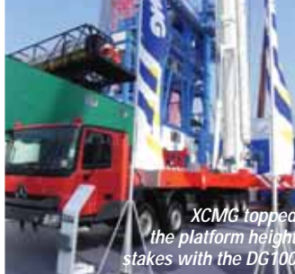
XCMG topped the platform height stakes with the DG100