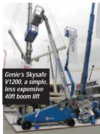
Genie's Skysafe V1200, a simple, less expensive 40ft boom lift

Genie made a splash with the launch of two new locally designed and built products - the first units in its new Skysafe range. The V1200 is a simple push-around scissor type lift with five metres working height and is joined by a 40ft non-slewing battery powered boom lift. The V1200 - which will sell for around $33,000 - is quite a bit less than the more conventional locally-built boom lifts. The company also said that confidence in boom type lifts is poor and that its aim was to offer something that is both much simpler operate and maintain, but also offers a very solid 'feel' in the platform. It expects most buyers will be those who have yet to use powered access.