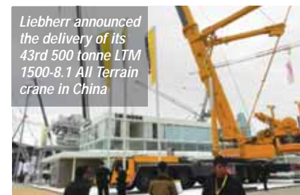
Liebherr announced the delivery of its 43rd 500 tonne LTM 1500-8.1 All Terrain crane in China