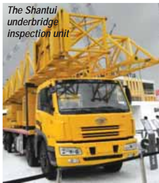
The Shantui underbridge inspection unit