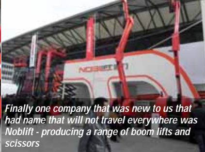
Finally one company that was new to us that had name that will not travel everywhere was Noblift - producing a range of boom lifts and scissors

JLG also introduced new locally built lifts, but took a more traditional approach with its 60ft and 80ft RS18 and RS24 boom lifts. The units are simpler more basic versions of the company's mainstream boom lifts, with a single riser and telescopic boom. They are