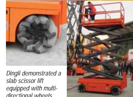
Dingli demonstrated a slab scissor lift equipped with multi-directional wheels.