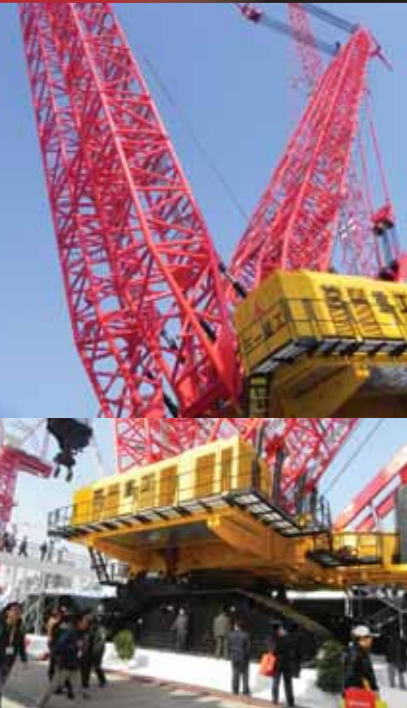
The massive 3,600 tonne Sany SCC36000A incorporates a Manitowoc 13000 type undercarriage and a boom that blends the Terex Twin concept with Liebherr 'P' boom.