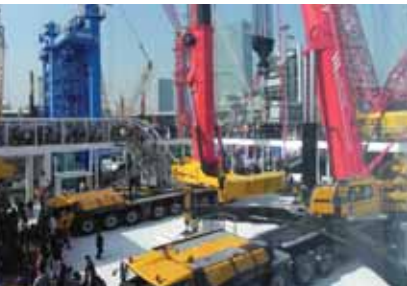
Sany's SCC1020 mobile tower crane alongside the more traditional SAC600 (foreground).

As anticipated Zoomlion showed its 2,000 tonne All Terrain crane - the ZACB01 - that uses a carrier design similar to Liebherr's LG1750, and travels on the road with just its massive outriggers. The Zoomlion carrier is a curious 11 axle concept