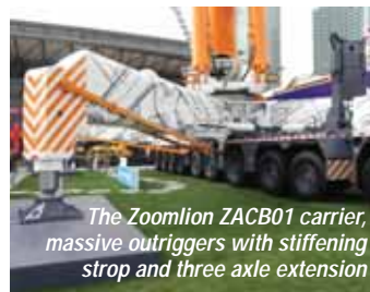
The Zoomlion ZACB01 carrier, massive outriggers with stiffening strop and three axle extension

with eight axles on the main chassis and a three axle independently powered pinned chassis extension/tag axle, which one assumes could be removed to create a shorter carrier on site? The superstructure is transported separately and features an eight section boom which has similar dimensions to most 1,000/1,200 tonne booms, and superlift suspension system. The company says that this is the only telescopic crane capable of lifting a 3MW turbine housing to full height, although it was not the only company at the show to claim this. Few details were available on the stand - this looked very much like an 'ego trip' work-in-progress project rushed out for the big show although the boom and jib were fully extended.