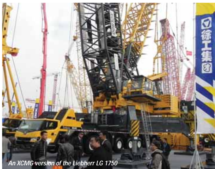
An XCMG version of the Liebherr LG 1750

a height of 96 metres and a radius of 13 metres. The unit travels with its telescopic tower in place and needs a support crane to lift and attach the top boom and install the outriggers which are transported separately.