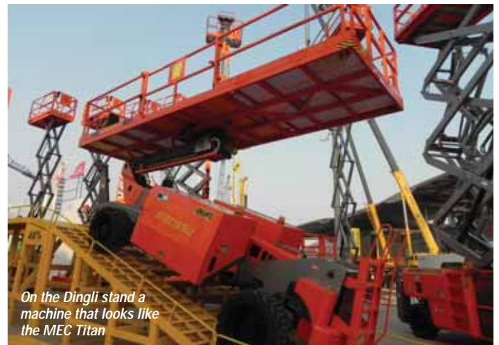
On the Dingli stand a machine that looks like the MEC Titan

industry associations - including IPAF - and manufacturers was told that China will clamp down on unsafe access equipment, including shoddy scaffolding which may help the local market to grow more quickly.