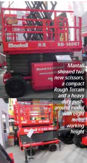
Mantall showed two new scissors, a compact Rough Terrain and a heavy duty push-around model with eight metre working height