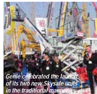
Genie celebrated the launch of its two new Skysafe units in the traditional manner

Aichi, recently absent from Europe, was out in force its most notable model on display being a 40ft battery powered articulated boom lift. Nearby the largest dedicated access stand was that of Dingli. Packed full of equipment it was also the most dynamic with constant demonstrations and busy with