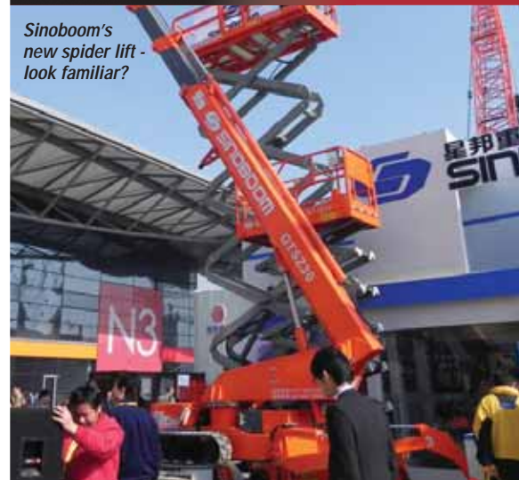
Sinoboom's new spider lift - look familiar?

The Chinese market for Rough Terrain cranes is virtually non-existent and yet Zoomlion, Sany, XCMG and others all showed new models. XCMG claimed the world's first 200 tonne RT with a 62 metre main boom and yet it looks no bigger or stronger than a typical 90 tonne unit. XCMG also showed a 100 and 160 tonne RT as well as unveiling a 5,000 tonne metre All Terrain the XCA 5000 with 105 metre main boom, said to be capable of placing 3.6MW nacelles. The company also showed a 500 tonne crawler crane that features a variable counterweight system similar to the Manitowoc 13000. Zoomlion showed a 100 tonne Rough Terrain, a very competent looking machine that should do well in developing markets and perhaps North America. Adding to the Rough Terrain break out, Sunward showed an extensive range of Rough Terrain cranes as well as a telescopic boomed crawler crane, one of several such machines on display at the show.