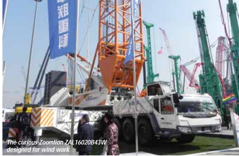
The curious Zoomlion ZAL16020B43W designed for wind work

Zoomlion also showed an exceptionally curious crane designed for wind work that combines a regular looking eight axle All Terrain crane carrier with a large lattice telescopic luffing tower crane with wind tip. The net visual effect of the ZAL16020B43W is of an over-inflated 1960s/70's tower crane on a relatively modern AT