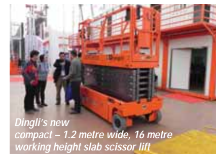
Dingli's new compact - 1.2 metre wide, 16 metre working height slab scissor lift

visitors the whole time. The locally based manufacturer is obviously in a confident mood and claims clear leadership in China. In addition to the two models already mentioned the real star of the show was a 16 metre working height compact scissor lift that incorporates an innovative scissor arm construction to keep weight down, without sacrificing rigidity or strength. With an all up weight of 2,700kg it uses standard mini slab scissor components which will give it a significant cost advantage at this height. The downside is that platform capacity is reduced to 200kg and the platform is only 810 mm wide, so it will not suit all applications. The company also showed a one armed sigma type lift, the GTAX06S which has a six metre working height, 4x4 and a scissor equipped with multi-directional wheels - a concept that has been around for more than 20 years and has still to find a market.