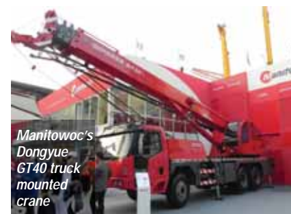
Manitowoc's Danyue GT40 truck mounted crane

Other new models from Sany included a telescopic mobile tower crane that has echoes of Grove's GTK1100, but uses a traditional slewing superstructure, halving the number of tower support pendants required from four to two. Like the GTK this unit is aimed at wind turbine work and offers a 100 metre maximum hook height, with 55 tonnes capacity at 10 metre radius. Alternatively it can lift 100 tonnes to