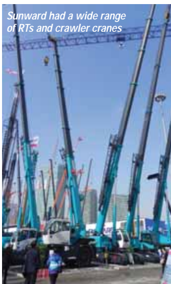
Sunward had a wide range of RTs and crawler cranes

The Chinese market for Rough Terrain cranes is virtually non-existent and yet Zoomlion, Sany, XCMG and others all showed new models. XCMG claimed the world's first 200 tonne RT with a 62 metre main boom and yet it looks no bigger or stronger than a typical 90 tonne unit. XCMG also showed a 100 and 160 tonne RT as well as unveiling a 5,000 tonne metre All Terrain the XCA 5000 with 105 metre main boom, said to be capable of placing 3.6MW nacelles. The company also showed a 500 tonne crawler crane that features a variable counterweight system similar to the Manitowoc 13000. Zoomlion showed a 100 tonne Rough Terrain, a very competent looking machine that should do well in developing markets and perhaps North America. Adding to the Rough Terrain break out, Sunward showed an extensive range of Rough Terrain cranes as well as a telescopic boomed crawler crane, one of several such machines on display at the show.