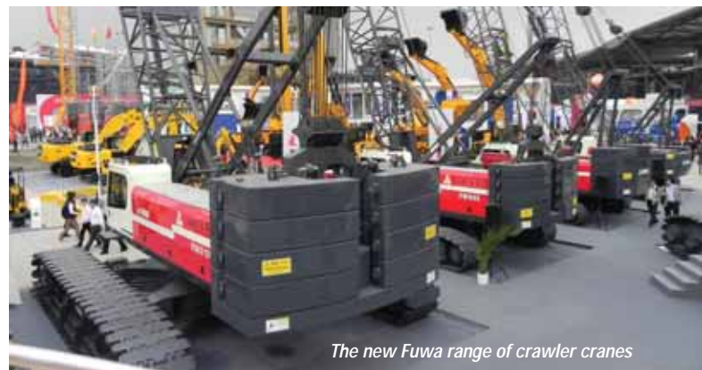
The new Fuwa range of crawler cranes