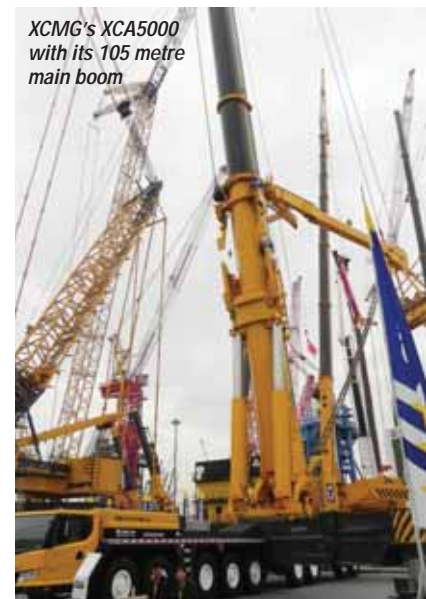
XCMG's XCA5000 with its 105 metre main boom