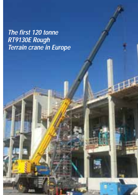
The first 120 tonne RT9130E Rough Terrain crane in Europe

The RT9130E features a 48.5 metre five section main boom and an 11 to 33.8 metre bi-fold swing-away extension which offers a maximum tip height of 85 metres. The other Grove cranes joining the Havator fleet are All Terrains, including a 95 tonne GMK 5095, a 130 tonne GMK 5130, a 170 tonne GMK 5170 and a 220 tonne GMK 5220.