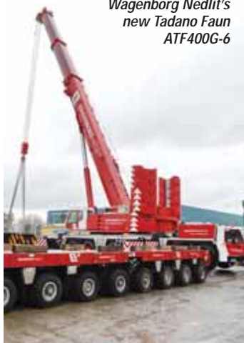
Wagenborg Nedlift's new Tadano Faun ATF 400G-6

The six axle crane, supplied through Tadano Faun's Benelux distributor Waterland Trading, features a five section 60 metre main boom and a 31 metre swingaway extension. It is capable of lifting 360 tonnes at a three metre radius and 400 tonnes at 2.7 metres. Tadano Faun's Lift Adjuster is standard. Improved safety features include a flat deck, guardrails and steps and a TRAM fall arrest harness attachment system allowing, the operator to be securely tethered down the whole length of the main boom.