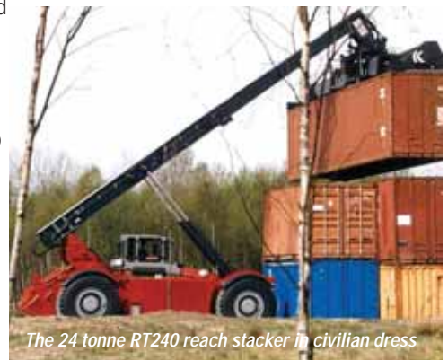
The 24 tonne RT240 reach stacker in civilian dress

Kalmar moved production to its Cibolo in 2008 in order to increase product availability and reduce lead times. The company recently shipped its first civilian RT240 to Western Australia.