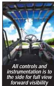
All controls and instrumentation is to the side for full view forward visibility

seven RTH rotating telehandlers with lift heights from 18 to 30 metres and two heavy duty HTH telehandlers with lift capacities from 15 to 30 tonnes with a third available later in the year.