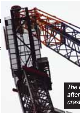
The crane after the crash

Just a few days after the incident, work began to remove the damaged tower crane with Ainscough Crane Hire providing a 600 tonne Terex TC2800-1 rigged with its maximum 192 metres of boom and jib, which proved just enough to remove the crane jib and other parts. In this configuration it can lift about 20 tonnes at a 46 metre radius.