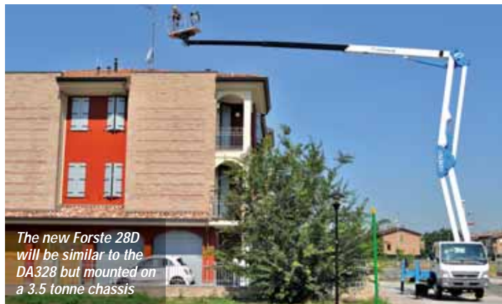
The new Forste 28D will be similar to the DA328 but mounted on a 3.5 tonne chassis

Platform capacity will be 225kg, while the maximum outreach is 14.5 metres, a metre shorter than the DA328. H-frame outriggers front and rear allow the operator to optimise the machine's footprint in order to obtain the best possible performance for the available space. The platform controls are electro-hydraulic and the working envelope automatically adjusts to the footprint used.