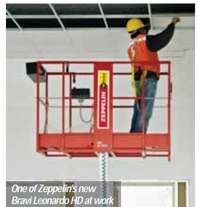
One of Zeppelin's new Bravi Leonardo HD at work

German rental company Zeppelin Rental has placed an order with Bravi for 100 Leonardo HD self-propelled lifts. The units - some of which have already been delivered - provide a fully self-propelled maximum working height of 4.9 metres with 180kg platform capacity. Zeppelin Rental - which is a CAT Rental Store franchise - operates throughout Germany, Austria, Russia, Slovakia and Czech Republic.