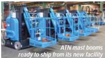
ATN mast booms ready to ship from its new facility