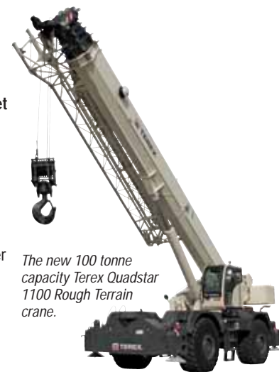
The new 100 tonne capacity Terex Quadstar 1100 Rough Terrain crane.

Terex says that the dual mode double keel boom allows either the lighter top sections to be extended for higher capacities at long radii or to the stronger sections first, for higher capacities at shorter radii. The hydraulic system has also been redesigned to reduce the number of potential leak points and make servicing easier.