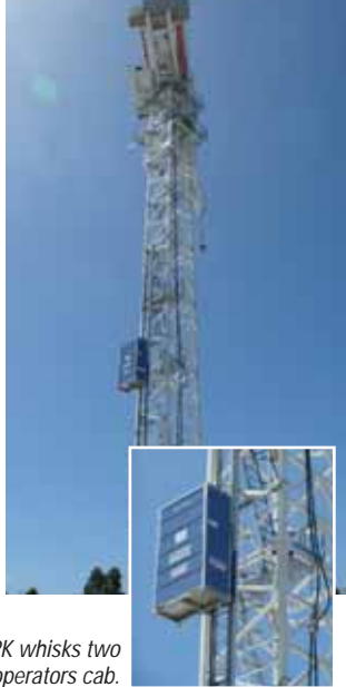
The Geda 2 PK whisks two people to the operators cab.

The first 200kg capacity Geda 2 PK tower crane hoist in Australia has been delivered to the CFMEU training centre in Melbourne, Victoria and will be used by the CFMEU union together with a new Liebherr tower crane which has been installed for operator and service technician training purposes. The union provides a comprehensive range of training programmes for all CFMEU members employed in the construction industry.