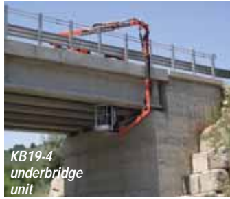
KB19-4 underbridge unit

As a spider crane with a maximum capacity of 995kg, the KB19-4 has a maximum tip height of 14.6 metres -16 metres with searcher hook - while the KB22-4 has a 17 metre maximum working height and 18.5 metres with searcher hook.