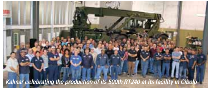
Kalmar celebrating the production of its 500th RT240 at its facility in Cibolo

Kalmar RT has produced its 500th RT240 Rough Terrain reach stacker at its Cibolo, Texas facility. Originally produced in Sweden back in 1999, the RT240 was designed for the United States Armed Forces and is capable of handling 20 and 40ft ISO containers on a wide variety of ground conditions. It is able to stack containers weighing 24 tonnes three high in the first row and those weighing up to 12.5 tonnes three high in the second row.