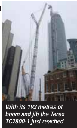
With its 192 metres of boom and jib the Terex TC2800-1 just reached