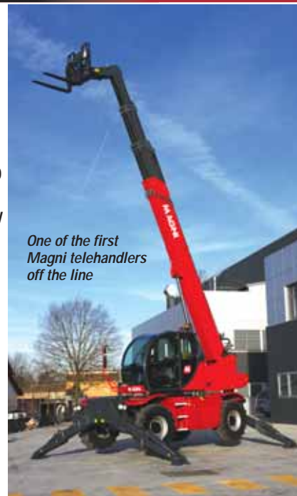
One of the first Magni telehandlers off the line

Its new 6,000 square metre production facility has a capacity of around 1,000 units a year, and will build a range of