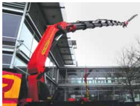
The PK200002 L has a maximum reach of 50 metres.

fully equipped, depending on the vehicle used. The first unit has been purchased by Rachbauer CraneForce of Salzburg, Austria.