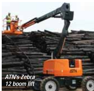
ATN's Zebra 12 boom lift