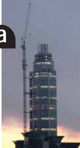
St Georges - the tower crane before the crash