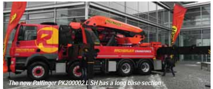
The new Palfinger PK200002 L SH has a long base section