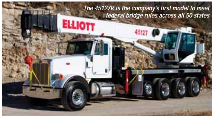
The 45127R is the company's first model to meet federal bridge rules across all 50 states