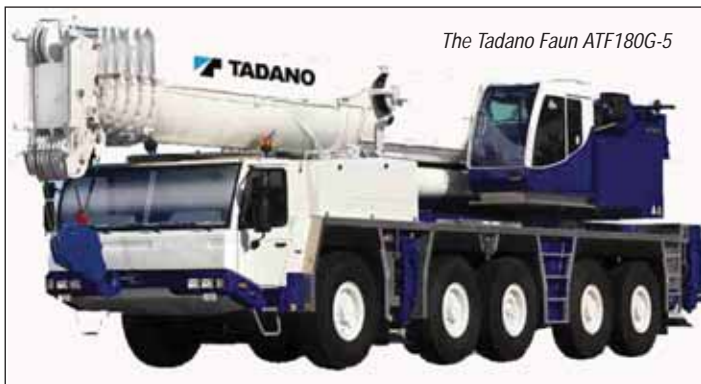
The Tadano Faun ATF180G-5