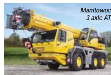
Manitowoc 3 axle AT