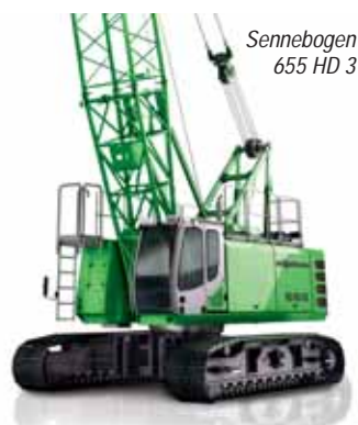
Sennebogen 655 HD 3

German crane and materials handling company Sennebogen will have 10 machines on its stand,