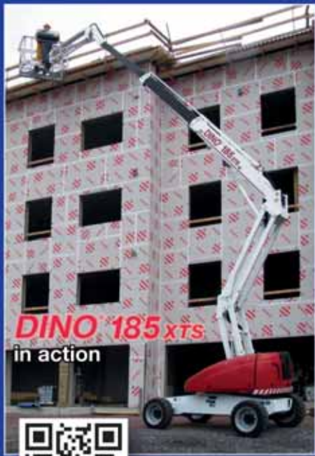
DINO 185 xts in action