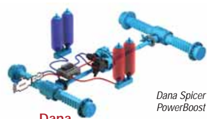
Dana Spicer PowerBoost