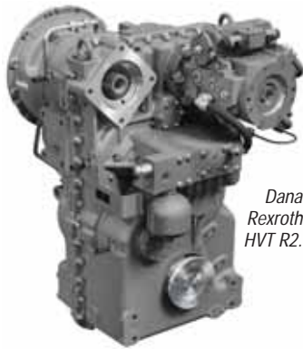
Dana Rexroth HVT R2.

Dana will launch the Spicer PowerBoost and Hydro-mechanical Variable Transmission (HVT). The Spicer PowerBoost is a new hydraulic hybrid powertrain concept that captures kinetic energy which would otherwise be wasted in an accumulator which is then available as additional power for the vehicle. Fuel savings of between 20 and 40 percent are claimed. The system can also reduce ownership costs by reducing the size of the engine. Dana Rexroth Transmission will show the new High-Efficiency R2 HVT Transmission Platform - the latest powersplit system resulting from its 50-50 joint venture between Dana and Bosch Rexroth.