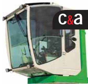
Sennebogen 8130 - Mastercab

including two new telescopic crawler cranes and an updated 300 tonne 7700 lattice boom crawler. Also on the stand will be two new heavy duty cycle crawler cranes and the 8130 EQ - a long boom material handling machine with innovative rotating counter balance weights. Also look out for the new Mastercab - said to be the biggest cab in its class - and the new intelligent control system, Sencon.