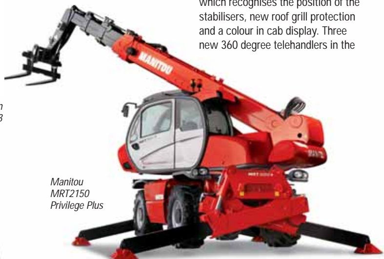
Manitou MRT2150 Privilege Plus

Manitou has made great strides in reducing lead times on its telehandlers and will be showing three new Privilege Plus 360 degree telehandlers - the 1850+, 2150+ and the 2540+ - with stage IIIB Mercedes engines. Features include the new attachment recognition system, adaptive load recognition which recognises the position of the stabilisers, new roof grill protection and a colour in cab display. Three new 360 degree telehandlers in the