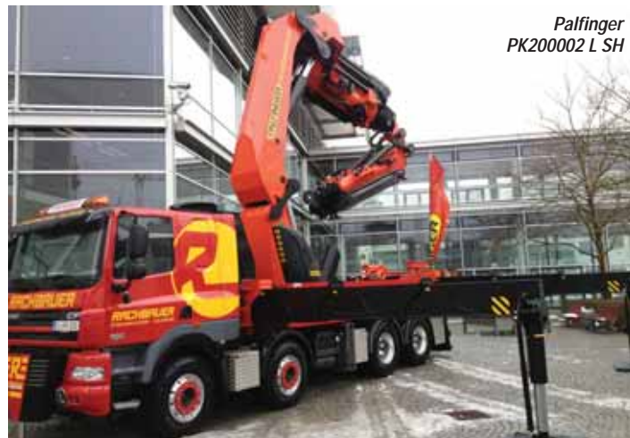
Palfinger PK200002 L SH

With two stands at the show - one for loader cranes and one for truck mounted platforms. So far the only product announced is the company's largest knuckle boom crane to date - the PK 200002 L SH - with its nine section polygon shaped boom, which when coupled to a new eight section PH 300 L jib can lift around 600kg at 51 metres radius or height. A fully integrated EN280 work platform is also provided for in the standard