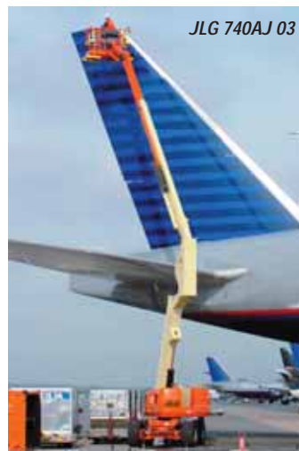
JLG 740AJ 03

is purpose-built for aircraft maintenance duties it incorporates a fall arrest rail around the top of the platform, allowing operators outside of the platform while remaining tethered. It is also equipped with the Soft Touch option - a padded sensing rail below the platform that cuts operation when activated - reduces the risk of damaging the aircraft during maintenance work.