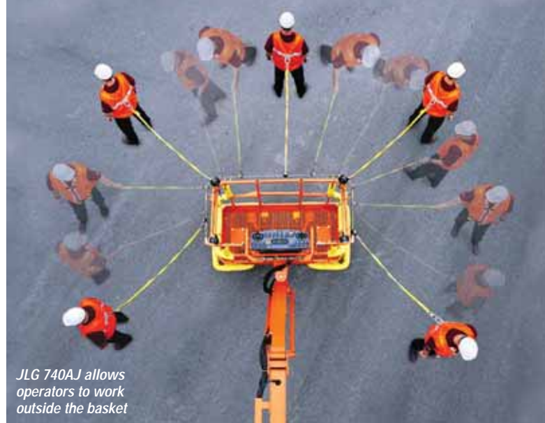
JLG 740AJ allows operators to work outside the basket

JLG will show its 24.6 metre articulated JLG 740AJ boom which