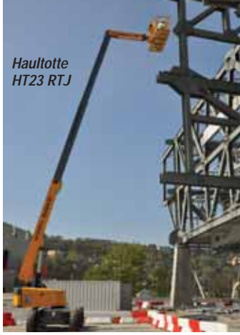
Haultotte HT23 RTJ

The company will also show an upgraded - 2013 model - version of its largest articulated boom - the 32 metre HA32 PX. The HTL telehandler range will be displayed with new Tier IV engines and improved cabs.