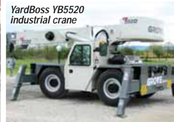
YardBoss YB5520 industrial crane

axle unit. The new 100 tonne Quadstar 11000 Rough Terrain crane with 47.24 metre main boom, and 650 tonne Superlift 3800 crawler crane will also be on show together with a new flat-top tower crane.