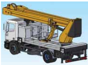
Isoli moves up the size range with its new 36 metre PTJJ 36.27

The PTJJ36.27 will be mounted on an 18 tonne two axle truck and employ a three section telescopic boom, two section telescopic jib and short articulated end jib with 155 degrees of articulation. Platform capacity is 400kg and maximum outreach 27 metres. Isoli has been out of the big truck mounted lift market for several years as it focussed on revamping its smaller models. Having launched eight new models with working heights of 23 metres or less over the past three years, it says that it feels the time is right to move back into the big truck mounted market.