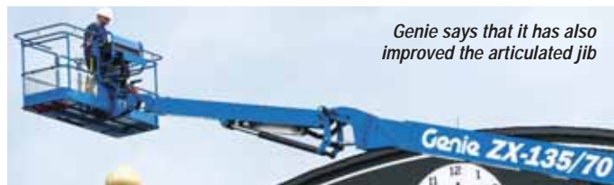
Genie says that it has also improved the articulated jib