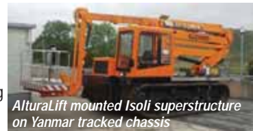
AlturaLift mounted Isoli superstructure on Yanmar tracked chassis

Until last year it was the Isoli distributor for Ireland and sold a number of the company's 28 metre PNT280J booms mounted on Yanmar tracked chassis. It also claimed to have the only di-electric testing facility in Ireland for insulated aerial devices. O'Donnell is now working as a sales agent for Mantis cranes.