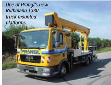
One of Prangl's new Ruthmann T330 truck mounted platforms