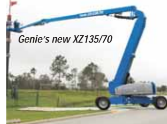
Genie's new ZX135/70