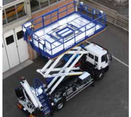
A Sky Aces Fanlift.

Palfinger Platforms Italy will also take over the distribution of all Palfinger access products in Italy, while the new Italian-built products will be distributed outside of Italy through Palfinger's distribution network. Palfinger chief executive Herbert Ortner said: "We are pursuing two objectives with this joint venture. First, we want to open up the large and strongly growing market for access platforms on smaller trucks. Secondly, through Palfinger Platforms Italy, we are planning to intensively develop the Italian market, which is of importance to us."