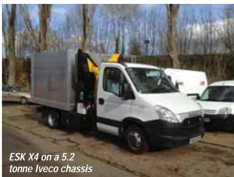
ESK X4 on a 5.2 tonne Iveco chassis

payload. The company has also taken delivery of the X4, a smaller platform mounted on 4x4 Mitsubishi L200 chassis, available as either an open pick-up or with lockable storage compartments.