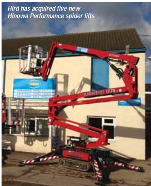
Hird has acquired five new Hinowa Performance spider lifts

Böcker's truck mounted range consists of six machines with lifting heights between 28 and 44 metres and lift capacities from 1.2 to six tonnes. Its five model trailer crane range offers lift heights from 25 to 34 metres with capacities from 800kg to 1.8 tonnes. Kranlyft will also provide parts and support service for new and existing machines.