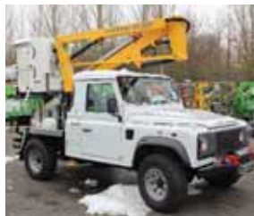
Niftylift has taken an order for 23 Land Rover mounted V130T 13 metre booms