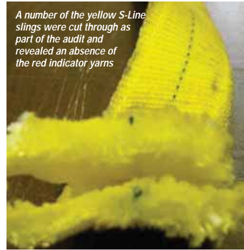
A number of the yellow S-Line slings were cut through as part of the audit and revealed an absence of the red indicator yarns