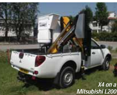
X4 on a Mitsubishi L200

Affordable Access, the UK distributor for Co.Me.t access equipment has taken delivery of several new platforms, including the all new ESK X4 - a 12 metre, sideways stowed platform mounted on a 5.2 tonne Iveco chassis.