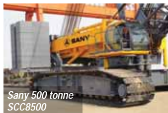
Sany 500 tonne SCC8500

The crane has a full complement of attachments and options including fixed jib, luffing jib and the Sany UltraLift package.