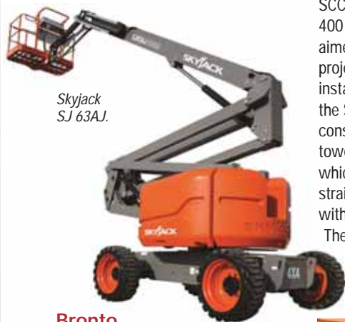
Skyjack SJ 63AJ.

This will be the first chance to see Skyjack's new 63ft SJ 63AJ articulated Rough Terrain boom in Europe. The SJ 63AJ has a platform height of 63.5ft for a working height of 21.3 metres and offers up and over clearance of 8.3 metres with a maximum of 12.2 metres of outreach. The open centre/over centre sigma type riser provides the SJ 63AJ with a stowed height of 2.54 metres and below ground reach. Overall machine weight is 9.6 tonnes. Other features include differential locks on the axle drive system, direction sensing drive and steer controls.