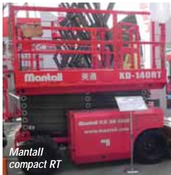
Mantall compact RT

Another Chinese manufacturer at the show for the first time, expect to see a mix of both booms and scissor lifts.