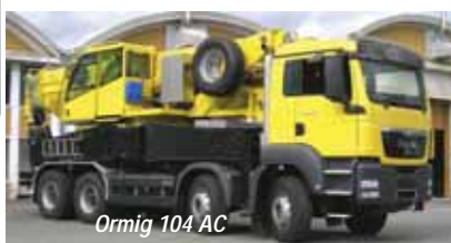
Ormig 104 AC

Ormig is planning to show a new truck crane - the 104AC - which has a 100 tonnes maximum lift capacity and weighs 32 tonnes making it easier to travel throughout Europe. It will also show a selection of pick & carry cranes from its range - both electric and diesel - from 5.5 to 60 tonnes.