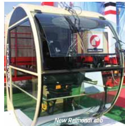
New Raimondi eab

Three new products will feature on the stand of Italian tower crane manufacturer Raimondi Cranes. The MRT 144 flattop crane will be displayed on a 4.5 metre cross base with a 65 metre jib. The crane features the "AS40-08t-s" which allows a maximum eight tonnes lift capacity with a gearless hoist motor in single reeving/two fold mode. At maximum radius the crane can handle 1.4 tonnes, it can also be equipped with other hoist motor configurations allowing up to a 60hp inverter with 10 tonnes maximum capacity and 780 metres of hoist rope. The MRT111 flattop crane will be displayed at ground level. It has a maximum jib of 60 metres and can lift up to eight tonnes and almost 1.4 tonnes at its jib tip.