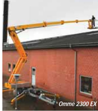
Omme 2300 EX

Ommelift will be out in force at Bauma with a wide selection of spider and trailer lifts, including the 25 metre 2500 RXBDJ articulated spider lift with new Kubota diesel/battery electric Hybrid power pack. The lift, offers an outreach of up to 13 metres, zero tail swing and seven metres of free up-and-over clearance at full outreach. The company will also show its recently launched 23 metre 2300 EXB