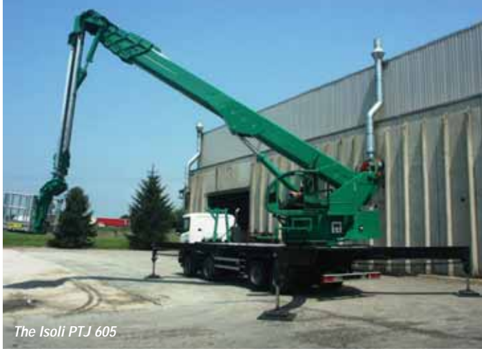
The Isoli PTJ 605