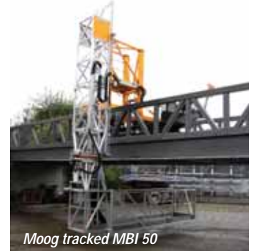
Moog tracked MBI 50

Specialist German underbridge platform manufacturer Moog we will be showing its latest tracked MBI 50 as well as its biggest bucket type unit - the MBL 1750 - and the midsize MBI 110.