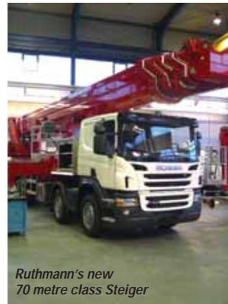
Ruthmann's new 70 metre class Steiger

Ruthmann will undoubtedly have several new models but the centre of attraction will be its 70 metre class Steiger which will be mounted on a four axle Scania which will be unveiled at the show. Also on the stand will be the recently released T540 - which has already had 50 orders - and the T460.