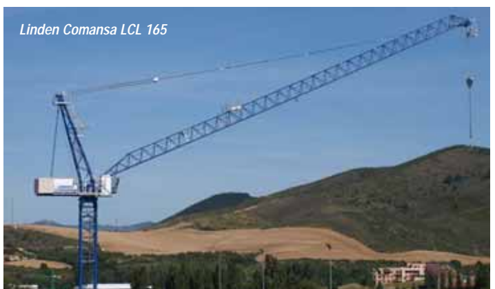
Linden Comansa LCL 165

Spanish tower crane manufacturer Linden Comansa will exhibit its 16 LC 260 Flat-Top tower crane from its LC1600 Series and a LCL 165 luffing-jib crane for the first time. One of the advantages of the LC cranes is the rapid assembly process and the PowerLift system. Launched last year the system allows the crane to move the load to a greater jib length with reduced