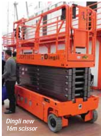
Dingli new 16m scissor

A first time Bauma exhibitor, Dingli's main aim is to find more dealers for its range of boom and scissor lifts. The star of the stand for most European visitors will be its new 16 metre working height compact scissor lift - in US nomenclature terms a 4647 - 46ft platform height and 47 inches wide.