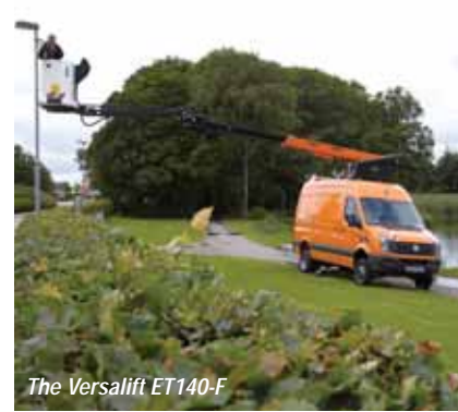
The Versalift ET140-F

Time Manufacturing/Versalift will launch six models at Bauma and show the following units: an ET-120 mounted on a 3.5 tonne MB Sprinter, an ET-140-F also on a MB Sprinter and a VT-155-FZ and VDT-170-F from its heavy duty line, both mounted on five tonne Mercedes Sprinter vans. The main attraction will be the new VTX-240 with 24 metres working height and up to 12 metres of outreach, featuring both a telescopic upper and lower boom and a perfectly parallel lift from ground level up to 21 metres, while also able work up to three metres below ground level. Mounted on a Mercedes Sprinter, the transport height is only 2.35 metres. Additional features include short jacking within the vehicle's width,