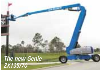
The new Genie ZX135/70

Genie will be focusing much of its effort on big machines including a new straight telescopic boom lift which we believe will top the market with a 170ft platform height the SX170? - with a 53 metre working height. You will also see the updated Z135/70 on the big booms chassis, dubbed the ZX135/70.