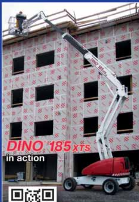
DINO 185XTS in action