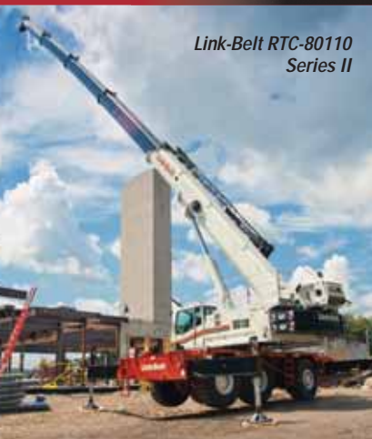
Link-Belt RTC-80110 Series II