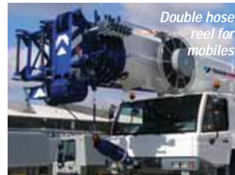
Double hose reel for mobiles

Mobile energy supply and data transmission system manufacturer Conductix-Wapfler will show its double hose reel for mobile cranes with hydraulic luffing jibs. (see Innovations page 63)