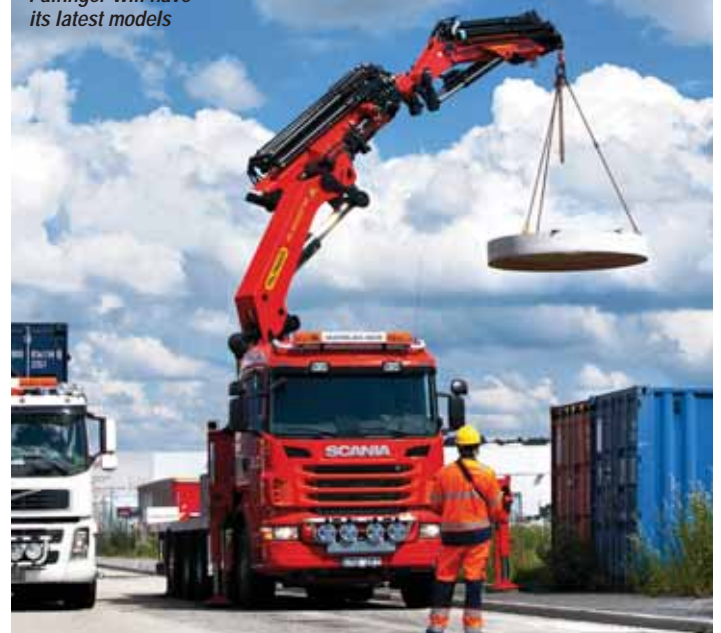
Palfinger will have its latest models

Onto the non-powered access sector and PASMA members are back - this time in an