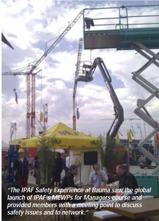
"The IPAF Safety Experience at Bauma saw the global launch of IPAF's MEWPs for Managers course and provided members with a meeting point to discuss safety issues and to network."