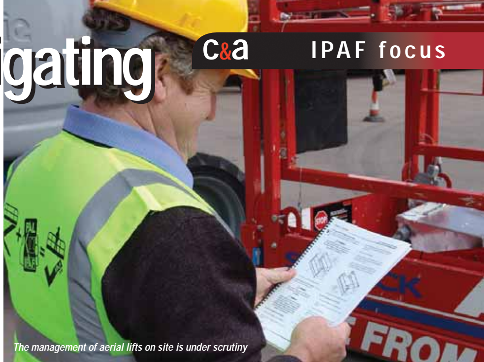
The management of aerial lifts on site is under scrutiny

The UK Health & Safety Executive's Construction Division is investigating the way aerial work platforms are being used and managed on construction sites.