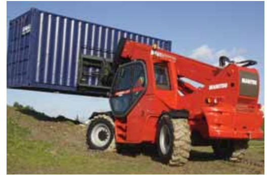
One Call's latest telehandler order includes four 12 tonne capacity Manitou MHT10120s.