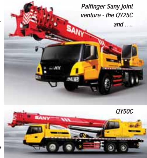
The first fruits of the Palfinger Sany joint venture - the QY25C and ...

Palfinger says that its quality managers have supervised the production of the new cranes in Changsha, in order to ensure that they meet European standards. The cranes meet Euro 4 requirements and already have a full set of GOST certification for the Russian market. The cranes carry a 2,250 hour or 18 months warranty with spare parts and components stocked at a warehouse in Moscow. A local Russian sales and technical support team has also been put in place, ready for the launch.