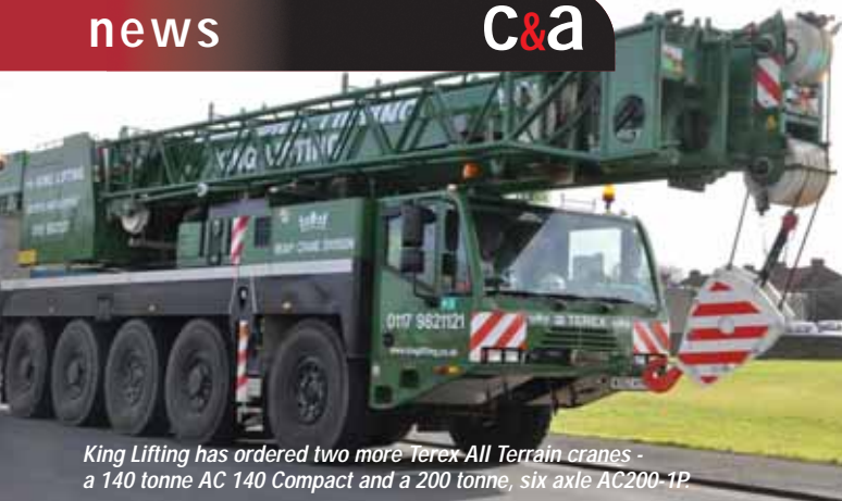
King Lifting has ordered two more Terex All Terrain cranes - a 140 tonne AC 140 Compact and a 200 tonne, six axle AC200-1P.