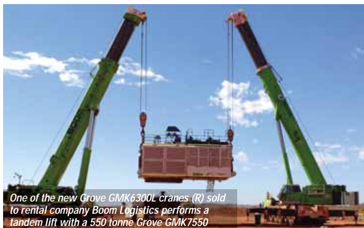
One of the new Grove GMK6300L cranes (R) sold to rental company Boom Logistics performs a tandem lift with a 550 tonne Grove GMK7550