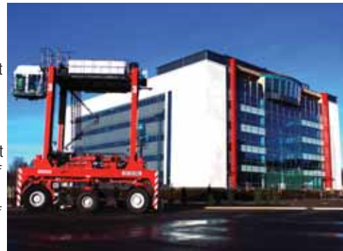
The Cargotec/Kalmar Technology and Competence Centre in Tampere, Finland.