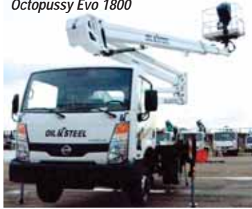
Oil&Steel's 18 metre Octopussy Evo 1800

Mantis Access will initially concentrate on the sale of truck mounted platforms and spider lifts as well as develop a market for larger platforms mounted on All Terrain tracked carriers. The new business and relationship will be officially launched at Vertikal Days.