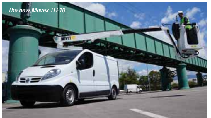
The new Movex TLF10