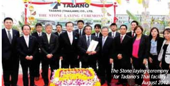
The Stone laying ceremony for Tadano's Thai facility - August 2012

Call direct or scan here to organise your demo!