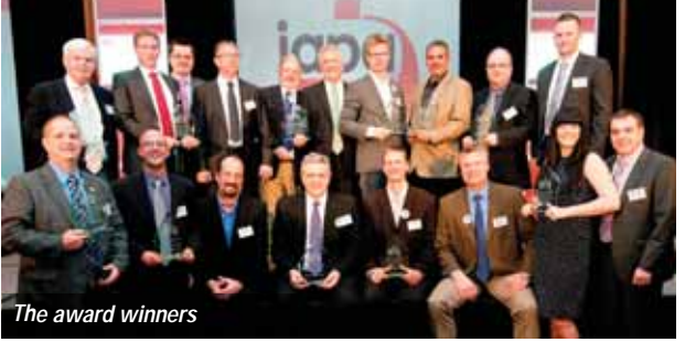
The award winners