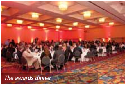
The awards dinner