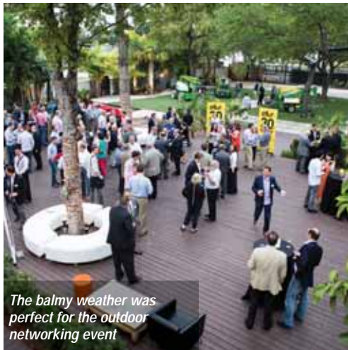
The balmy weather was perfect for the outdoor networking event