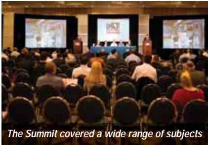
The Summit covered a wide range of subjects