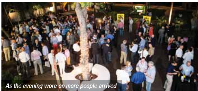
As the evening wore on more people arrived