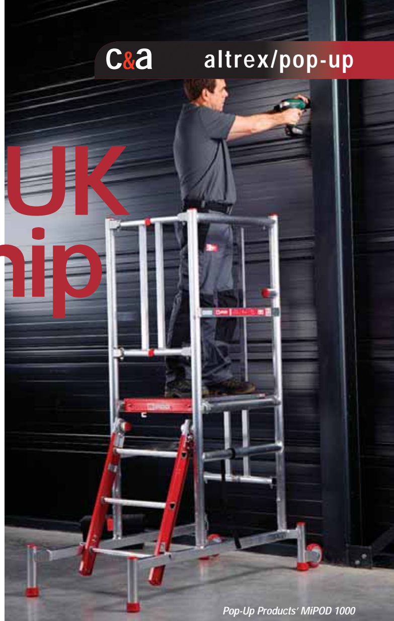
Pop-Up Products' MiPOD 1000

The self-contained MiTOWER offers working heights of four, five or six