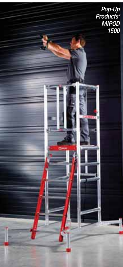
Pop-Up Products' MiPOD 1500