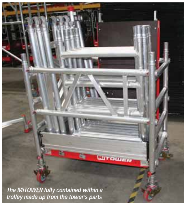
The MITOWER fully contained within a trolley made up from the tower's parts