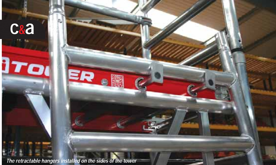
The retractable hangers installed on the sides of the tower

"There is still work to do on one man installations in the market and training in this area is something that will also develop over time," adds Woodger. "Getting people used to a product that is so small and portable yet built to an EN1004 Class 3 standard will take time. We feel we have spotted an opportunity in the market with the MITOWER as it is a product both lightweight and compact in size which provides excellent capabilities up to six metres."