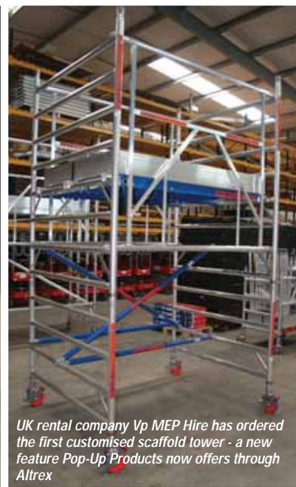
UK rental company Vp MEP Hire has ordered the first customised scaffold tower - a new feature Pop-Up Products now offers through Altrex