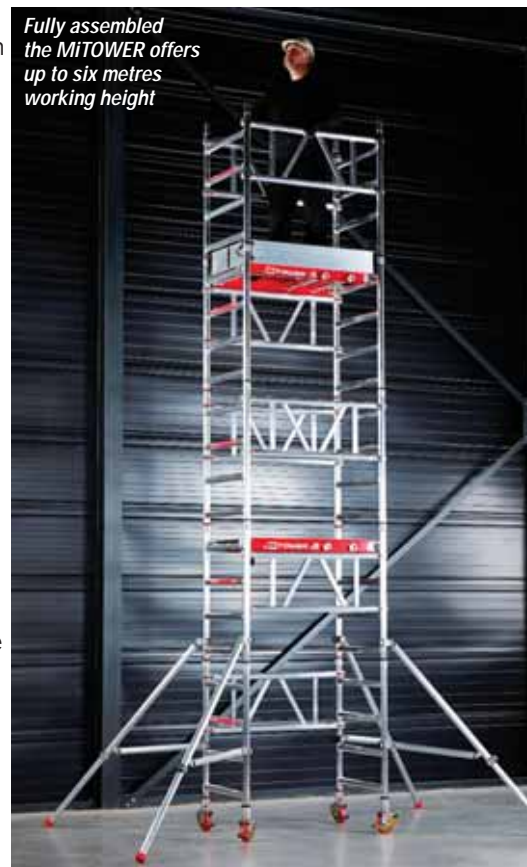
Fully assembled the MiTOWER offers up to six metres working height